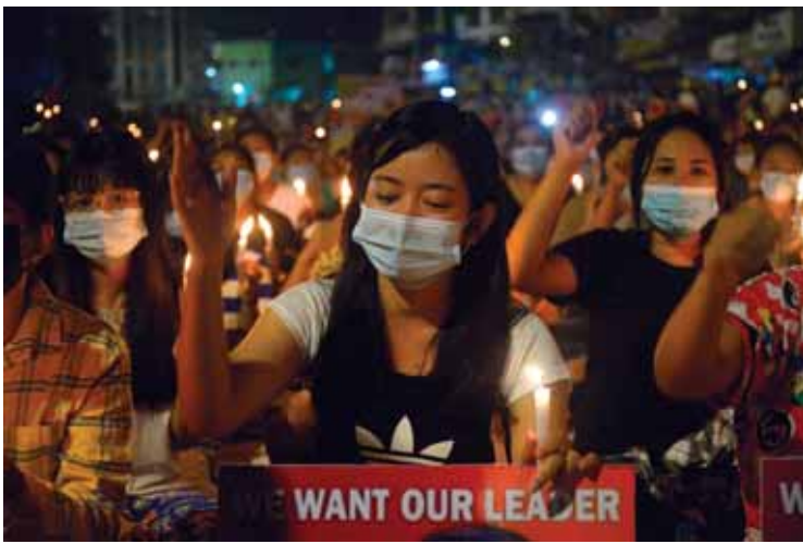
Protesters attend a candlelight night rally in Yangon, Myanmar on Saturday

Reports on social media also said three people were shot dead Friday night in Yangon, Myanmar's largest city, where residents for the past week have been defying an 8 pm. Curfew to come out on the streets. Two deaths by gunfire were reported in Yangon's