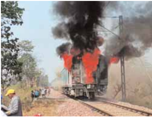
Fire breaks out on a coach of Dehradun-Delhi Shatabdi Express Train near Kasro railway station in Dehradun district on Saturday

"Guard has informed that all passengers are safe and the fire brigade was informed. A