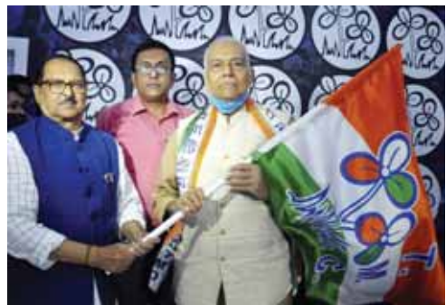
West Bengal Panchayat and Rural Development Minister Subrata Mukherjee (L) hands over the party flag to former BJP leader Yashwant Sinha (R) after he joined Trinamool Congress Party ahead of West Bengal Assembly elections in Kolkata on Saturday

The 83-year-old veteran IAS officer-turned politician, who left the BJP in 2018, said he is joining the Trinamool at a crucial juncture when "the country is facing an unprece-