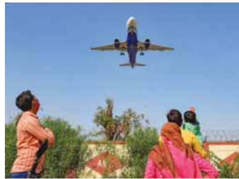
People look on as a passenger airplane approaches to land at a airport in Ahmedabad on Saturday

In a circular, the DGCA has directed airport officials and security personnel to ensure that no one is allowed to enter the airport without wearing a mask and everyone must maintain social distancing norms at all times during air travel. The Airlines have to