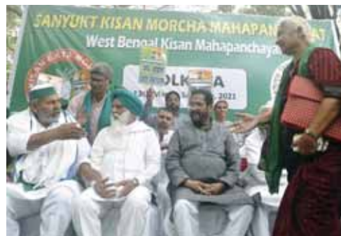
BKU spokesperson Rakesh Tikait, along with NBA leader Medha Patkar and others, during Samyukt Kisan Morchas Mahapanchayat under Gandhi statue in Kolkata on Saturday

Alleging that the BJP-led Government at the Centre is intent on breaking the back-