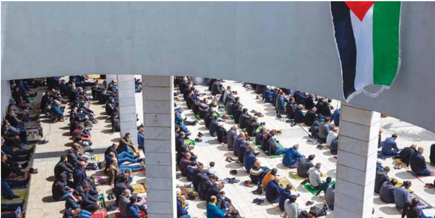
Muslim men gather to pray ahead of a protest against the lack of enforcement by Israel's police and the recent rise in violence in Arab communities in the northern Arab Israeli town of Umm el-Fahm, Israel, Friday, March 12, 2021

The decision to launch the ICC probe was taken by its outgoing Chief Prosecutor Fatou Bensouda, a former Gambian Judge. In February this year, Bensouda claimed that the ICC had jurisdiction over the case. Her preliminary probe in 2019 has brought forth the fact that there is enough evidence to open a war crimes case in the West Bank, including East Jerusalem and Gaza Strip. In one of her statements, she said that the investigation will look into crimes within the jurisdiction of the court. She has ensured the international community that the investigation