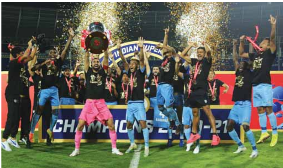
Mumbai City FC players celebrate with Indian Super League trophy after Mumbai beat ATK Mohun Bagan 2-1 in the final at Fatorda stadium on Saturday

The first real threat for Mumbai came from a Javier Hernandez free-kick which brushed the crossbar. Roy Krishna then forced a save from Amrinder Singh from a tight angle.