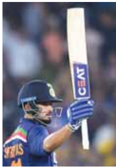
as possible because going into the world Cup we need to see to it that we tick all the boxes. This is a five-match series, so it is a

"We have come with a plan and we have to execute as much