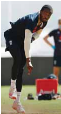
Pandya and Shardul Thakur to help England win the first match.

Archer cleaned up KL Rahul in the powerplay, and nearly took a hat-trick in the death overs after dismissing Hardik