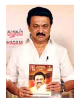
DMK president MK Stalin releases party's manifesto in Chennai on Saturday

In Government town buses, women shall be allowed to travel free of cost and quota for women in Government jobs shall be increased from 30 to 40 per cent, he announced. Free computer tablets with