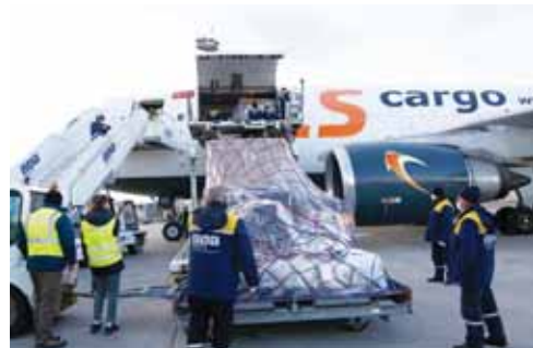
airport workers unload the first shipment of AstraZeneca Covid-19 vaccine at the International Airport outside Tbilisi, Georgia on Saturday

India has been using the Indian version of the Oxford-AstraZeneca Covid-19 vaccine called Covishield, as developed by SII, the world's largest vaccine manufacturer by volume, and indigenous vaccine giant Bharat Biotech's Covaxin in its vaccination drive.