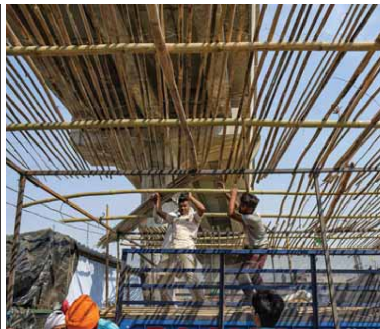
Farmers construct permanent shelter as the summer approaches, during their ongoing agitation against Centres three agri-laws, at Tikri border in New Delhi on Saturday