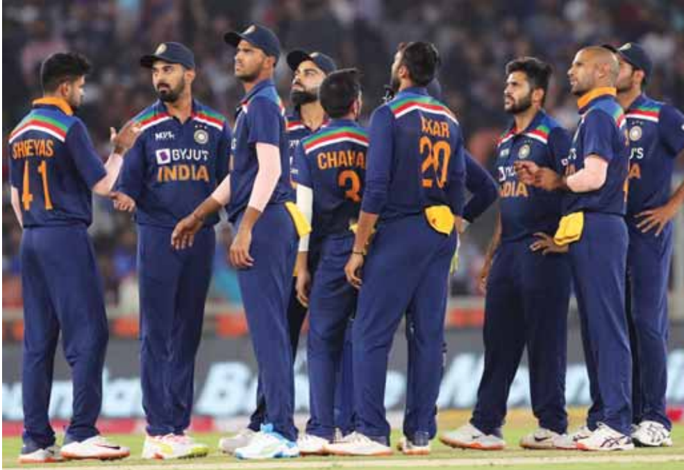
Indian captain Virat Kohli, fourth from left, and teammates wait for a review decision for the wicket of England's Jos Buttler during 1st T20I on Friday

"It was just a below-par batting performance and England made us pay for it," Kohli had summed it up aptly at the end of the match.