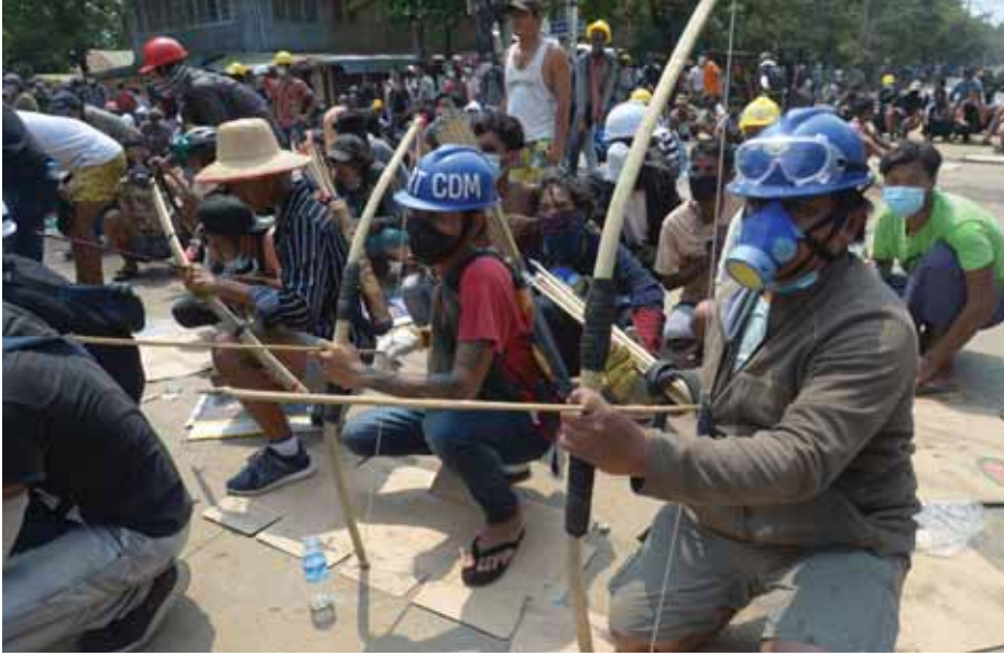
Anti-coup protesters prepare makeshift bow and arrows to confront police in Thaketa township Yangon on Saturday

The warning was widely taken as a threat because a great number of the fatalities among protesters have come from being shot in the head, suggesting they have been targeted for death. The announcement suggested that some young people were taking part in protesting as if it was a game, and urged their parents and