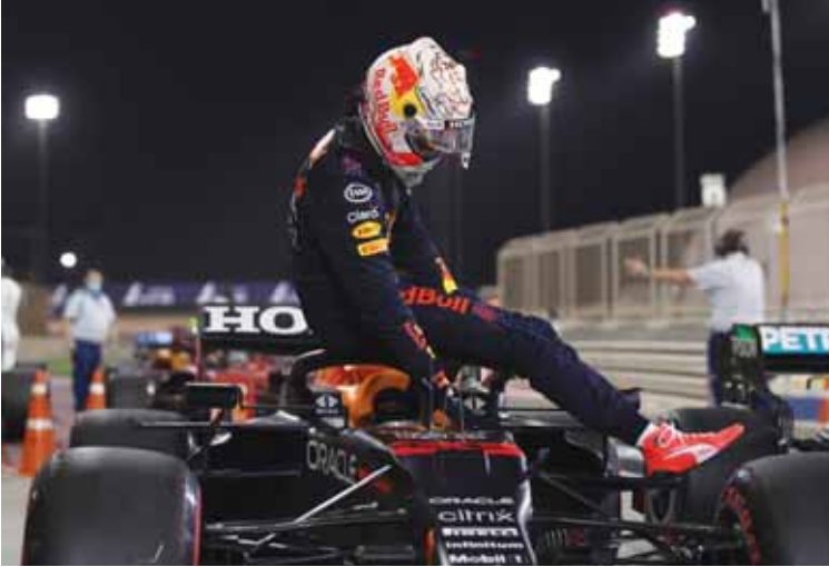
AFP ■ SAKHIR

Verstappen will start ahead of seven-time champion Hamilton in season's opener today