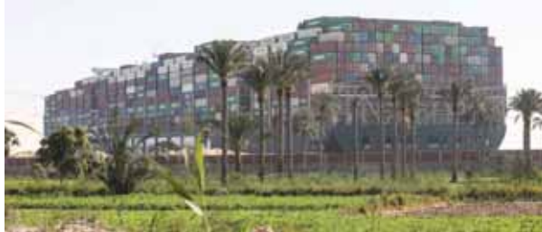
Ever Given, a Panama-flagged cargo ship, that is wedged across the Suez Canal and blocking traffic in the vital waterway is seen on Saturday