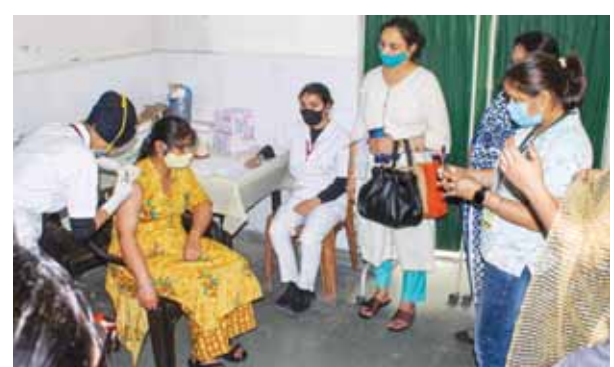
A health worker gives a shot of vaccine to teachers in Patiala on Saturday