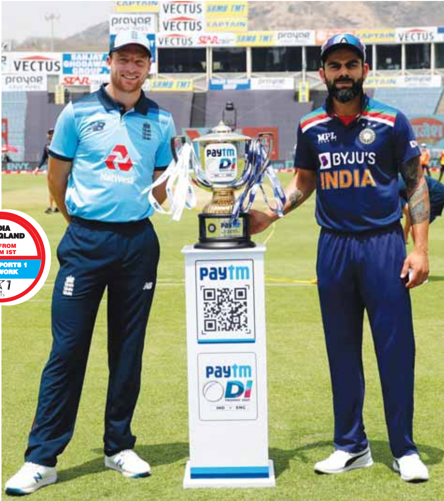
India skipper Virat Kohli, right, and England stand-in captain Jos Buttler, left, pose with ODI series trophy

Pandya senior would still make it to the team because of