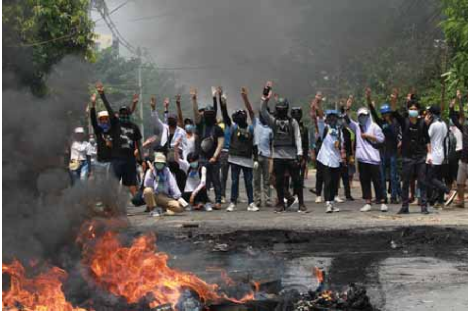
Anti-coup protesters gesture with a three-fingers salute, a symbol of resistance during a demonstration during by police crackdown in Thaketa township Yangon, Myanmar on Saturday

The killings quickly drew international condemnation, with multiple diplomatic missions to Myanmar releasing