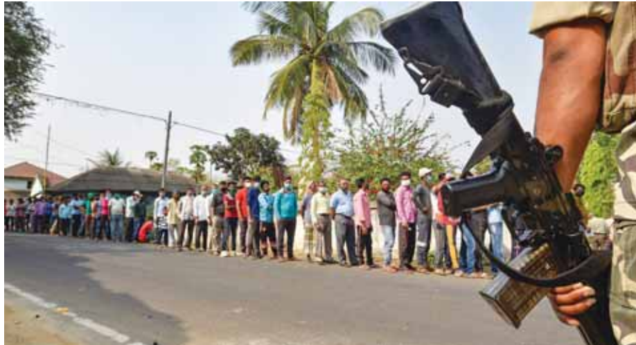
A paramilitary jawan guards a polling booth as people wait in a queue to cast their votes during the first phase of West Bengal Assembly polls, at Sirshi in Jhargram on Saturday