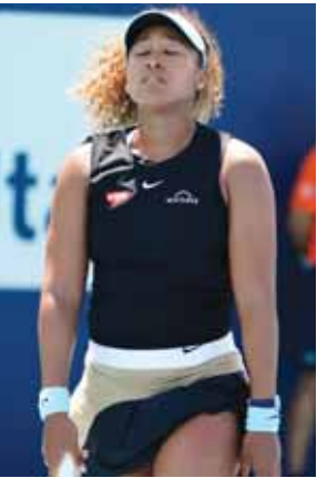
MIAMI

Daniil Medvedev celebrated his rise to second in the world with a seamless entry into the Miami Open on Friday, trouncing Taiwan's Lu Yen-Hsun in less than an hour. Russia's Medvedev needed just 56 minutes to subdue Lu 6-2, 6-2, firing nine aces with just one double fault as he advanced to a third-round meeting with Australian Alexei Popyrin, a 6-4, 6-2, winner over 30th-seeded American Reilly Opelka.