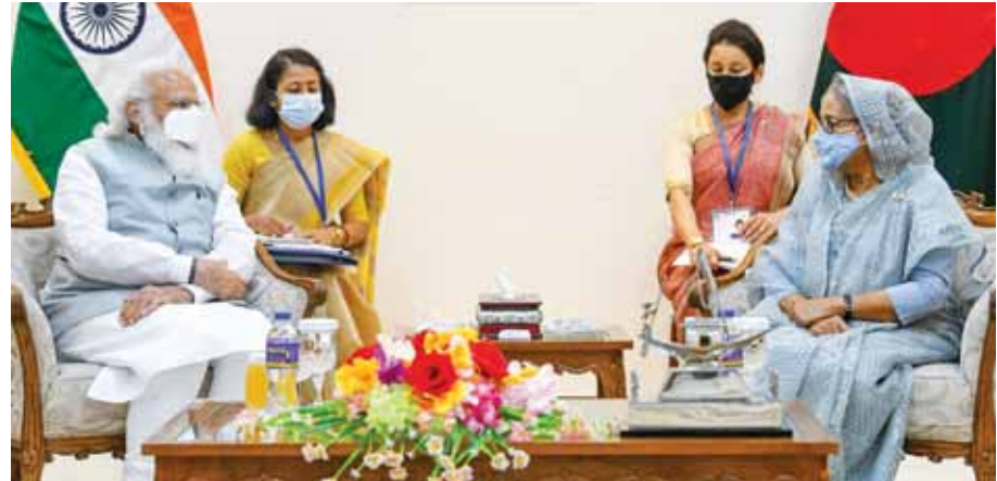
Prime Minister Narendra Modi with his Bangladeshi counterpart Sheikh Hasina during a meeting in Dhaka on Saturday

India, B'desh sign 5 MoUs in sports, commerce, sports and I-T; agree to resolve river water sharing concerns