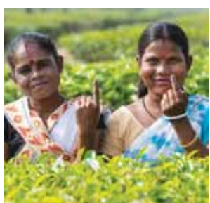
Tea garden workers display the indelible ink marks on their fingers after casting their votes during the first phase of Assam State elections in Jorhat on Saturday

The number of polling stations had increased as the number of voters per polling station was reduced from 1,500 to 1,000 keeping social distancing norms in mind due to