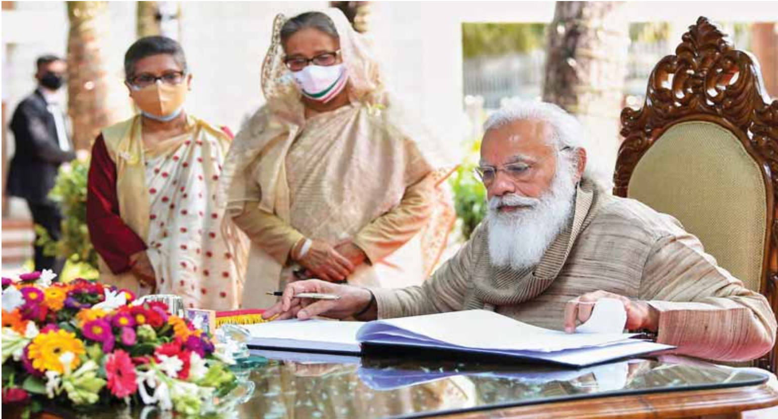
Prime Minister Narendra Modi writes in the visitors' book after paying tribute at the mausoleum of Bangabandhu Sheikh Mujibur Rahman at Tungipara in Gopalganj district in Bangladesh on Saturday. Bangladesh PM Sheikh Hasina is also seen

On March 31, 1971, Indian Parliament passed a resolution saying the Pakistan Army's brutality unleashed on unarmed people is "systematic decimation of people which amounts to genocide" and recorded "its profound con-