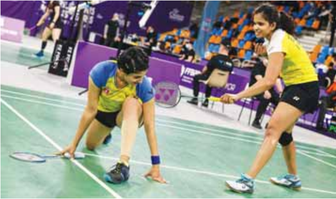
■ PARIS