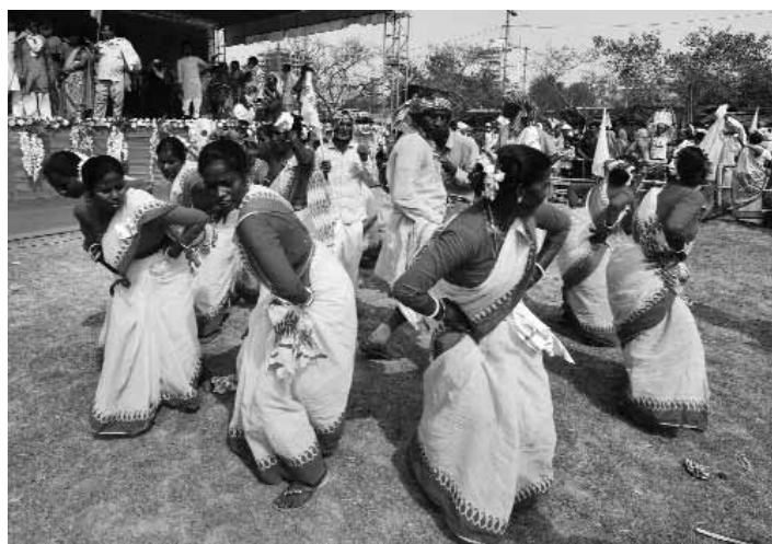
Baul and Kirtan artists perform during their mass meeting at Shahid Minar, in Kolkata on Tuesday

"There is scope in Goa for handling commodities and tourism," Sawant said, adding that he will spell out the existing maritime infrastructure in Goa and create a blueprint of new infrastructure which are needed to be raised for expanding the scope of maritime trade in Goa. IAWS