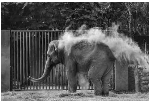
An elephant takes a dust bath on a hot summer day, at Alipore Zoological Garden in Kolkata on Tuesday