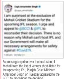
Expressing surprise over the exclusion of Mohali from the list of venues short-listed for the upcoming IPL, Punjab Chief Minister Amarinder Singh on Tuesday appealed to the BCCI to reconsider the decision.

The 2020 edition of the IPL was held in the UAE in empty stadiums but there is a possibility that the upcoming edition at home will allow spectators as the Covid situation improving drastically since the last IPL.