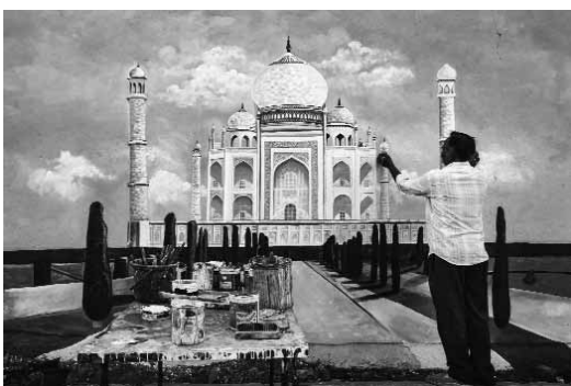
An artist makes a painting of the world-famous monument Taj Mahal, as a part of the beautification of road, in Bhopal on Tuesday PTI

Education Minister Taba Tedir while denying such appointments informed the House that the department on complaint from Ering had initiated a departmental enquiry, report of which would be available soon. PTI