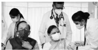
Union Health Minister Harsh Vardhan and his wife being administered the first dose of Covid-19 vaccine at the Delhi Heart and Lung Institute on Tuesday in the national Capital.

Those with specified comorbidities will have to produce a medical certificate attested by a registered medical practitioner at the time of vaccination at the Covid-19 vac-