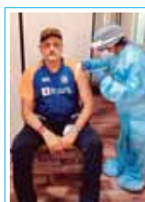
Indian cricket team head coach Ravi Shastri on Tuesday received the first dose of the Covid-19 vaccine at a city hospital in Ahmedabad. Besides Shastri, no other member of the team's support staff was inoculated.

"You know, he (Axar) is a very good bowler, especially in these conditions, he has been very accurate, he doesn't give you much to score, and he has got one that goes straight on, in these conditions, one (to) turn, so he is very good bowler," said Crawley.