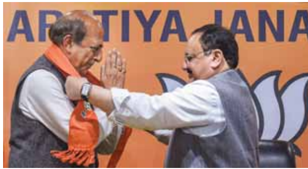
Former Union Minister Dinesh Trivedi joins BJP in the presence of the party president JP Nadda in New Delhi on Saturday