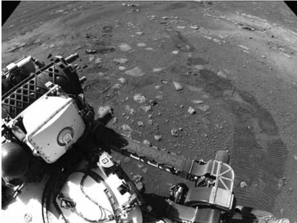
This photo made available by NASA was taken during the first drive of the Perseverance rover on Mars. Perseverance landed on February 18, 2021

According to NASA, the drive served as a mobility test to check out and calibrate every system, subsystem, and instrument on the Perseverance rover, which it said is a major milestone before the science operations get underway.