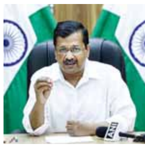
Delhi CM Arvind Kejriwal announces for the establishment of Delhi Board of School Education on Saturday

"The DBSE will empower students to stand on their own feet and prepare students to take responsibility for their country beyond all religion, caste, and class differences. Around 20-25 schools will become a part of the Delhi Education Board in the 2021-22 academic session, after which the other schools will be looped in eventually in the next 4-5 years. The Delhi Education Board will not only conduct continuous assessments but