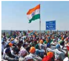
Farmers during Kisan Ektta Morcha protest at KMP Expressway near Kundli in Haryana on Saturday

Protesters in Sonipat and Hajar districts and some other places brought their tractor-trolleys and other vehicles and parked them in the middle of the KMP Expressway in some stretches.