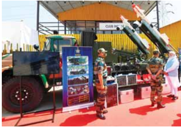
Prime Minister Narendra Modi visits an exhibition of innovations by our armed forces during Combined Commanders' Conference at Kevadia, in Narmada district

He stressed the importance of enhancing indigenisation in the national security system, not just in sourcing equipment and weapons but