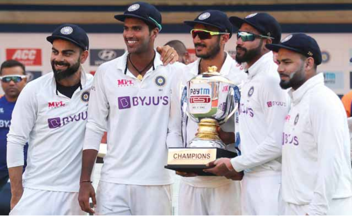
India captain Virat Kohli along with teammates Washington Sundar, Axar Patel, Mohammed Siraj and Rishabh Pant pose with winners trophy