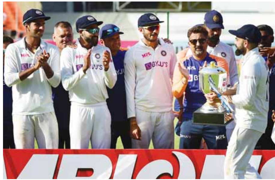
Indian cricket team captain Virat Kohli holds the trophy after defeating England during the third day's play of the 4th and last test match of the series between India and England, at Narendra Modi Stadium in Ahmedabad on Saturday

All India needed was a draw to book a Lord's date in June with Kane Williamson's New Zealand but Patel (24-6-48-5), in company of Ashwin (22.5-4-47-5), literally blew England away in a session and half for a paltry 135 in 54.5 overs to complete a 3-1 rout, ensuring that the Anthony De Mello Trophy will stay at the Cricket Centre in Mumbai.