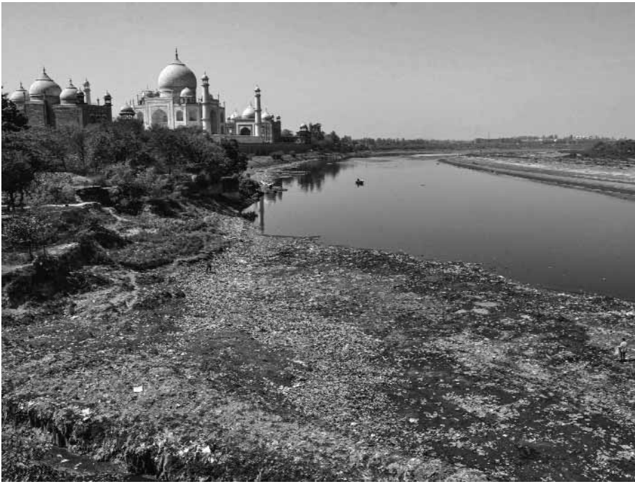
Polluted embankment of the Yamuna behind the Taj Mahal in Agra on Saturday

raised by Congress MLAs on the status of water supply in the state. The CM said the state government had allocated Rs 4,000 crore for the 'Nal Se Jal' project. He said 82 per cent of the total work on the project has already been completed. "We are planning to provide 1 lakh tap connections every month to cover the remaining 17 lakh houses in the next 17 months. Out of the total 95 lakh beneficiaries identified under the project, 17 lakh are yet to be covered," the CM said. "We are using the lift irrigation technology to bring water to the doorstep of each and every household. Not a single village will be left out by 2022," he said. Listing challenges, the chief minister said providing water tap connections in remote tribal and mountainous regions is proving difficult. PTI