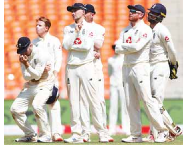
England players react during Day 2 of fourth Test against India

The England skipper acknowledged Indian batsman Rishabh Pant's remarkable ability to take the attack by the scruff of its neck. “The way he bats, he