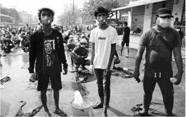
Anti-coup protesters prepare water and wet cloths to help extinguish tear gas canisters during a demonstration in Yangon, Myanmar on Saturday

Protests also took place in several other cities, including Mandalay, the second-biggest city, Myitkyina, the capital of the northern state of Kachin, Myeik in the far south, where police fired tear gas at students, and Dawei in the southeast, where tear gas was also used. Officials are believed to