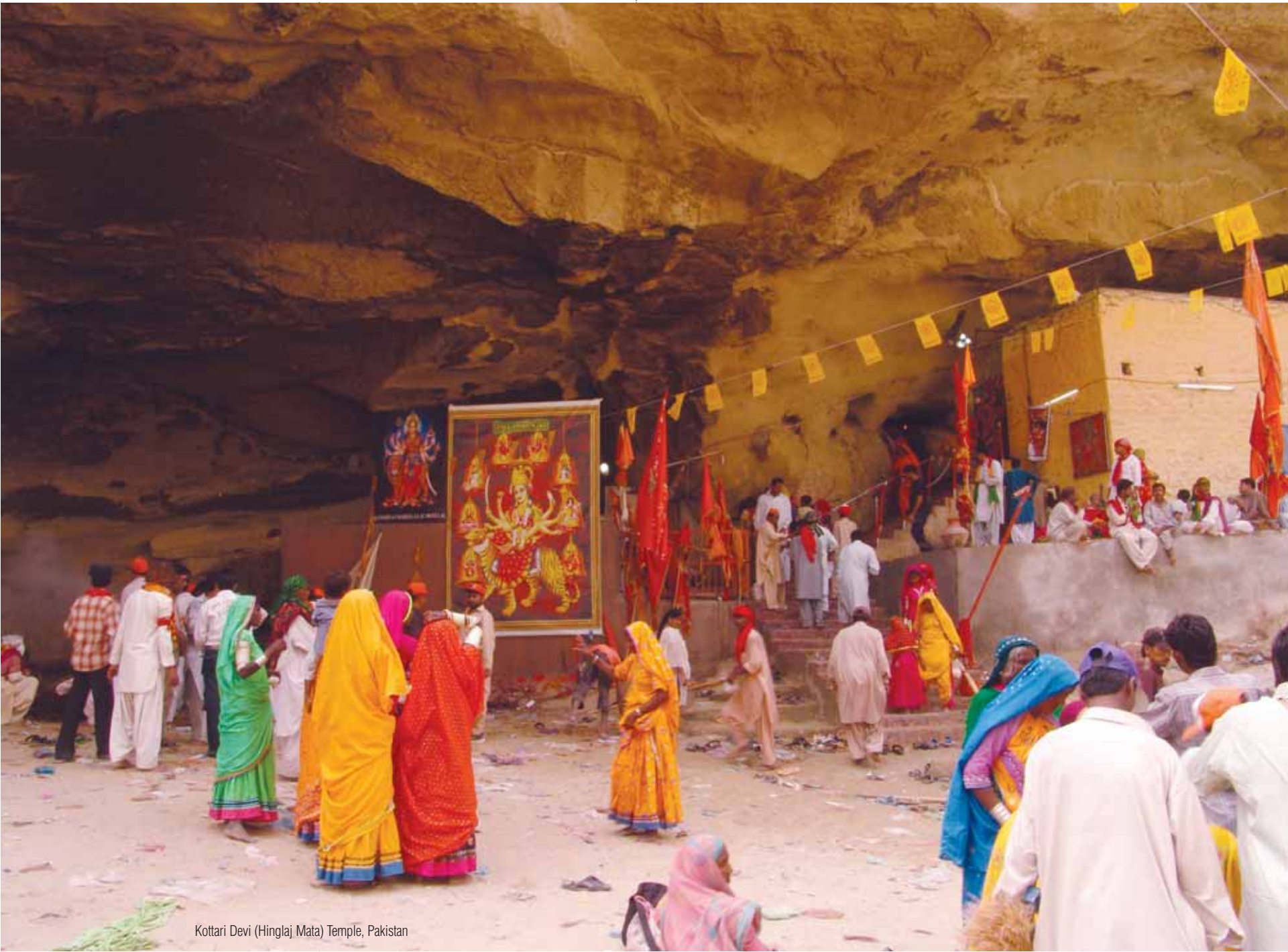
Kottari Devi (Hinglaj Mata) Temple, Pakistan

While the Shakti Peethas were specific to the body parts of Sati, the rituals of adoration, prayer and worship differed from region to