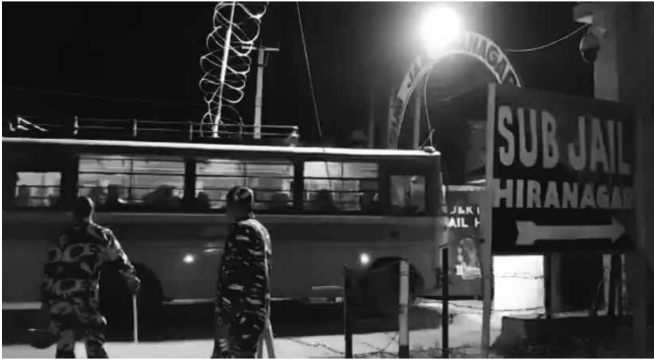
Illegal immigrant Rohingyas being shifted to Sub Jail Hiranagar after a verification process late Saturday evening

In a major crackdown on illegal immigrants staying in Jammu and Kashmir more than 150 Rohingyas have been detained at a holding centre in Sub Jail Hiranagar at the end of the verification process of their travel documents. According to official sources, during the special drive conducted at the Maulana Azad stadium in Jammu on Saturday police authorities verified travel documents and collected biometrics of large numbers of illegal immigrants including Rohingyas from Myanmar. During the verification process the sports stadium was kept out of bounds from the local media persons as none of them were permitted to enter the premises. Their entry was restricted at the entry gate of the stadium where this verification drive was going on. After completing the day-long exercise Inspector General