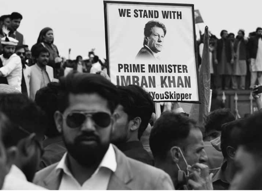
Supporters of the ruling Pakistan Tehree-e-Insaf political party gather near the National Assembly to celebrate Prime Minister Imran Khan winning a vote of confidence in Islamabad, Pakistan on Saturday