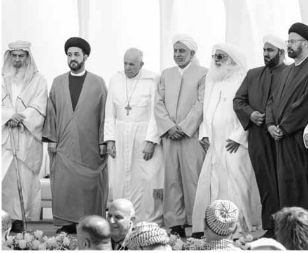
Pope Francis stands with religious leaders during an interreligious meeting near the archaeological area of the Sumerian city-state of Ur, 20 kilometers south-west of Nasiriyah, Iraq on Saturday