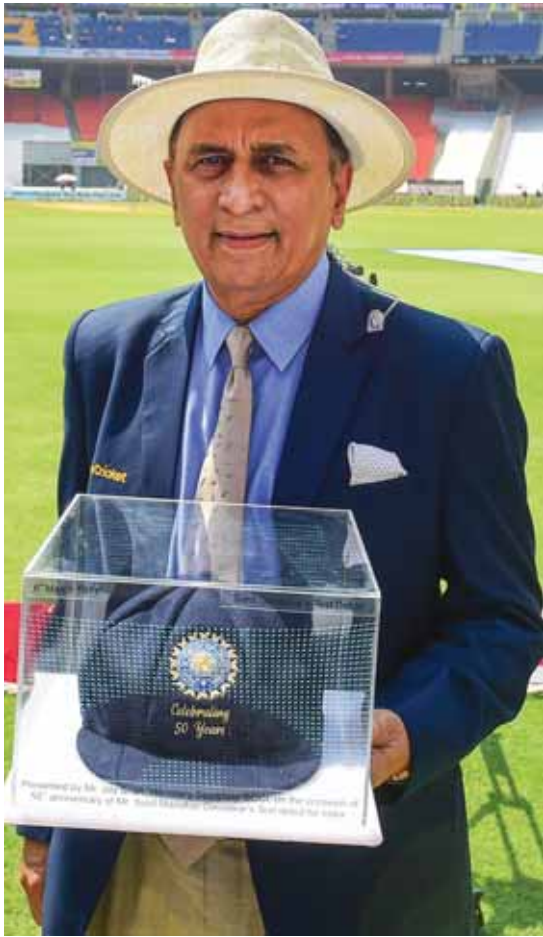
Former India captain Sunil Gavaskar was on Saturday felicitated by the BCCI on the 50th anniversary of his Test debut. The 71-year-old former skipper received a commemorative Test cap from BCCI Secretary Jay Shah during the lunch break on Day three of the fourth and final Test between India and England at the Narendra Modi Stadium here in Ahmedabad

But not all was doom and gloom for Root, who found solace in the fact that his wicket-keeper Ben Foakes and left-arm spinner Jack Leach performed their roles to the best of their abilities.