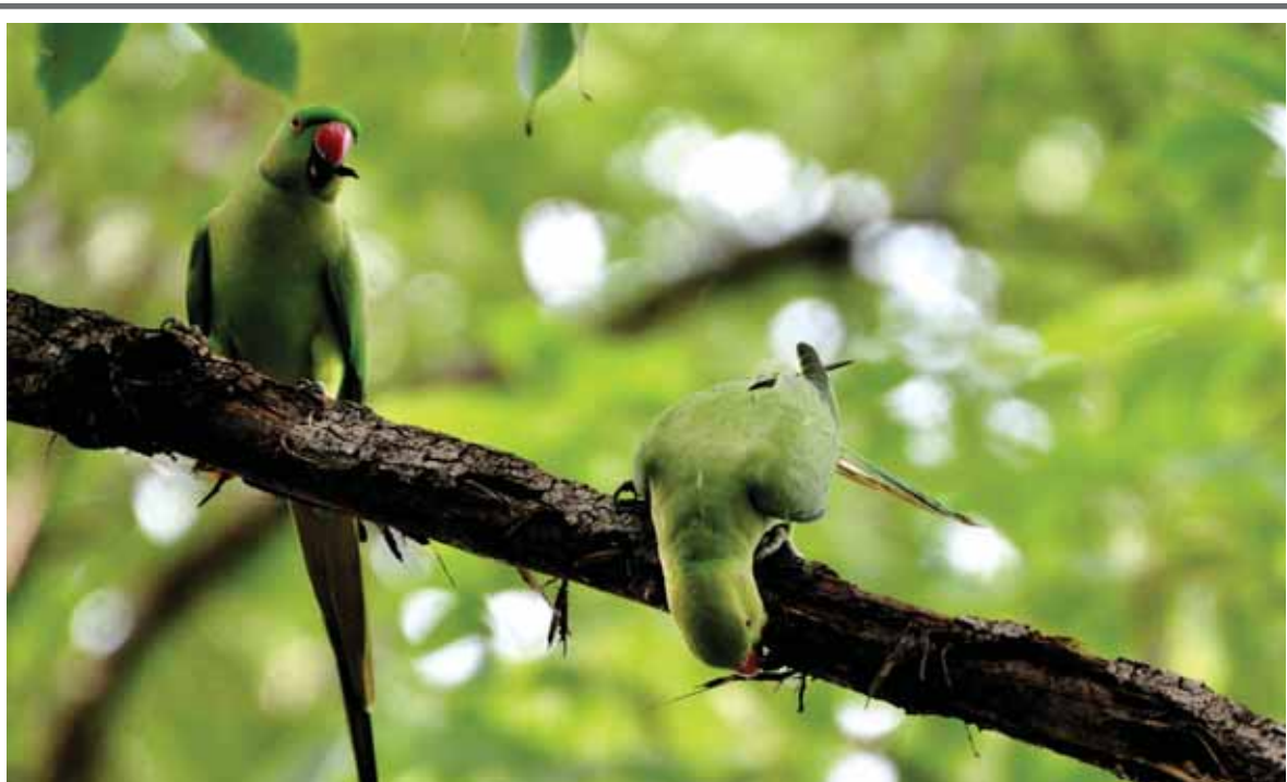
A pair of rose-ringed parakeet tearing the bark of a tree to prepare a nest at Amleshwar area in Raipur.

Meanwhile, Home Minister Tamradhwaj Sahu ordered IG Intelligence and Durg SP to probe the incident.