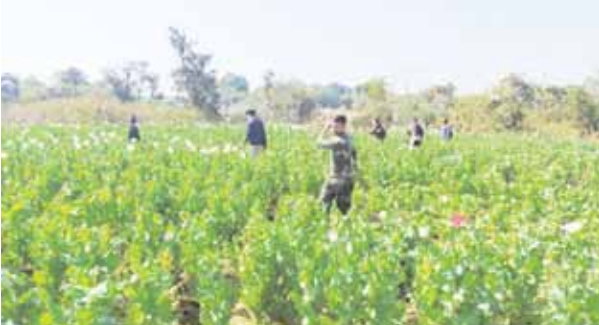
Security personnel destroy illegal opium cultivation inside a forest area near Namkum in Ranchi on Tuesday