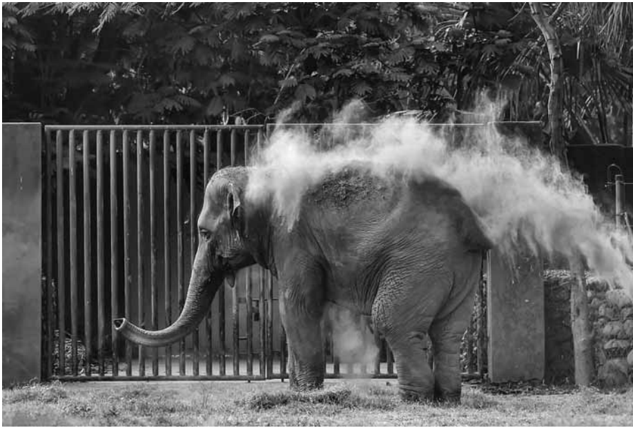
An elephant takes a dust bath on a hot summer day, at Alipore Zoological Garden in Kolkata on Tuesday