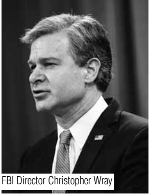
FBI Director Christopher Wray

The violence at the Capitol made clear that a law enforcement agency that revolutionised itself after the September 11, 2001, attacks to