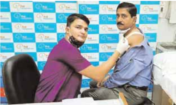
A health worker administers the first dose of Covid-19 vaccine to a person during the second phase of countryside inoculation drive, at a Private Hospital in Ranchi on Tuesday