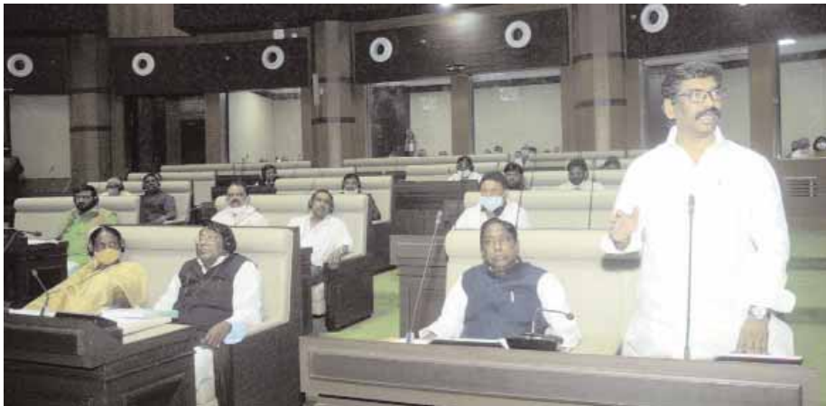
Chief Minister Hemant Soren speaks during the ongoing Budget Session of Jharkhand Assembly, in Ranchi on Tuesday