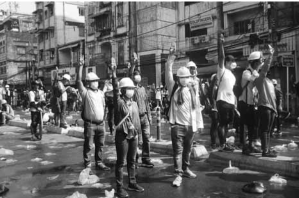
Protesters wearing safety helmets flash three-finger salutes during an anti-coup protest behind a barrier on a blocked road in Yangon, Myanmar on Tuesday

Despite the crackdown, demonstrators have continued to flood the streets — and are beginning to more rigorously resist attempts to disperse them. Hundreds, many wearing construction helmets and carrying makeshift shields,