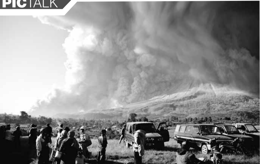
Mount Sinabung spews volcanic material during an eruption in Karo, North Sumatra, Indonesia, on Tuesday