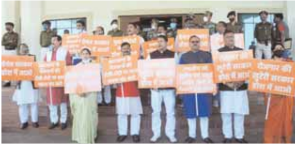
Opposition MLAs hold placards to protest outside the Assembly during the Budget Session of State Assembly in Ranchi on Tuesday