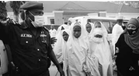
Some of the students wait for a medical checkup after their release meeting with the state Governor Bello Matawalle, in Gusau, northern Nigeria on Tuesday

An Associated Press reporter saw hundreds of girls