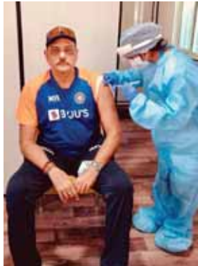
Indian cricket team head coach Ravi Shastri on Tuesday received the first dose of the Covid-19 vaccine at a city hospital in Ahmedabad. Besides Shastri, no other member of the team's support staff was inoculated

"Umesh is ready to go. Looking good and had a good session at the nets. We are really happy that he is back," Rahane said.