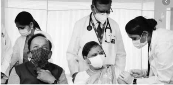
Union Health Minister Harsh Vardhan and his wife being administered the first dose of Covid-19 vaccine at the Delhi Heart and Lung Institute on Tuesday in the national Capital

Those with specified comorbidities will have to pro-