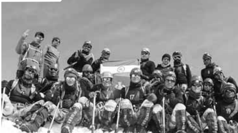
ITBP personnel share a friendly moment at a training centre near Mana, Uttarakhand