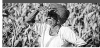
NEW DELHI

with the beneficiaries of the scheme after releasing the amount. Talking to a farmer from Andhra Pradesh, who turned a piece of barren land into suitable land for organic farming, the PM said, "You have set an example for others. Your self confidence speaks for your ability and the experience."