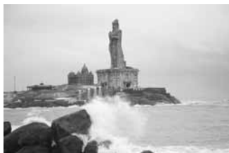
Sea waves crash onto the shore amid cyclone warning, at a seashore in Kanyakumari district on Friday

While Srikulam reported the lowest 695 and Vizianagaram 899, seven other districts added between 1,000 and 1,800 new cases each. PTI