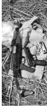
intruder was also shot dead by the BSF troops in the same area on May 5.

A day after the Armies of India and Pakistan exchanged packets of sweets and demonstrated that the bonhomie was prevailing along the Line of Control as not a single incident of ceasefire violation was reported since February 24, the Indian border guards deployed along the International border on Friday claimed they had recovered a consignment of arms and ammunition dropped by a Pakistani drone in the Samba sector. The arms consignment was dropped approximately 250 metres inside the Indian territory.