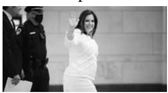
Rep. Elise Stefanik, R-N.Y., arrives as House GOP members hold an election for a new chair of the House Republican Conference to replace Rep. Liz Cheney, R-Wyo., at the Capitol in Washington on Friday.

Stefanik, R-N.Y., a moderate-turned-rightwing ally who given voice to many of his false claims about election fraud, was elected as expected to the No. 3 post that Cheney, R-Wyo., held for over 10 years. In a letter published in the House's top two Republicans, Stefanik defeated challenger Rep. Chip Roy, R-Texas, by