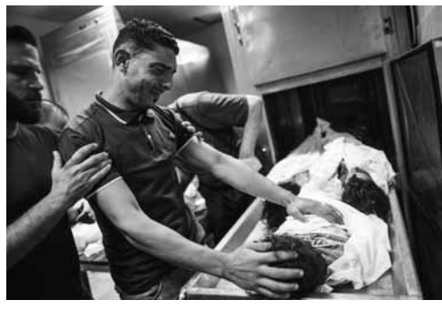
A Palestinian relative mourns over the bodies of four young brothers from the Tanani family who were found under the rubble of a destroyed house following Israeli airstrikes in Beit Lahia, northern Gaza Strip on Friday.

Before dawn Friday, Israeli tanks and warplanes carried