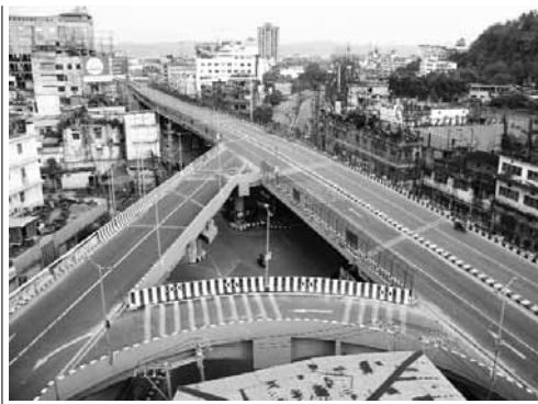
Deserted streets at the Ganeshguri flyover during Covid-induced curfew in Guwahati on Friday

Among the fresh deaths, a maximum of 21 were reported from the state capital Lucknow, 20 from Kanpur, 16 from Bahrach, 15 from Meerut, 14 from Chandauli, 13 from Jhansi, 12 from Varanasi, 10 each from Gautam Buddha Nagar, Haridwar and Mathura, a health bulletin issued here said. Among the fresh cases, 1,464 were reported from Meerut, 900 from Lucknow, 718 from Gautam Buddha Nagar, 587 from Varanasi, 567 from Gorakhpur, it said. So far, over 4.41 crore samples have been tested for COVID-19 in the state, including more than 2.63 lakh tested on Wednesday, he said.