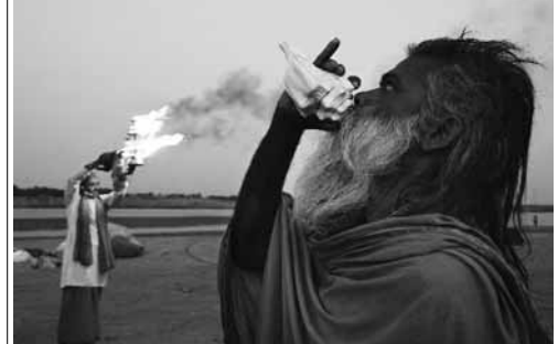
Priests perform 'saati' at Sangam on the occasion of 'Ashay Triyia' in Prayagraj on Friday

A total of 90 people were discharged in the state during the day. The number of active cases now stands at 2,060, while 6,294 people have recovered from the infection. At least 23 people have succumbed to the infection in Mizoram so far. The Government order said that people residing in the state capital and other district headquarters/towns shall strictly confine to indoors and not venture outside without permission.