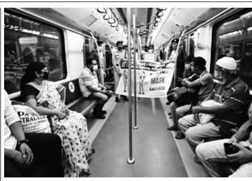
Metro RPF conducting 'No mask - No metro' campaign inside a running metro to spread the message of Covid Awareness

The properties in possession by the bank will be sold by way of e-auction on June 15, 2021 for recovery of ₹345.32 crore as on April 27, 2021, Yes Bank said in the notice.