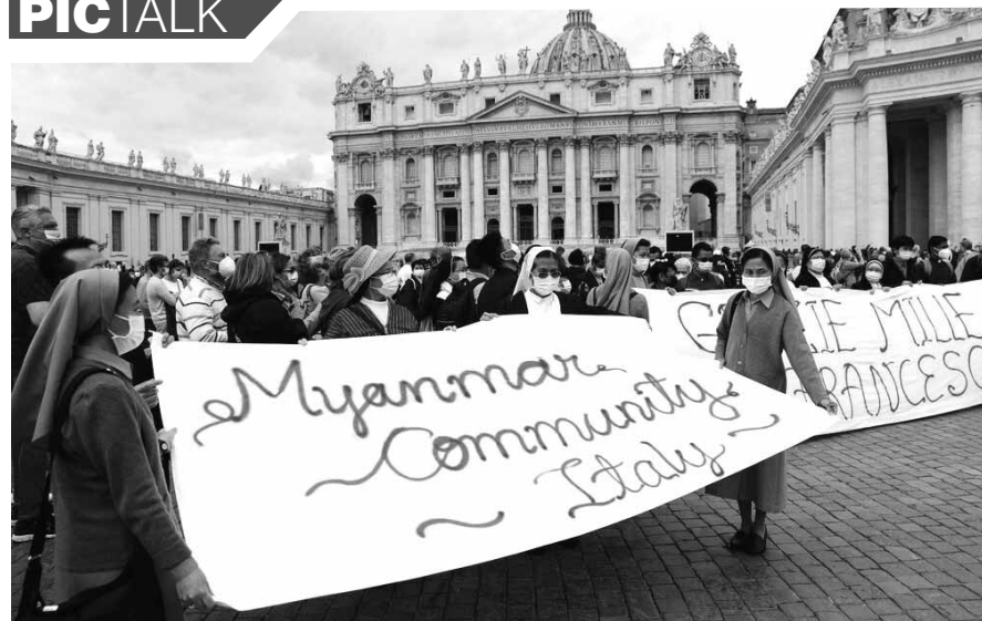
The faithful gather at St Peter's Square at the Vatican