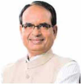
STAFF REPORTER ■ BHOPAL

Chouhan says recovery rate improves to 86% as over 12K Covid patients have recovered