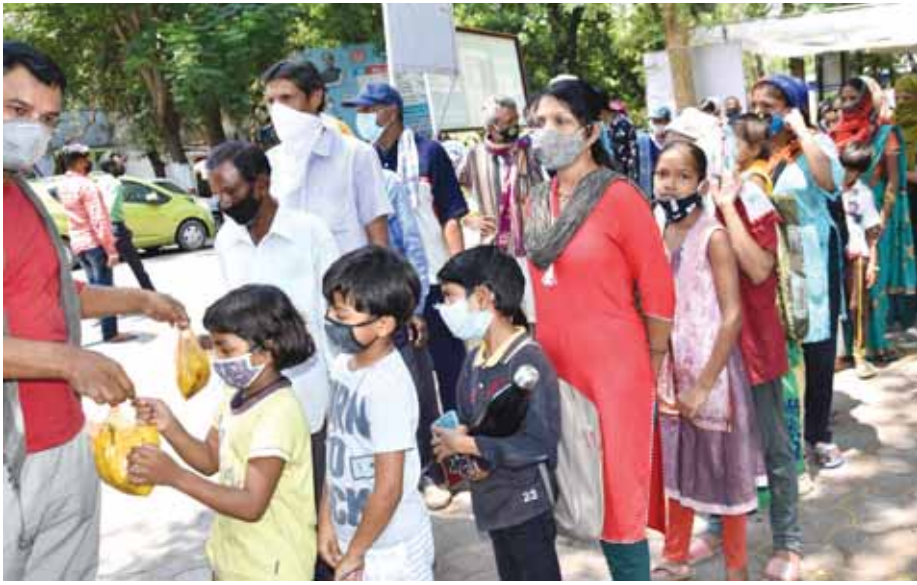
Social workers serve free meals to the needy people during coronavirus curfew in Bhopal on Sunday

The students will be trained to engage their acting foundation which will help them to free themselves from self consciousness and strengthen their concentration through sensory exercises. Notably, the youngsters will learn the fundamentals of acting and other aspects of theatre presentation.