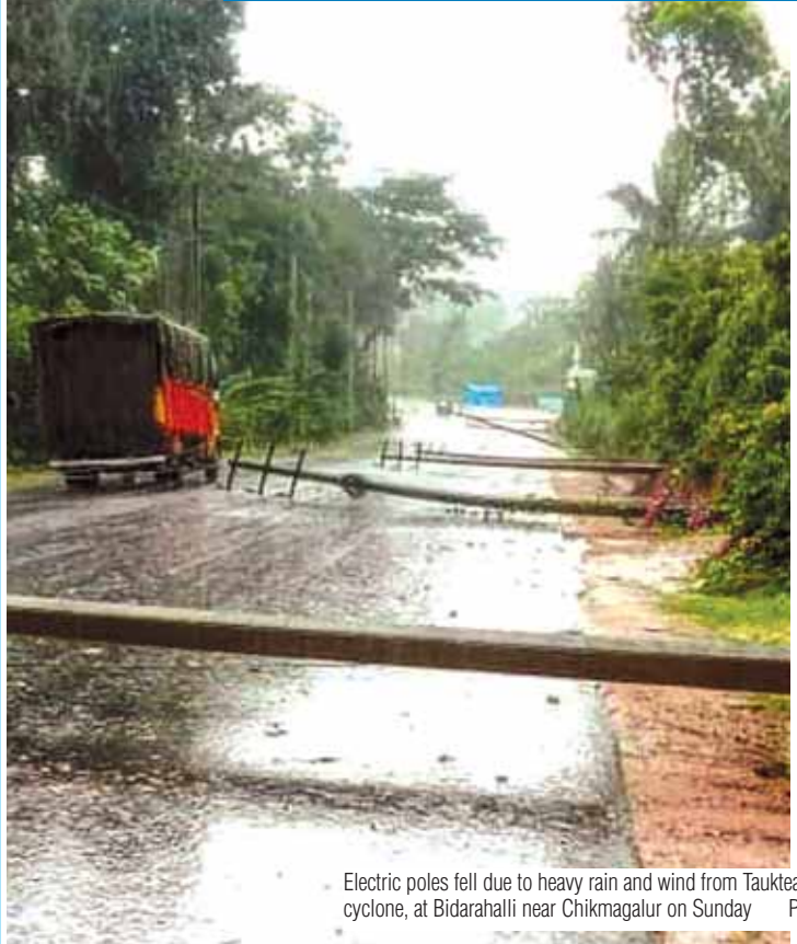
Electric poles fell due to heavy rain and wind from Tauktae cyclone, at Bidarhalli near Chikmagalur on Sunday