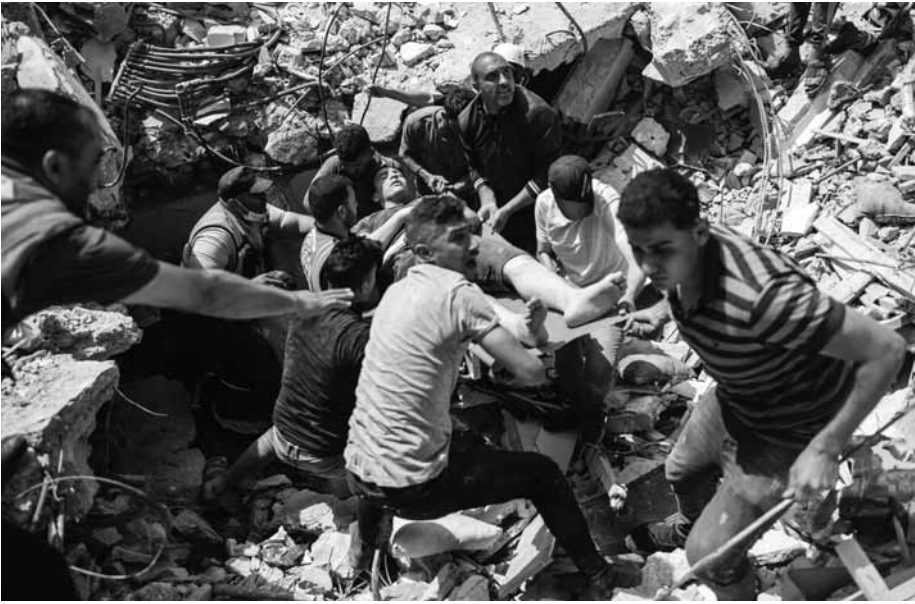
Palestinian rescue a survivor from under the rubble of a destroyed residential building following deadly Israeli airstrikes in Gaza City, Sunday

In its airstrikes, Israel has leveled a number of Gaza City’s tallest office and residential buildings, alleging they contain Hamas military infrastructure. Among them was the building housing The Associated Press office and those of other media outlets.