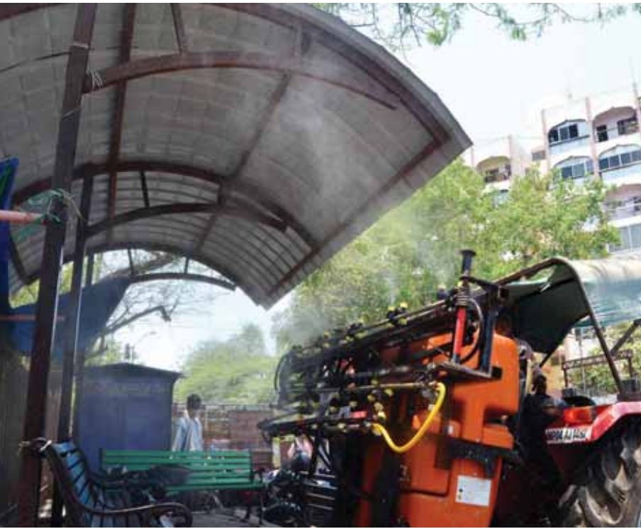
BMC workers spray disinfectant to sanitise public places during coronavirus-induced curfew imposed to curb the spread of Covid-19, in Bhopal on Sunday