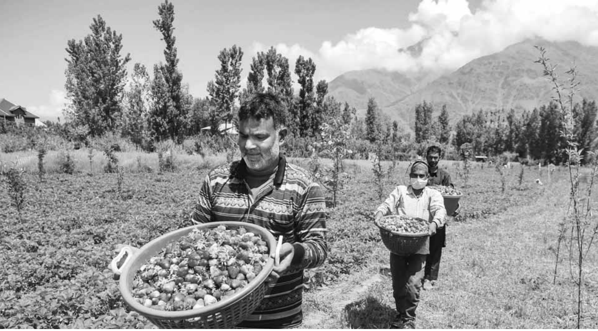
Farmers carrying strawberries after picking them from their farms during the ongoing lockdown to contain the spread of the coronavirus on the outskirts of Srinagar on Sunday