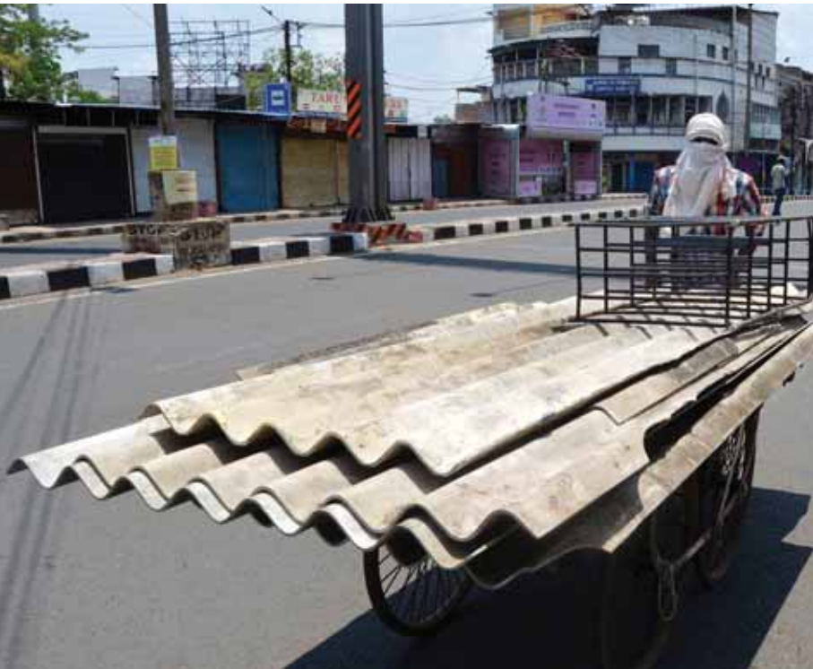
A labourer seen on a road during coronavirus-induced curfew imposed to curb the spread of Covid-19, in Bhopal on Sunday