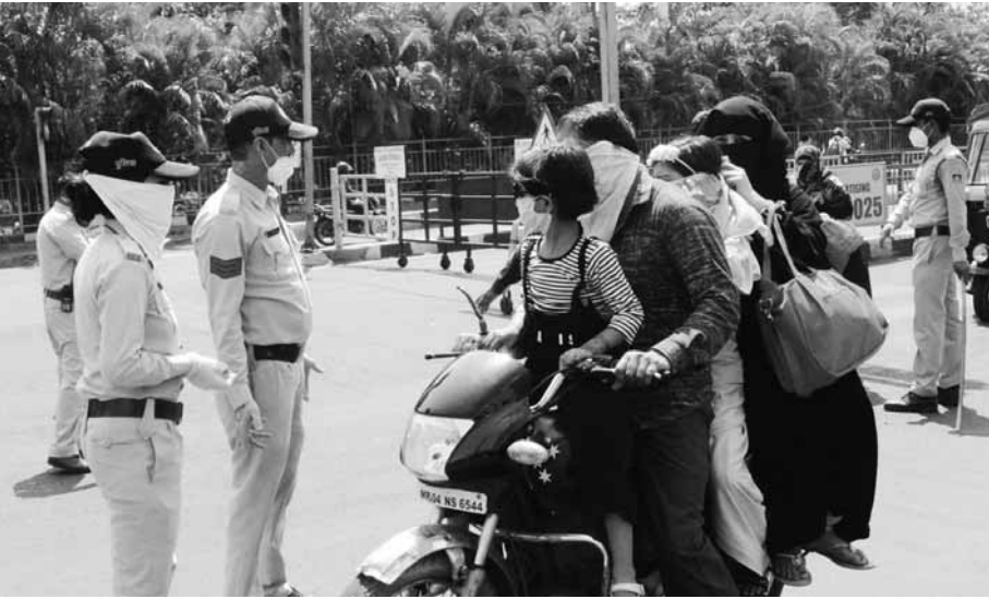
Security personnel stop commuters during coronavirus curfew in Bhopal on Sunday