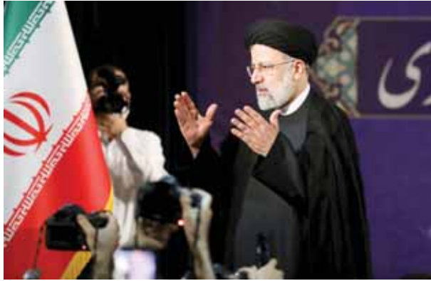
Ebrahim Raisi, head of Iran's judiciary leaves a news conference after registering his candidacy for the June 18 presidential elections at the elections headquarters of the Interior Ministry in Tehran, Iran on Saturday

Raisi, wearing a black turban that identifies him in Shiite tradition as a direct descendant of Islam's Prophet Muhammad, offered fiery remarks to jour-