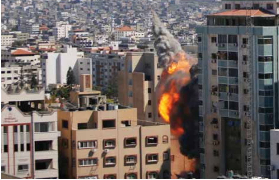
An Israeli airstrike hits the high-rise building housing The Associated Press' offices in Gaza City on Saturday