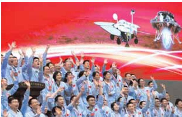
In this photo released by Xinhua News Agency, members at the Beijing Aerospace Control Centre celebrate after China's Tianwen-1 probe successfully landed on Mars, at the centre in Beijing, Saturday