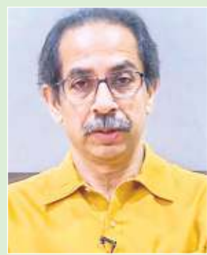
Maha CM asks family docs to join fight against Covid