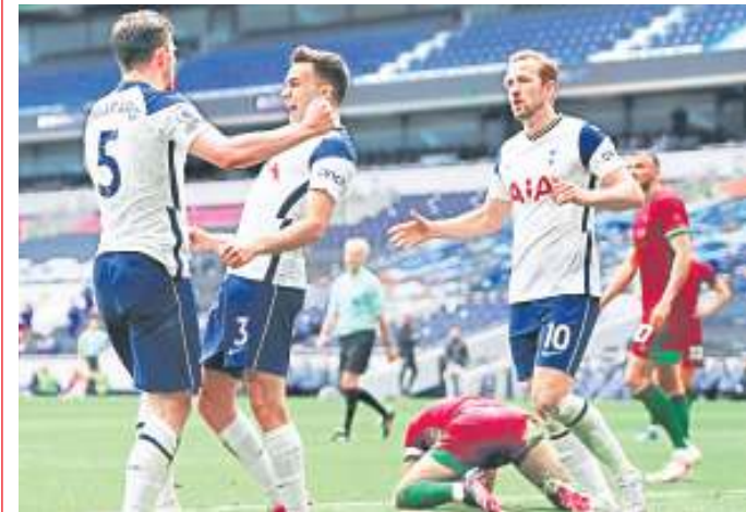
Pierre-Emile Hojbjerg, left, celebrates with teammates after scoring Spurs second goal