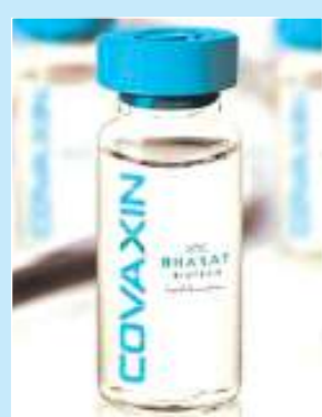
Covaxin effective against India, UK strains: Biotech