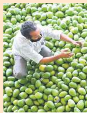
Mango growers again hit by Covid