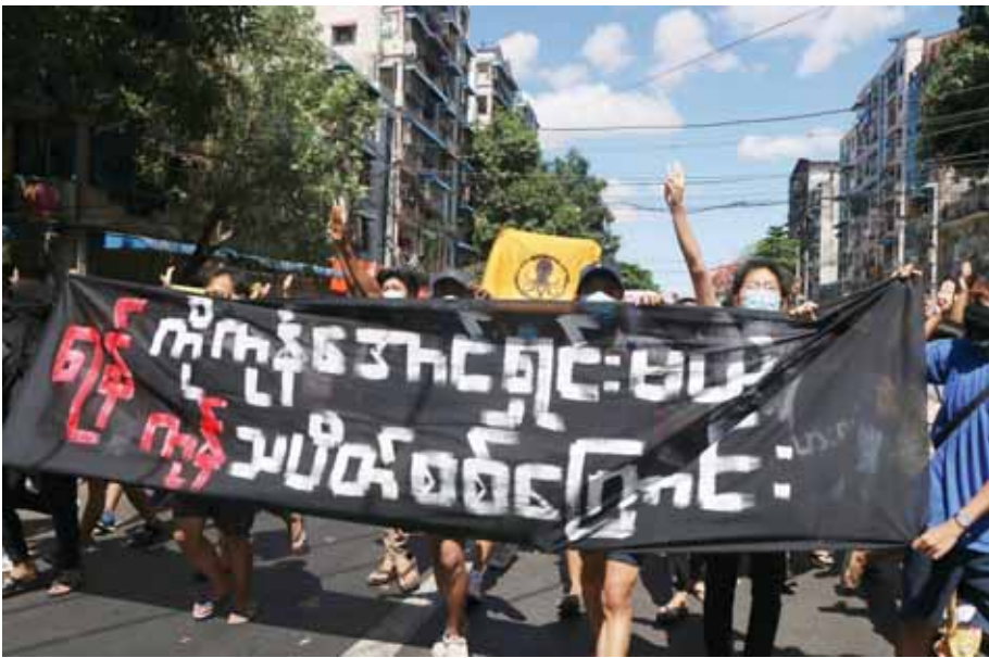
Anti-coup protesters from various township hold slogans that reads "Yangon boycott rally to clear all threats here in Yangon" during a demonstration in Yangon, Myanmar on Tuesday

More than 750 protesters and bystanders have been killed by security forces, according to detailed independent tallies.