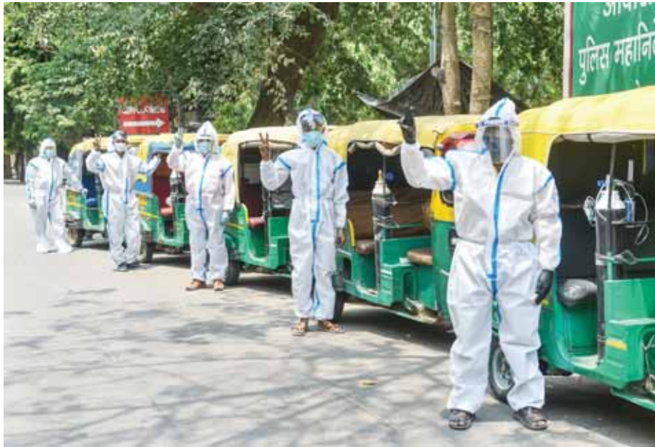
Three wheeler auto union starts the Auto Ambulance service for Covid-19 patients in Lucknow on Tuesday

Saying that “the truth will finally come out despite her efforts to implicate the central forces,” a BJP MLA said “she is trying to hit two birds in a shot ... first she is trying to inspire the criminals of her party by ordering a probe in their favour and more importantly she is trying to demoralize the central forces so that they hesitate to take strong action in subsequent elections.”