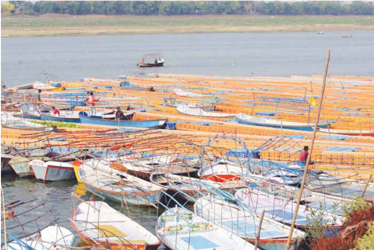
A view of the Sangam Ghat during lockdown in Prayagraj on Tuesday