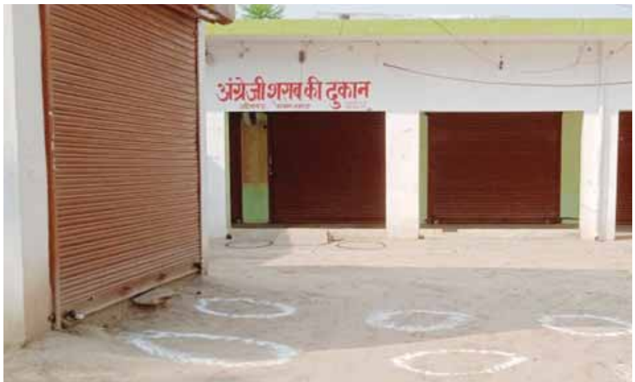
Circles drawn for social distancing outside a liquor shop in Lucknow

He said some people were working as a gang spreading mean and filthy messages about reputed personalities to malign their image. “Such elements are using social media platforms to propagate defamatory messages and are creating disorder in society and in the country,” he added.