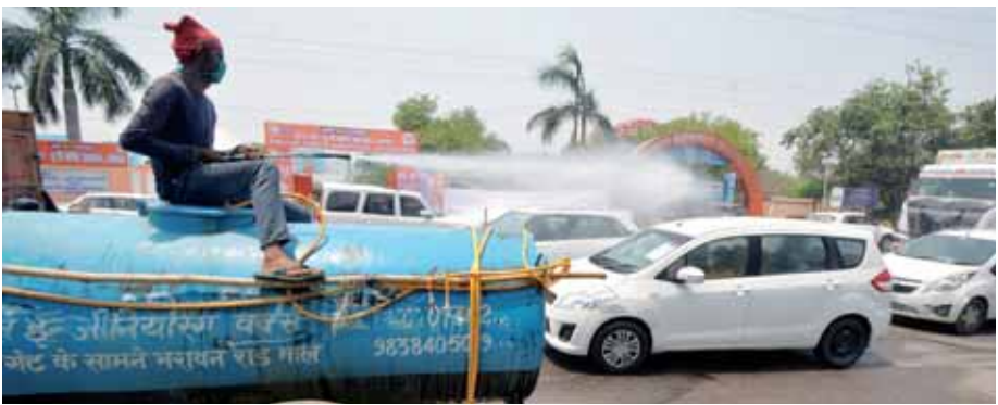
LMC workers carrying out a sanitisation drive in Sarojinagar on Tuesday