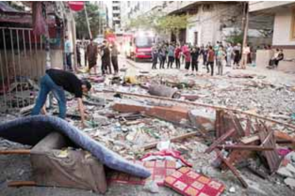
A Palestinian man inspects the rubble of a partially destroyed residential building after it was hit by Israeli missile strikes, at the Shati refugee camp in Gaza City, early on Tuesday

The current violence, like previous rounds, was fueled by conflicting claims over Jerusalem, home to major holy sites of Islam, Judaism and Christianity. The rival national and religious narratives of Israelis and Palestinians are rooted in the city, making it the