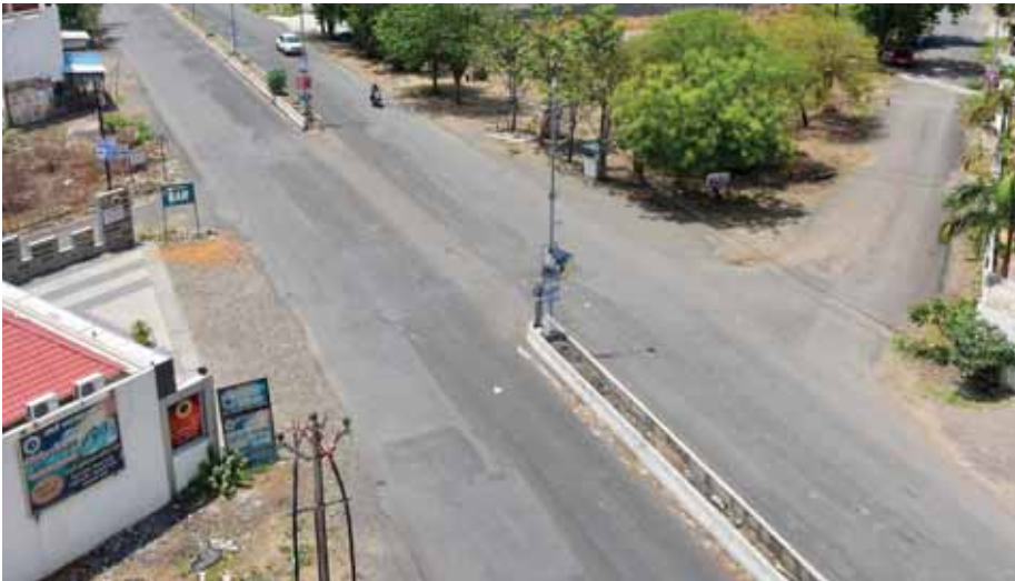
A city street wears a deserted look during complete lockdown imposed by authorities amid a surge in coronavirus cases across the country, in Amravati, Maharashtra on Tuesday