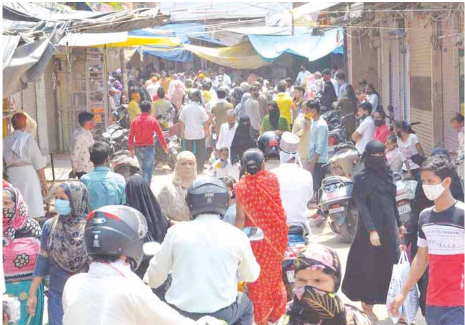
Rush of people for Eid purchasing at Dalmandi in Varanasi on Tuesday