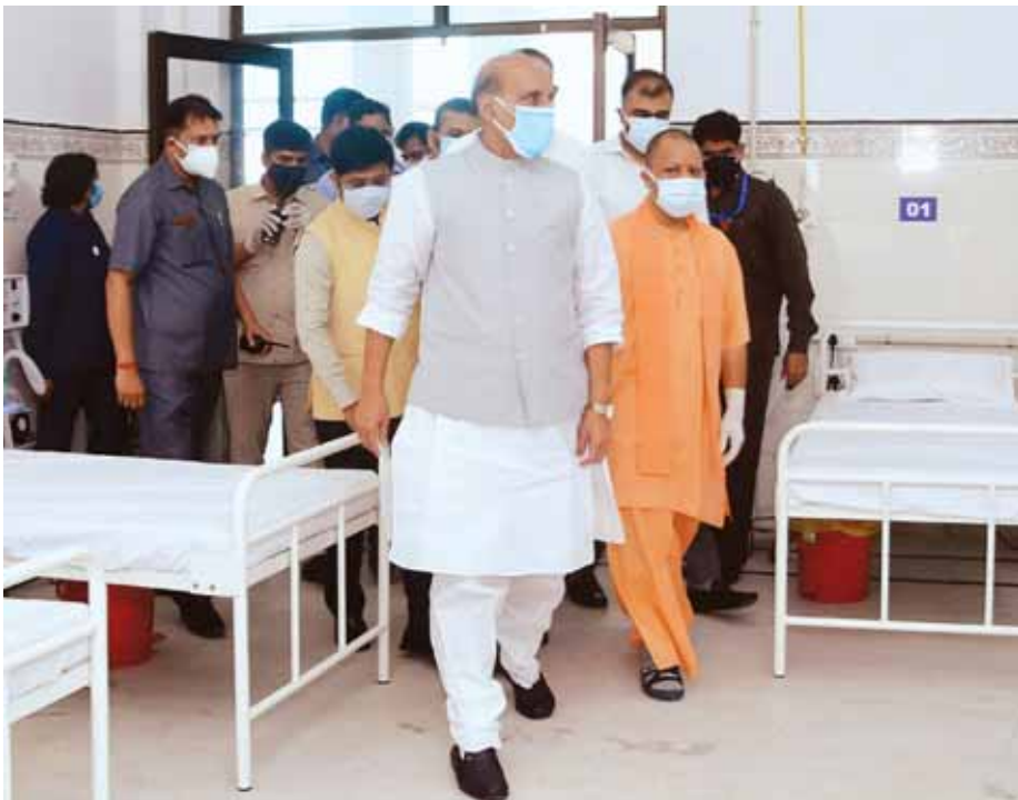
Defence Minister Rajnath Singh and Chief Minister Yogi Adityanath at the Haj House Covid facility in Lucknow

The HAL-UP Covid hospital has been constructed in less than 20 days. All 255 beds of the hospital are equipped with oxygen facilities. It has 130 oxygen supported beds, 100 beds that are HFNC supported and 25 beds that have ventilator support while 150 oxygen cylinders have been arranged through close cooperation between the UP government and HAL for initial operation at the hospital with