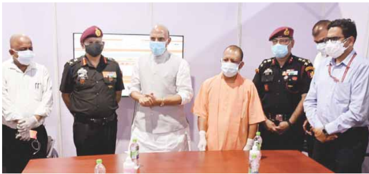
Union Defence Minister Rajnath Singh and Chief Minister Yogi Adityanath interact with senior officials as he reviewed the Covid hospitals set up by DRDO and HAL in Lucknow on Tuesday