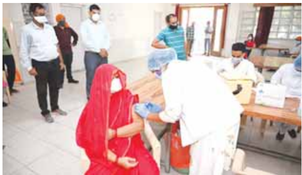
A woman getting a vaccine at BLW Vaccination Centre in Varanasi on Monday

Health systems, vaccination and public awareness campaign are constantly being reviewed by the GM. During ongoing awareness campaigns at various places in BLW premises, the railway employ-