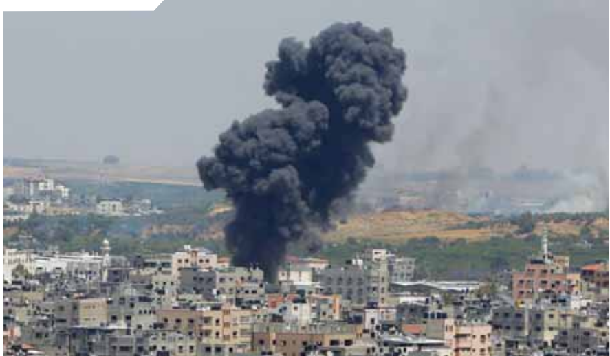
Smoke rises from a building after an Israeli airstrike in Gaza City