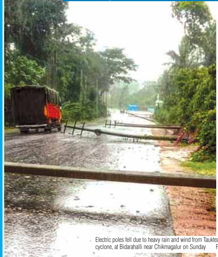
Electric poles fell due to heavy rain and wind from Tauktae cyclone, at Bidarhalli near Chikmagalur on Sunday

Cyclone claims 8 lives, inoculation drive suspended in costal areas