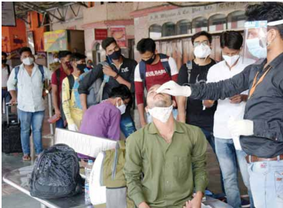
Passengers being tested for Covid upon their arrival at Charbagh railway station on Sunday

“Out of a total of 1.63 lakh active corona cases, 1.34 lakh patients are in home isolation while others are undergoing treatment in government and private hospitals. Under the