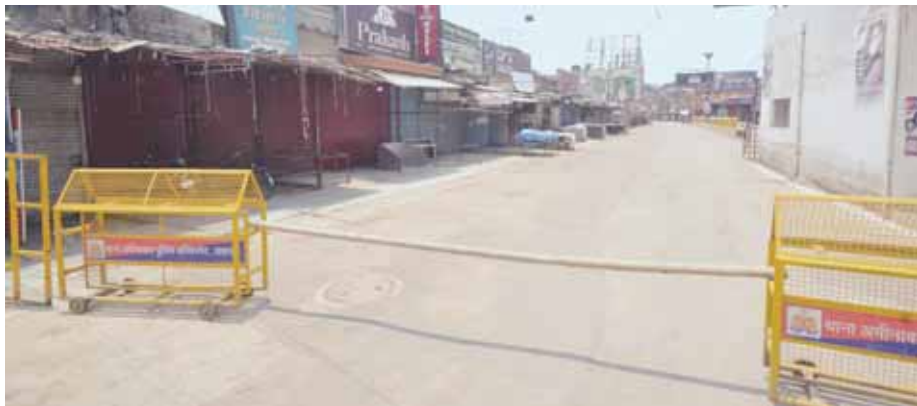
Aminabad market wears a deserted look on Sunday

He admitted that it is difficult to think about the scenario in June, the main harvesting period. “However, with the slowing down of the infection rate, it seems that as compared to the present scenario, better environment will prevail. An additional advantage this year is that the major harvesting was scheduled after Ramzan,” he pointed out.