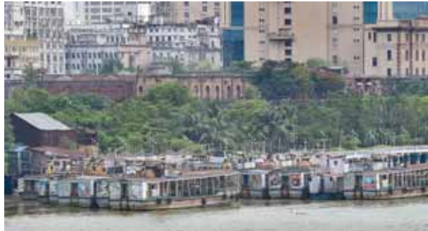
Ferries stay anchored on the Ganga river during the Covid-induced lockdown in Kolkata on Sunday

All government and private offices, shopping complexes,