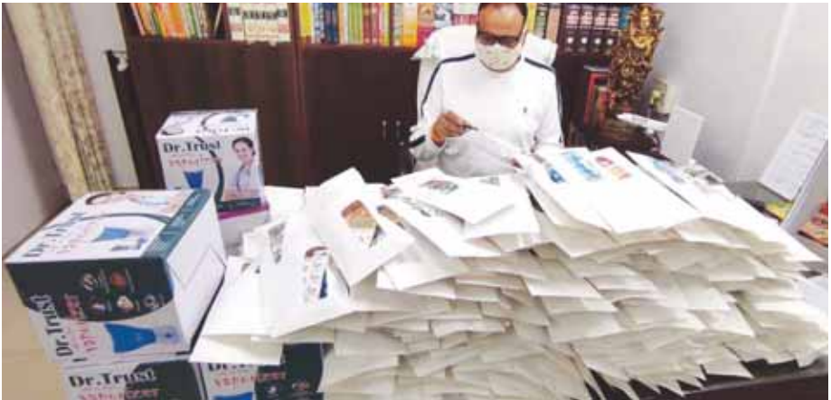
Minister Brajesh Pathak has been distributing 800 to 1,000 packets of medicines prescribed to combat coronavirus infection among the symptomatic poor and needy through BJP volunteers

beds and people are not getting ambulances on time,” Pathak wrote, painting a pathetic picture of the state of affairs in Lucknow. While refusing to delve on the one-page missive that spurred the administration to improve healthcare in Lucknow, Pathak said: “The state government is doing its job, but as an individual I am trying my best to help the people in distress.”