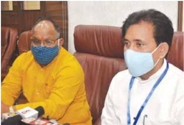
UP Minister Anil Rajbhar addressing a press conference in Varanasi on Sunday

Meanwhile, as many as six new patients infected with this deadly black fungus have been detected and admitted to SSH BHU, increasing the total number of such patients to 29 in the district. The woman infected with black fungus was admitted to the hospital where the specialists from the ENT department, SSH BHU, tried their best to save her life by removing the infected left eye,