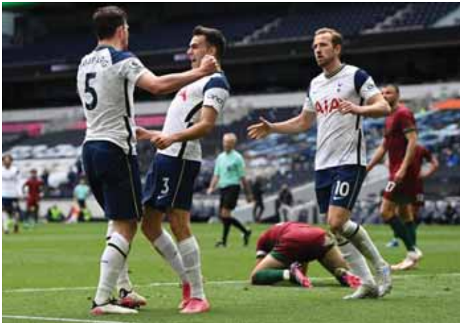
Pierre-Emile Hojbjerg, left, celebrates with teammates after scoring Spurs second goal