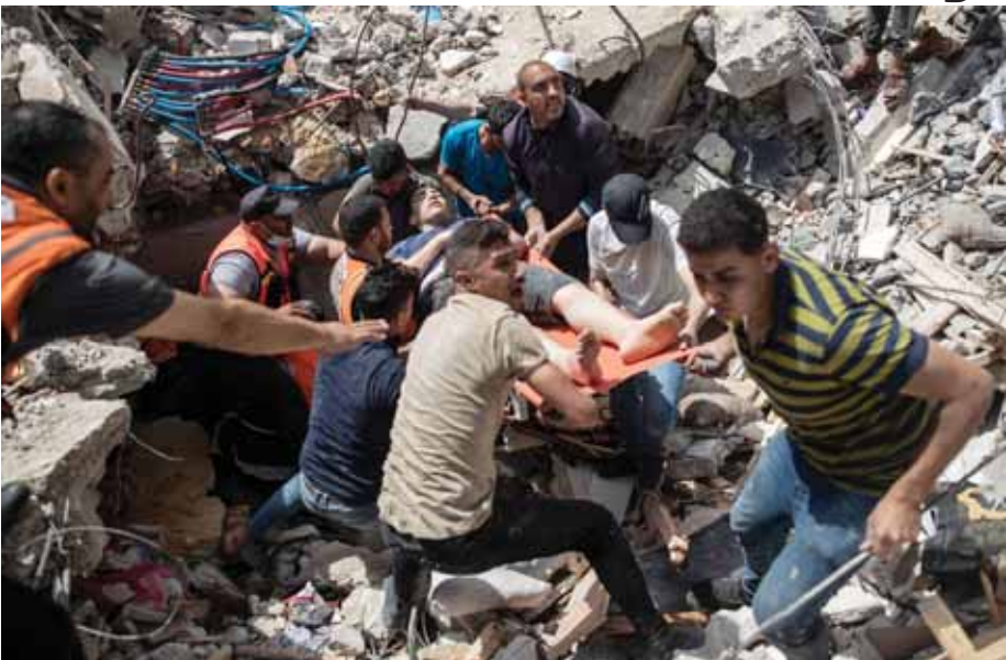
Palestinian rescue a survivor from under the rubble of a destroyed residential building following deadly Israeli airstrikes in Gaza City, Sunday

In its airstrikes, Israel has leveled a number of Gaza City’s tallest office and residential buildings, alleging they contain Hamas military infrastructure. Among them was the building housing The Associated Press office and those of other media outlets.