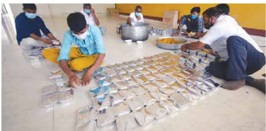
LMC workers making food packets to be distributed among labourers