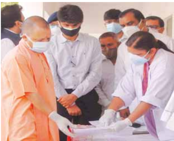
Chief Minister Yogi Adityanath inspecting Covid work at the Chhaprauli village PHC in Gautam Budh Nagar on Sunday

Admitting that the viral infection has infiltrated into the