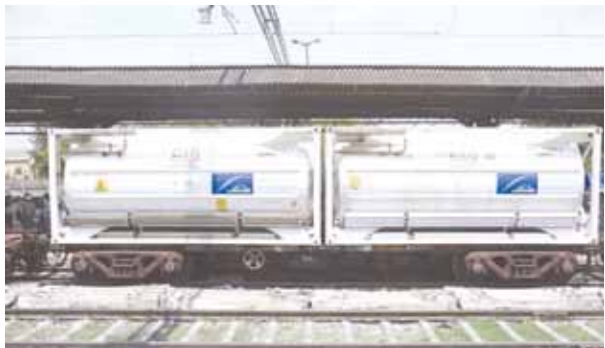
Oxygen Express arrives at Nakaha Jungle railway station

This Oxygen Express was run at an uninterrupted speed and covered a distance of 840