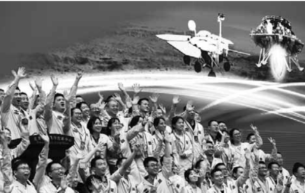
members at the Beijing Aerospace Control Centre celebrate after China's Tianwen-1 probe successfully landed on Mars, at the centre in Beijing, Saturday