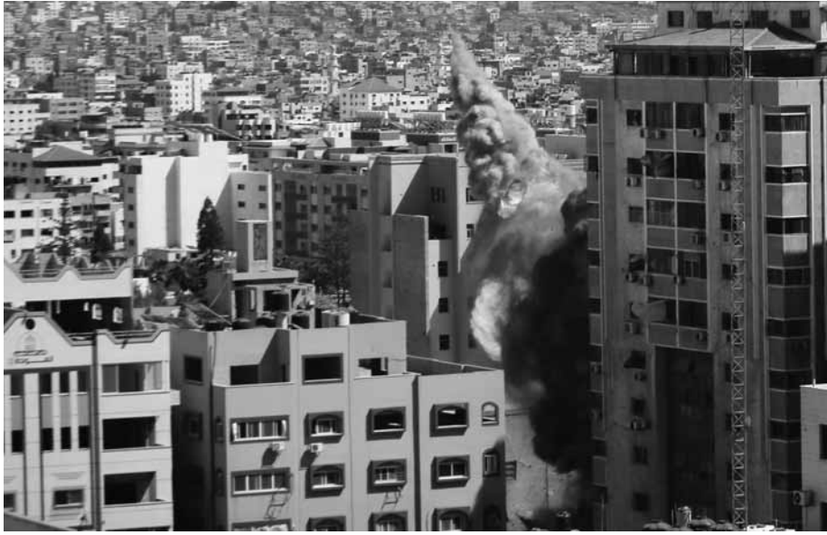
An Israeli airstrike hits the high-rise building housing The Associated Press' offices in Gaza City on Saturday