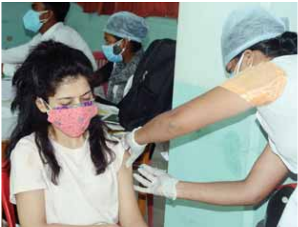
A medic administers Covid-19 vaccine dose to a beneficiary during the 2nd day of 18 plus vaccination drive at a vaccination centre, in Ranchi on Saturday

“The leaders of the Congress and the Grand Alliance formed negative propaganda among the people by naming the anti-corona vaccine as the Modi vaccine and the BJP vaccine. The M a h a g a t h b a n d h a n government and the Congress party are making unsuccessful efforts to hide their failures by making frivolous rhetoric on the Central government to hide their failures,” he said.