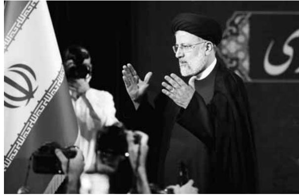
Ebrahim Raisi, head of Iran's judiciary leaves a news conference after registering his candidacy for the June 18 presidential elections at the elections headquarters of the Interior Ministry in Tehran, Iran on Saturday

Raisi, wearing a black turban that identifies him in Shiite tradition as a direct descendant of Islam's Prophet Muhammad, offered fiery remarks to jour-