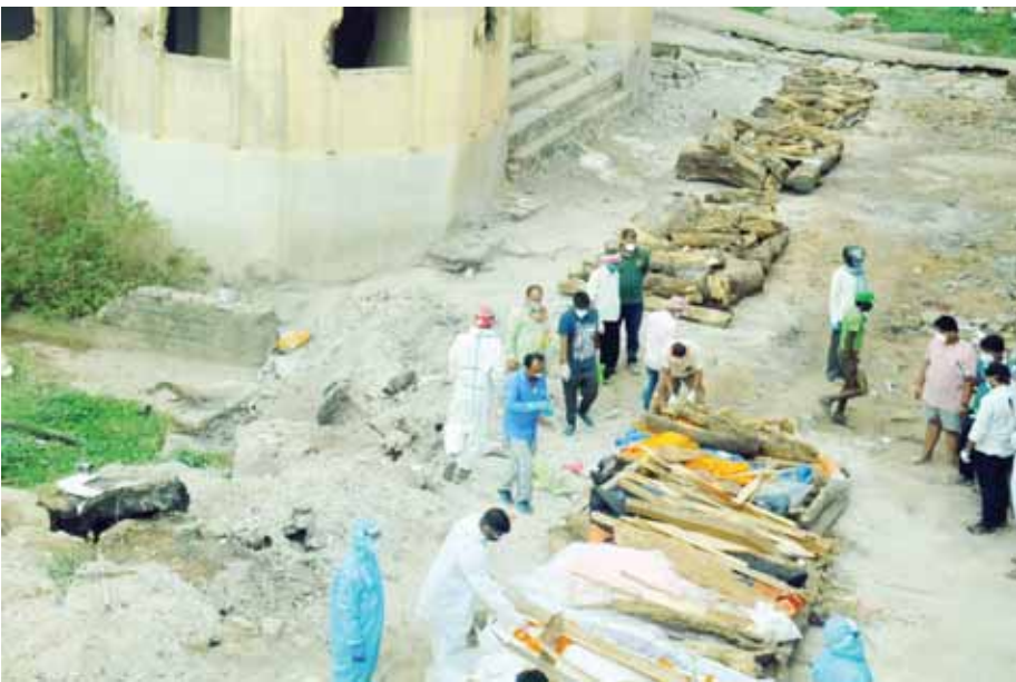
Relatives and family members during mass cremation of Covid-19 victims, at Swarn Rekha cremation site, Ghaghra in Ranchi

Meanwhile, a PIL was also filed at the Jharkhand High Court seeking to end the intricacies of the e-pass system. A special request has been made to the Court for early hearing on this PIL.