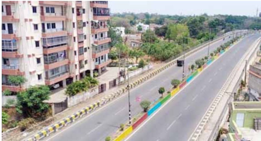
A deserted road of Ranchi Over Bridge during lockdown