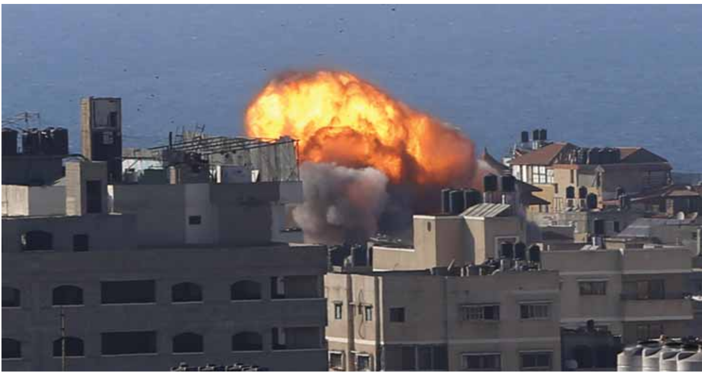
Smoke rises following Israeli airstrikes on a building in Gaza City on Friday

It says, "The day that enemies usurp part of Muslim land, jihad becomes the individual duty of every Muslim. In face of the Jews usurpation of Palestine, it is compulsory that the banner of jihad be raised. To do this requires the diffusion of Islamic consciousness among the masses,