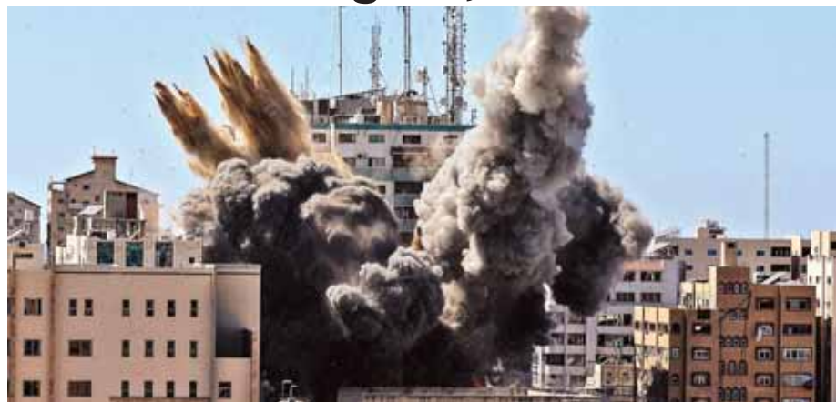
A ball of fire erupts from a building housing various international media, including The Associated Press, after an Israeli airstrike on Saturday in Gaza City