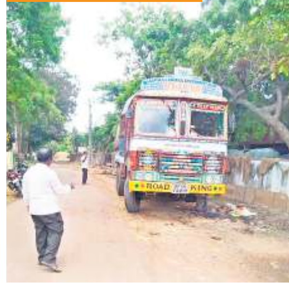
Officials seized a lorry laden with PDS rice at Nachugunta in Unguturu mandal of West Godavari district on Sunday.