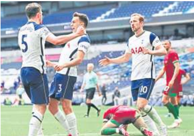
Pierre-Emile Hojbjerg, left, celebrates with teammates after scoring Spurs second goal