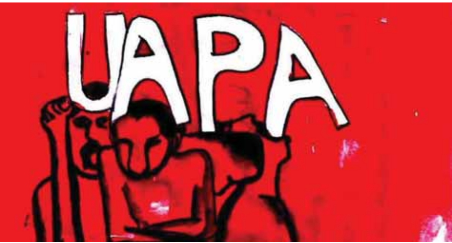
PTI ■ NEW DELHI

The Editors Guild of India (EGI) on Sunday condemned the Tripura Police's action of booking 102 people, including journalists, under the Unlawful Activities (Prevention) Act and said the government cannot use such stringent laws to suppress reporting on communal violence incidents.