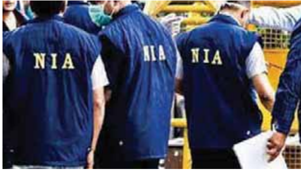
PTI ■ RANCHI

The NIA has conducted searches at two premises of an accused in connection with conspiracy and commission of terrorist acts for extortion and disruption of Government works in Jharkhand's Latehar, an official said on Sunday.