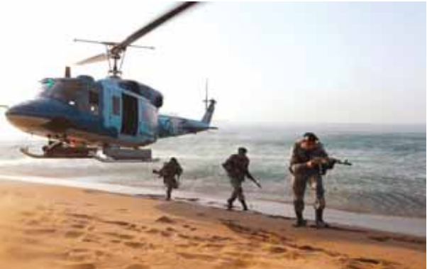
In this picture released by the Iranian Army on Saturday, troops attend a maneuver in a coastal area in southeastern Iran

Iran's military began its annual war games in a coastal area of the Gulf of Oman, state TV reported Sunday, less than a month before upcoming nuclear talks with the West. The report said navy and air force units as well as ground forces were participating in a more than 1 million square-kilometer (386,100 square-mile) area east of the strategic Strait of Hormuz. Nearly 20% of all oil shipping passes through the strait to the Gulf of Oman and Indian Ocean. The drill comes amid heightened tensions between Iran and the US in the wake of former President Donald Trump's unilateral withdrawal of America from Iran's 2015 nuclear deal with world powers. State TV said brigades including commandos and airborne infantry deployed for the annual exercise. Fighter jets, helicopters, military transport