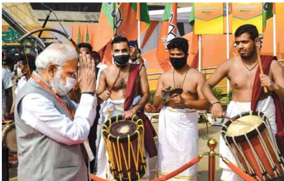
Prime Minister Narendra Modi arrives to attend the National Executive Committee meeting of the Bharatiya Janata Party (BJP) at the NDMC Convention Centre in New Delhi on Sunday

The meeting, presided over by party president JP Nadra, was attended by Prime Minister Narendra Modi, Union Ministers Amit Shah, Nitin Gadkari, Rajnath Singh, Nirmala Sitharaman, S