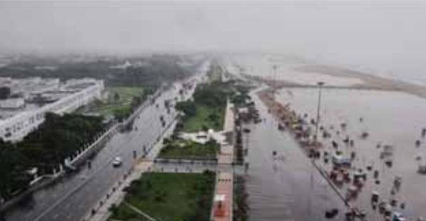
A view of Marina Beach following heavy rain in Chennai on Sunday. A flood alert has been sounded for people living in Chennai's suburbs

Health Minister Ma Subramanian said Chennai experienced 20 cm rain in about 12 hours since last night. According to IMD data, the rainfall ranged between 10 CM and 23 CM in Chennai and its suburbs. The Kamarajar Salai point (DGP Office on the Marina beachfront) near the Tamil Nadu Secretariat recorded the highest of 23 CM and