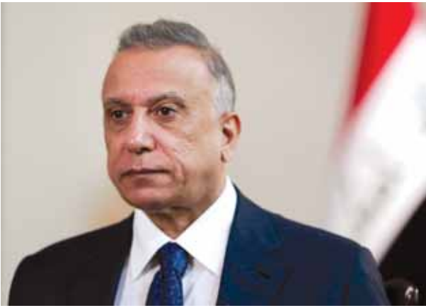
Iraqi Prime Minister Mustafa al-Kadhimi

Minister tweeted shortly after the attack. He called for calm and restraint, "for the sake of Iraq." He later appeared on Iraqi television, seated behind a desk in a white shirt, looking calm and composed. "Cowardly rocket and drone attacks don't build homelands and don't build a future," he said. In a statement, the Government said an explosives-laden drone tried to hit al-Kadhimi's home. Residents of Baghdad heard the sound of an explosion followed by heavy gunfire from the direction of the Green Zone, which houses foreign embassies and government offices. The statement released by state-run media said security forces were "taking the necessary measures in connection with this failed attempt."