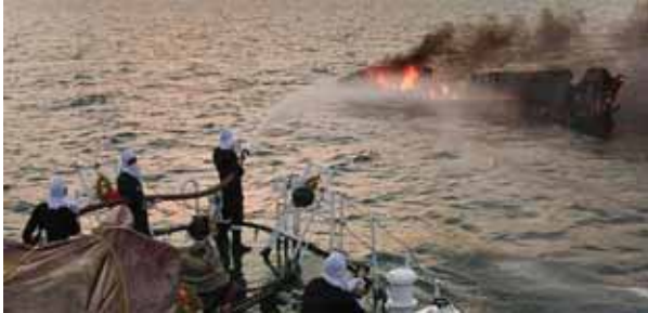
Indian Coast Guard men onboard ICGS Arush douse a fire on a fishing boat, in the Arabian Sea on Sunday. Seven fishermen were rescued