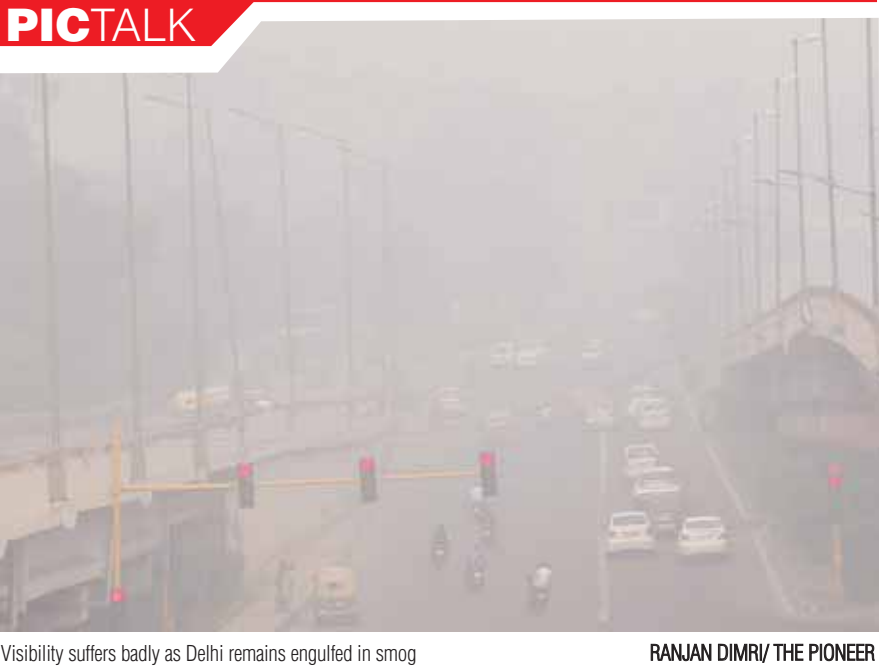
Visibility suffers badly as Delhi remains engulfed in smog

Diwali was supposed to be a festival of lights, not a festival of noise. Moreover, the folks at their homes — especially the older and younger ones — would inhale the same air that they are proudly polluting. A similar story is with the stubble burning. The farmers see it as an easy and cheaper way to clear their fields for the next crop, realising little that it also kills favourable microbes that help the growth of plants. Let's not forget that toxic air kills more than one million people each year in the country. Last year, Delhi recorded the highest concentration of PM2.5 so far — it was at 14 times the safe prescribed by the World Health Organisation (WHO)! So what is the solution? Again, this has no quick fix solution or can be tackled by banning it and penalising people, which would have its repercussions. A gradual persuasive approach coupled with better alternatives can tackle the problem. For instance, developing 'Harvesters' that can cut the crop from its root. Even small handheld mechanised machines can be employed to do the job. Similarly, community fireworks should be promoted wherein people pool up to enjoy firecrackers in the safe, identified places away from their residential areas. We have tackled vehicular pollution in a big way by replacing the lead mix petrol and diesel with the CNG. It worked, so there is no reason that these pollutants cannot be tackled.