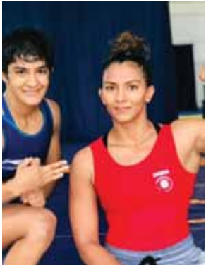
Games gold medallist responds to the challenges ahead.

Much water has flown under the bridge since she stopped competing on the mat and it will be interesting to see how the 2010 Commonwealth