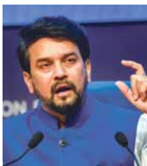
Union Minister for Information & Broadcasting Anurag Singh Thakur during the Cabinet briefing in New Delhi on Wednesday

Munda birth anniv now to be Janjatiya Gaurav Divas