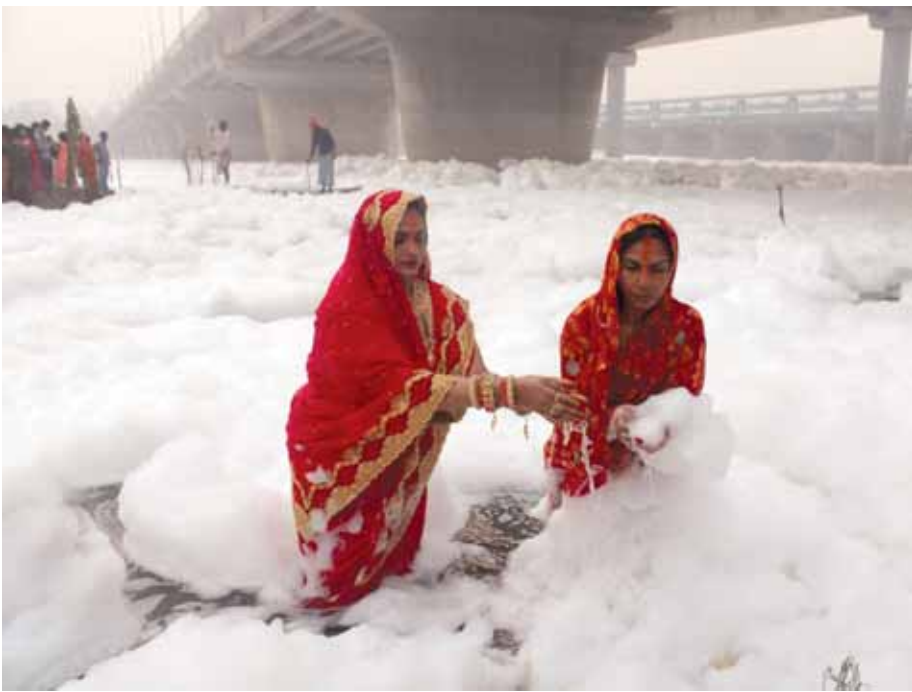
Braving the polluted waters of the Yamuna, devotees perform rituals during the Chhath Puja in New Delhi on Wednesday