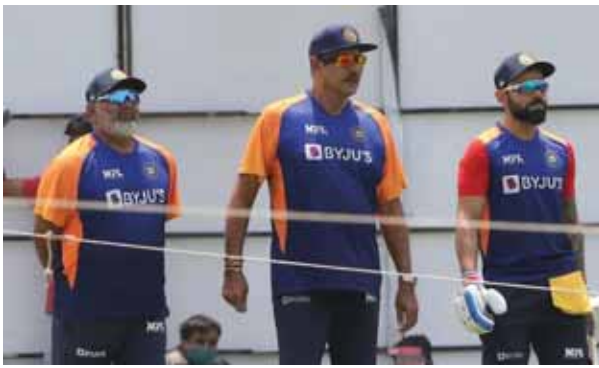
T20 captain with Rahul Dravid in charge as head coach. It is expected that Rohit

will take over the reins of ODI captaincy as well during the tour of South Africa.