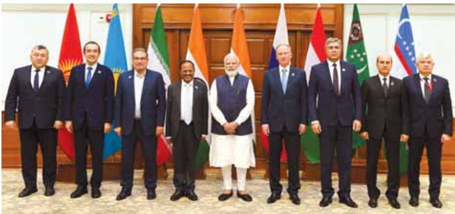
Prime Minister Narendra Modi poses for a group photograph with the National Security Advisors (NSAs) of seven foreign nations and India, in New Delhi on Wednesday

The National Security Advisors (NSAs) later called on Prime Minister Narendra