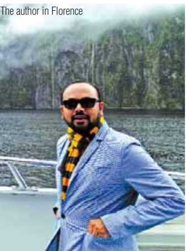
The author in Florence

The rhythms of antiquity set in as you reach Santa Maria del Fiore. It is the tallest