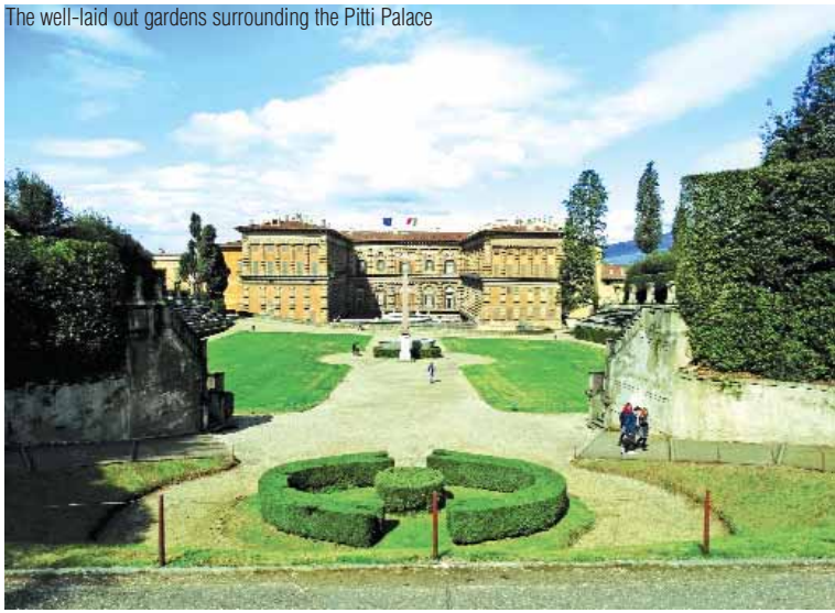
The well-laid out gardens surrounding the Pitti Palace