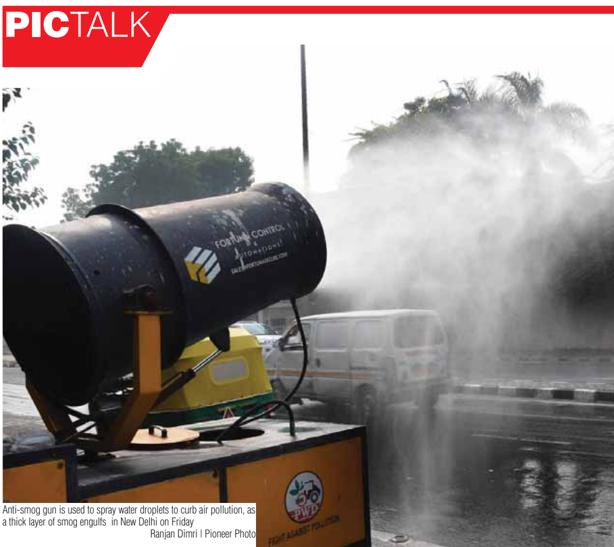
Anti-smog gun is used to spray water droplets to curb air pollution, as a thick layer of smog engulfs in New Delhi on Friday

states, including Uttar Pradesh, Haryana and Himachal Pradesh, slashed the Value-Added Tax (VAT) on fuel prices, thereby making the rates cheaper than in Delhi. Delhi Deputy Chief Minister Manish Sisodia had last week said the city government already has “less resources” in terms of revenue generation. He had also pointed out that the Aam Aadmi Parti (AAP) dispensation was exploring what steps could be taken to provide relief in terms of reduction in the VAT on fuel prices. Sisodia had said the Centre should further cut the fuel prices by at least Rs 15 per litre.