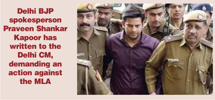
STAFF REPORTER ■ NEW DELHI