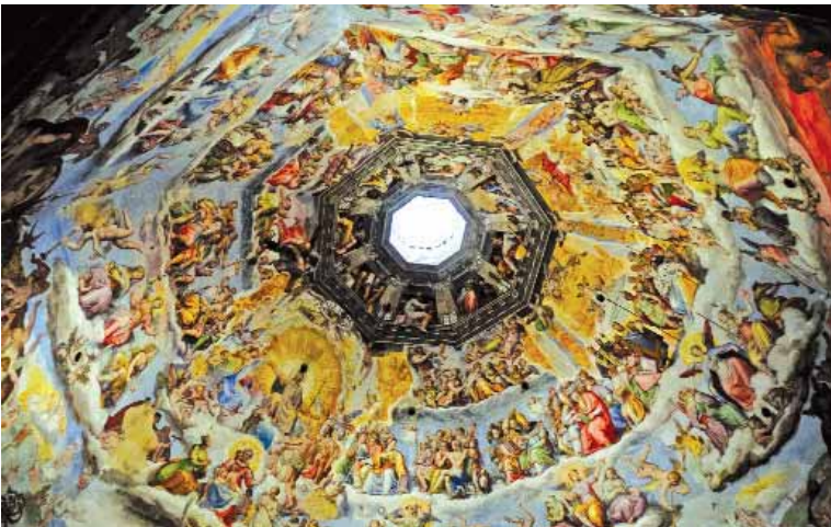
The frescoes of the Last Judgment on the ceiling of the Duomo di Firenze

building in the city and the fourth largest church in Europe, which was completed in 1436. Built in Gothic style, it is a UNESCO World Heritage Site. The cathedral complex is famous for its bronze doors and magnificent exteriors. Michelangelo famously called them the 'gates of paradise'. The cathedral, in a combination of white, green and pink marbles, is ethereal. While entry is free, you will have to brave long queues and crowds to get in. It is topped off by the iconic Duomo di Firenze. One can see wide-eyed tourists gazing at its beautiful ceiling, transfixed at the frescos of the Last Judgement (1572-9). Though credited to Giorgio Vasari, it was completed by Federico Zuccaro five years after the former's death. It also has painter Domenico di Michelino's (1417-1491) most famous work, Comedy Illuminating Florence, on the north wall of the cathedral of Santa Maria del Fiore. It depicts Dante Alighieri