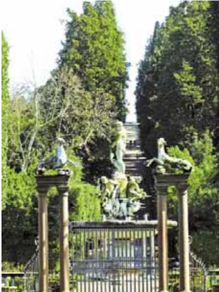
Boboli Gardens are a UNESCO World Heritage Site

The Boboli Gardens, another UNESCO World Heritage Site, behind the Pitti Palace are