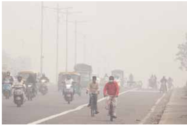
Vehicles ply amid low visibility due to a thick layer of smog in New Delhi on Friday

As thick layers of smog affected visibility and revived the yearly menace of winter-time pollution in Delhi on Friday, the Central Pollution Control Board (CPCB) advised people to avoid going outdoors and asked Government and private offices to reduce vehicle usage by 30 per cent.