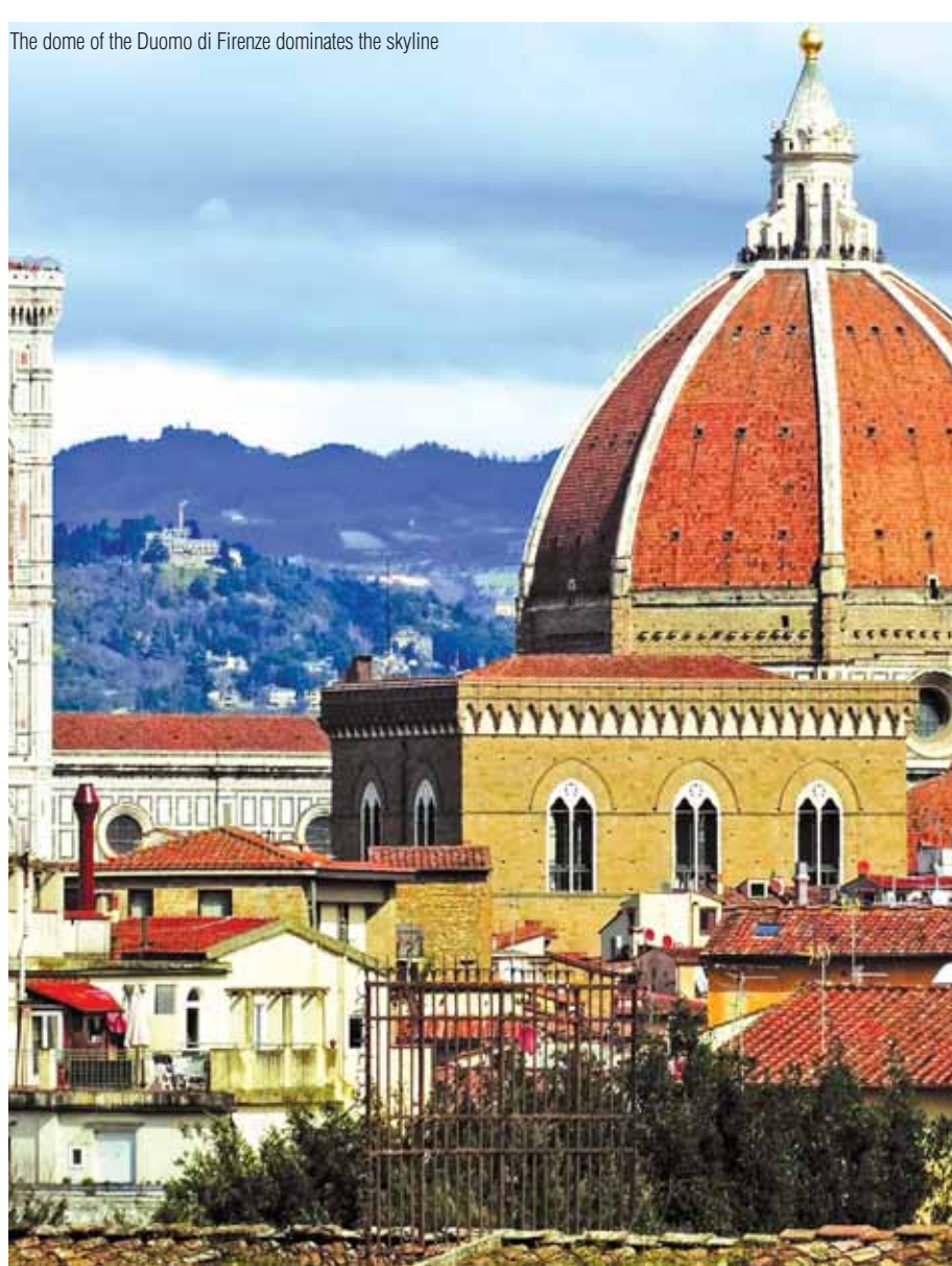
The dome of the Duomo di Firenze dominates the skyline

The confident and bold, orange octagonal dome soaring in the sky has bewitched the world for centuries. Duomo di Firenze, built by Filippo Brunelleschi, is both — a massive architectural and a mystery — even today. Just the description is enough to fire the imagination of most travellers and make them immediately cue into the city: Florence, it is.