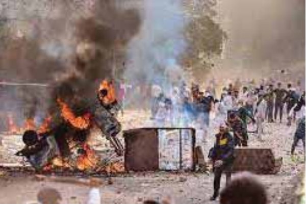
NEW DELHI