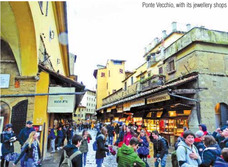
Ponte Vecchio, with its jewellery shops