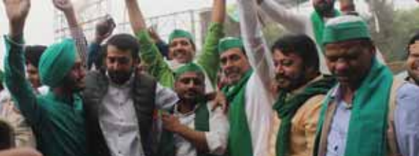
Farmers celebrate with sweets after Prime Minister Narendra Modi announced the repealing of the three farm laws, at Ghazipur border, in New Delhi on Friday

At Singhu borders, scores of farmers, with smile on their face, distributed sweets and they were seen dancing to songs blaring out of music systems placed on tractors. Same scenes were witnessed at Tikri border while hundreds of