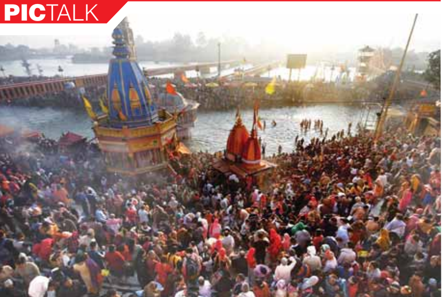
Devotees bathe in the Ganga on the occasion of Kartik Purnima, in Haridwar

Any changes in the mode of farming or handling produce have societal implications. This is reason enough for such a reform to pass people's scrutiny before becoming law. So much so, the Supreme Court, which ordered a stay on the implementation of the laws this January, did not act on the report of a committee it appointed on resolving the farm laws controversy. A committee member even wrote to the Chief Justice, saying there was no point in keeping the report in cold storage while the protests raged. The apex court perhaps thought it fit to allow the Executive and Legislature to handle the matter as it primarily falls in their domain. The Government will address the agriculture reforms issue once again in the coming days. The hasty ordinance route can be avoided and the Bills must first be subjected to parliamentary scrutiny and then debated in both Houses. Of late, it has become a norm of sorts for Parliament to focus only on debating laws before passage because that is what Parliament rules say. There is no practice of Bills being first mandatorily referred to parliamentary committees. As a result, very few Bills are referred and most legislative proposals fail to get full parliamentary attention. Members debate the Bills without the benefit of a comparative study of the Government's proposals and the committees' recommendations. That is what happened with the three farm laws, too, and the result is there for all to see. It's time to restore the sanctity of law-making.