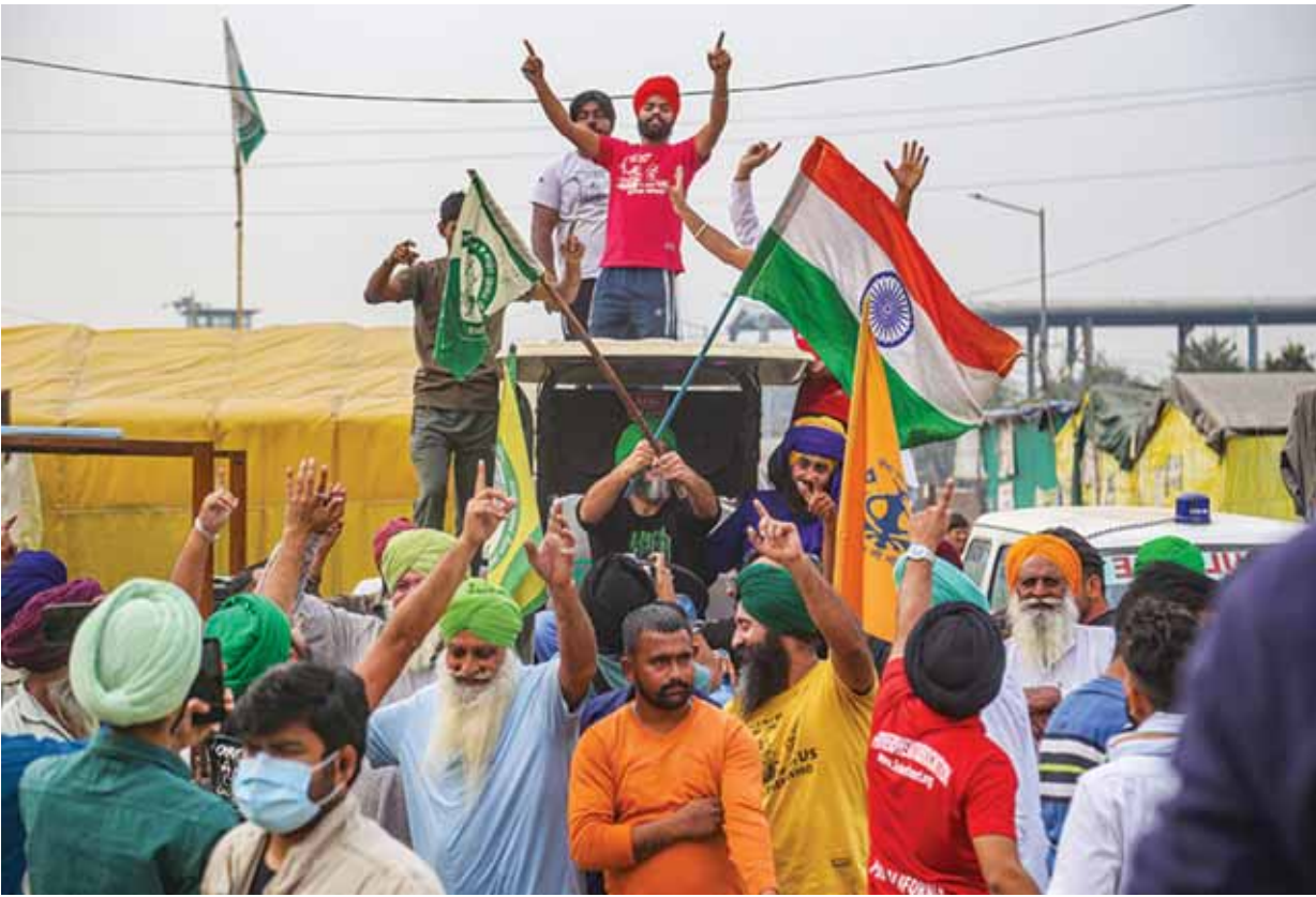
Farmers dance as they celebrate after hearing the good news regarding the repeal of the three farm reform laws, at Tikri Border in New Delhi on Friday