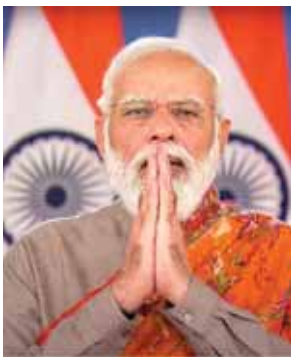
Prime Minister Narendra Modi gestures during his address to the nation in New Delhi on Friday

With eyes on the forthcoming polls in Punjab and Uttar Pradesh (UP), Prime Minister Narendra Modi on Friday — coinciding with Gurmurab day — announced the withdrawal of the three controversial farms laws which his Government strongly defended for nearly two years and said “sorry” to the very farmers who his party men painted as anti-nationals along with anyone who threw their lot behind the protestors.