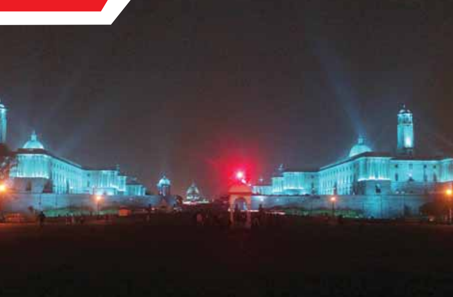
Rashtrapati Bhawan illuminated in blue to support child rights on the eve of World Children's Day in New Delhi on Friday