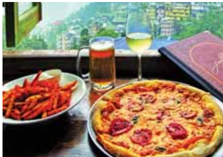
Jimmy's Italian Cafe

We were told that camping was very much a norm near the place, though not in the rainy season.