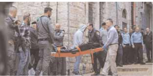
Israeli security personnel and members of Zaka Rescue and Recovery team carry the body of a Palestinian man who was fatally shot by Israeli police in Jerusalem's Old City on Sunday

Police said the attack took place near an entrance to a contested flashpoint shrine known to Jews as the Temple Mount and to Muslims as the Noble Sanctuary. Violence surrounding the site, which is considered holy by both faiths, has triggered previous rounds of fighting between Israel and the Palestinians, most recently in May.