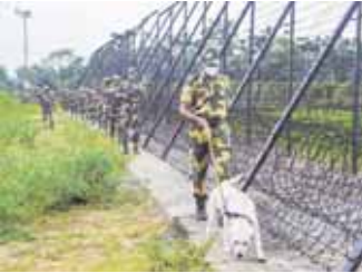
vagaries of sub-zero temperatures.

Behind the FDLs on the Indian side are multiple rings of the Army's counter-infiltration deployments. Troops at these icy locations, having altitudes in the range of 8,000-16,000 feet, at present live in CGI (corrugated galvanised iron) sheet-made hutments along with their rations and weapons, exposing them to the