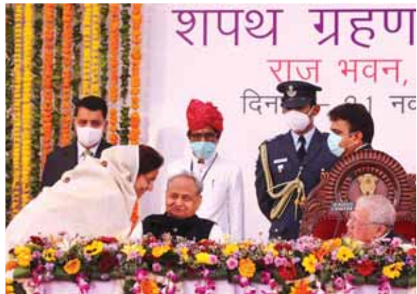
Shakuntala Rawat takes oath as Cabinet Minister in the presence of Rajasthan Chief Minister Ashok Gehlot and Governor Kalraj Mishra during a swearing-in-ceremony, at Raj Bhawan in Jaipur on Sunday

The new Ministers are Ram Lal Jat, Mahesh Joshi, Mahendrajeet Singh Malviya,