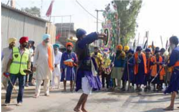
Nihangs and farmers take part in a procession (Nagar Kirtan) at the Singhu border

"Playing iktara is my hobby and from the past few years, I