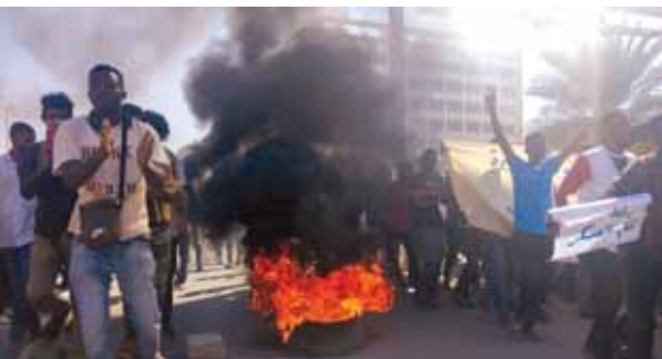
Protesters burn tyres as they rally on a street in Khartoum on Sunday

"The signing of this deal opens the door wide enough to