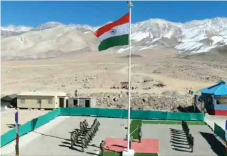
A 76 ft tall National Flag at 15,000 ft hoisted by the Indian Army and Flag Foundation of India, overlooking the Hanle Valley in Ladakh by the Fire and Fury Corps, Indian Army