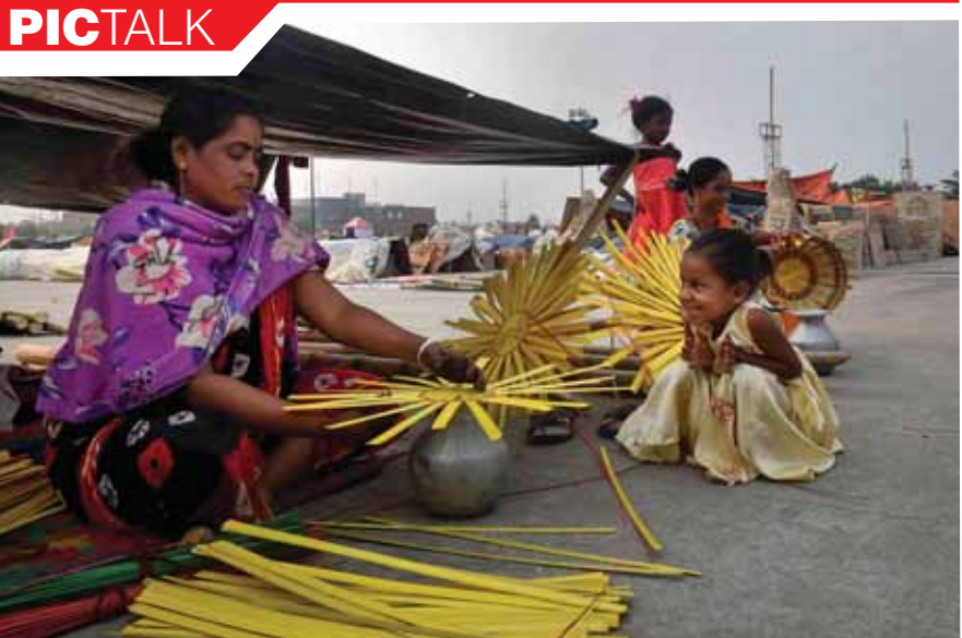
Women make bamboo baskets to sell on the eve of Hosto Silpo Mela, in Kolkata

In India, like in the United States, farm animals like cows have a central place in the Indian way of life, politics and culture. The United States has a vast legal framework concerning milk whereas the Indian constitution has a clear provision on cattle welfare. For separate reasons, cows are enmeshed in both countries in exclusionary politics, reflecting existing differences between religious communities and ideologies. The right of farmers to sell ageing cows for slaughter is caught in a Hindu versus Muslim debate, ignoring the role slaughter plays in preserving the species by replacements with younger stock and protecting farmers' livelihoods. A Government move to introduce milk instead of eggs in the mid-day meal scheme in schools has generated debates over milk versus egg and vegetarianism. Currently, milk and dairy products are stuck in a double controversy, with People for the Ethical Treatment of Animals (PETA) asking Amul not only to switch to vegan milk but also stop cruelty to animals in the dairy industry. And around the corner is another issue with the potential to raise a 'white' storm: including milk in the public distribution system because the poor also have a right to drink milk.