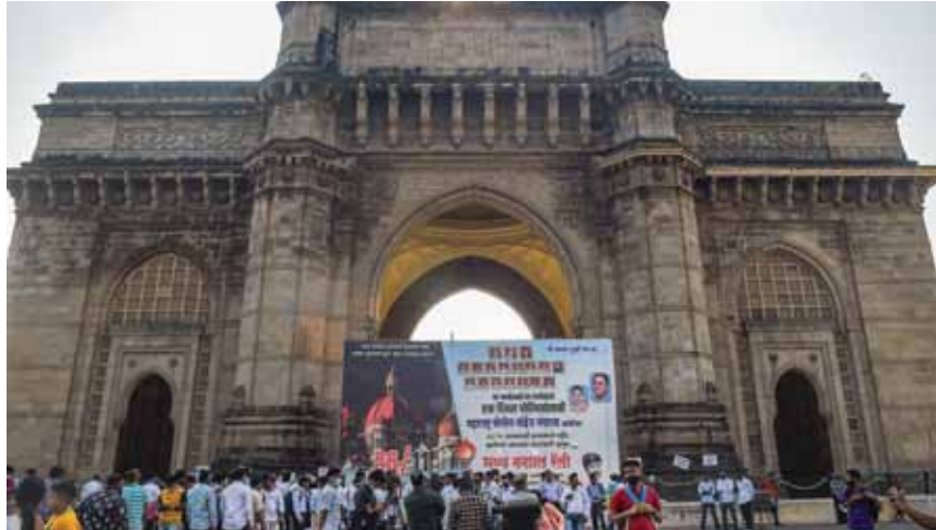
Members of Police Charitable Trust hold placards at the Gateway of India to mark the 13th anniversary of the 26/11 terror attacks, in Mumbai on Friday

A large number of Police personnel turned up to pay homage to their colleagues