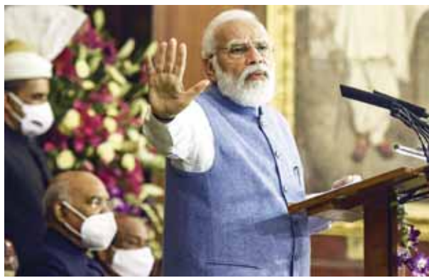
Prime Minister Narendra Modi addresses a function to commemorate the 'Samvidhan Divas' at Parliament in New Delhi on Friday

Besides the constituents of the National Democratic Alliance (NDA), parties such as the Biju Janata Dal, the YSR Congress, the Telangana Rashtra Samithi, the Bahujan Samaj Party and the Telugu Desam Party attended the