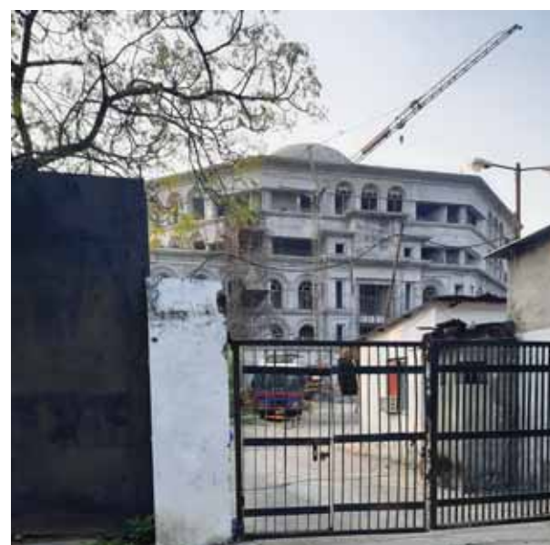
New legislative complex in Jammu