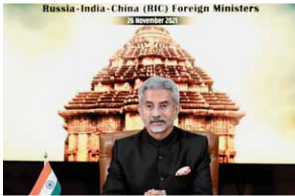
External Affairs Minister S Jaishankar digitally chairs the 18th Russia-India-China (RIC) Foreign Ministers' Meeting

Participating in the meeting in the virtual format along