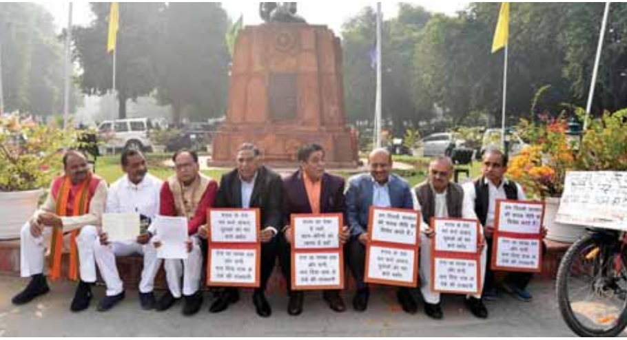
Leader of Opposition in Delhi Legislative Assembly Ramvir Singh Bidhuri and BJP MLAs sit on a dharna near the Gandhi statue at Delhi Assembly in New Delhi on Friday

The Centre on Thursday had asked all States and Union Territories to conduct rigorous screening and testing of all international travellers coming from or transiting through South Africa, Hong Kong and Botswana, where a new Covid-19 variant of serious public health implications has been reported. The new variant of Covid-19, feared to have a high amount of spike mutations unseen before, has been detected in South Africa, with authorities there confirming 22 positive cases associated with it on Thursday