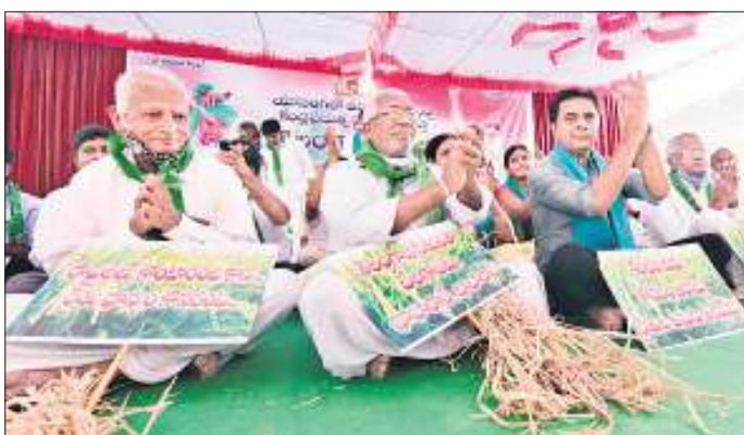
TRS working president KT Rama Rao claps along with farmer leaders during a protest against the Centre demanding an assurance on Yasangi paddy procurement, at Siricilla on Friday.

The TRS leaders said that the response of farmers to dharnas called by the ruling party was proof that farmers are more worried about paddy to be cultivated in the Yasangi season.