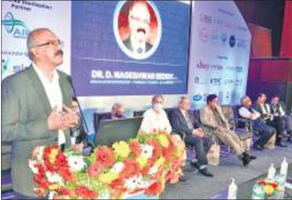
Dr D Nageshwar Reddy, Founder AIG Hospitals seen addressing the participants at the inaugural session of PHIC-2021

“What we saw during the peak of the pandemic was different. In some cases, entire families were wiped out. Doctors themselves didn’t know how to deal with it. We were frightened. It was like a soldier going to war without weapons. To add to it, WHO predictions were like our weather predictions,” he said. AIG Hospitals treated 30,000 Covid patients in the last two years, he added.