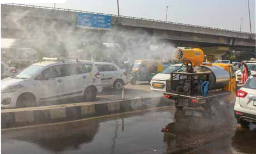
An anti-smog gun sprays water droplets to curb air pollution, in Gurugram