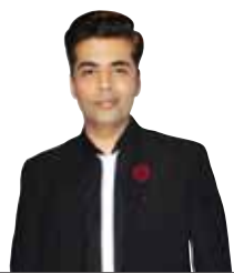
Bollywood 'Rajkumar Rao and Janhvi Kapoor's is a partnership to look forward to.' —Karan Johar