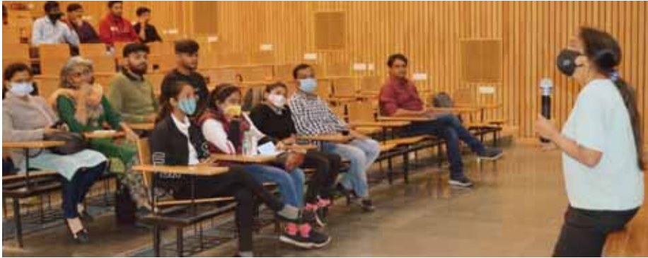
Workshop on REC Innovation Platform being conducted at IIT Kanpur on Wednesday.