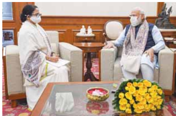
Prime Minister Narendra Modi meets West Bengal Chief Minister Mamata Banerjee in New Delhi on Wednesday

Congress' loss is TMC gain: Sangma joins Didi's party