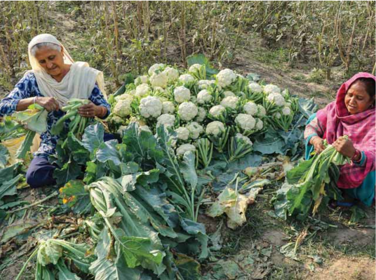
Women farmers harvest cauliflower on the outskirts of Jammu on Wednesday

"Heavy rains caused inundation of low-lying areas and disrupted normal life. The gravity was such that 17 teams of NDRF and SDRF and two helicopters had to be deployed for undertaking search and rescue operations. In all, 1,402 villages in 196 mandals and four towns were affected," the Chief Minister said.