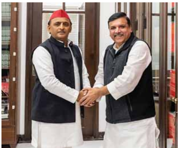
Samajwadi Party president Akhilesh Yadav meets AAP leader Sanjay Singh in Lucknow on Wednesday

Recently Singh had visited the residence of SP patriarch