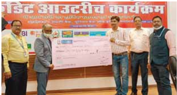
Central Bank of India distributing a loan at an outreach programme in Varanasi

CONG TAKES OUT PROCESSION: Under the on-going assembly-wise protest