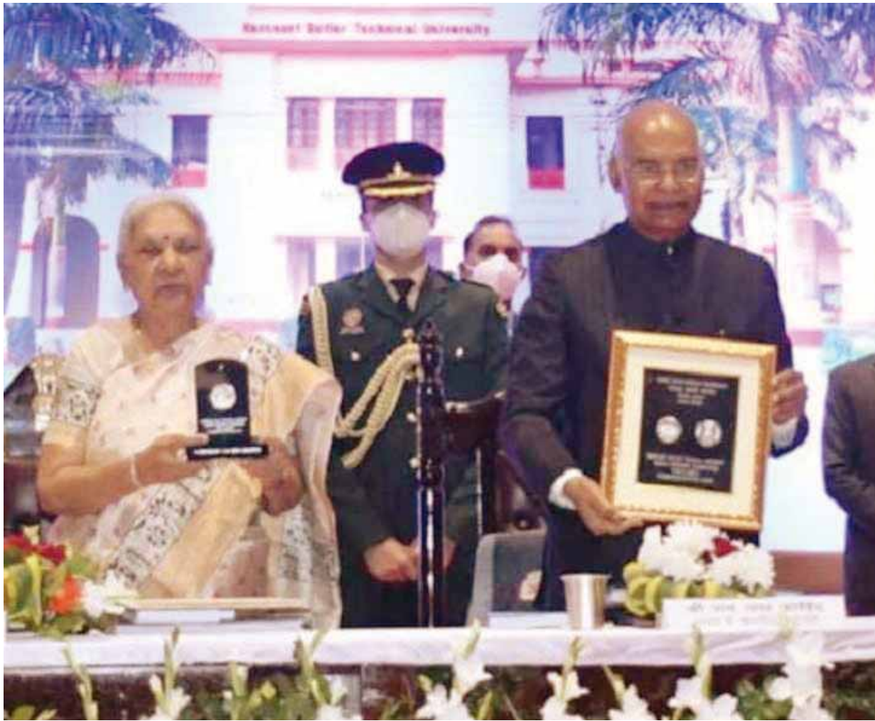
President Ram Nath Kovind and Governor Anandi Ben presiding over the function on Thursday.