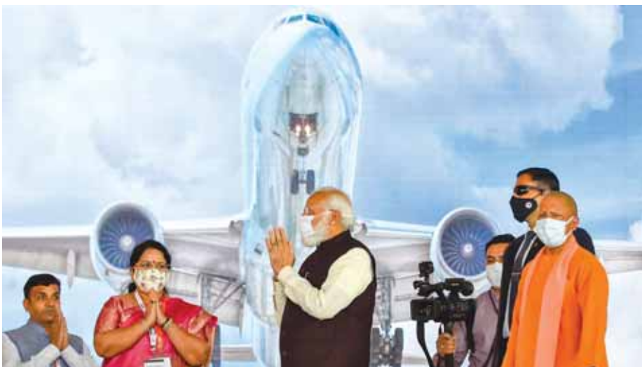
Prime Minister Narendra Modi during the foundation stone laying ceremony for the Noida International Airport at Jewar in Gautam Buddha Nagar district on Thursday. UP CM Yogi Adityanath is also seen

“But it is now getting what it always deserved and is making its mark internationally under a double-engine BJP rule,” Modi said, adding that the Noida International Airport