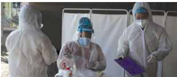
In this file photo from June, healthcare workers prepare to test patients for Covid-19 at the Lancel Laboratories in Johannesburg

South Africa last year detected the Beta variant of the virus although until now infection numbers have been