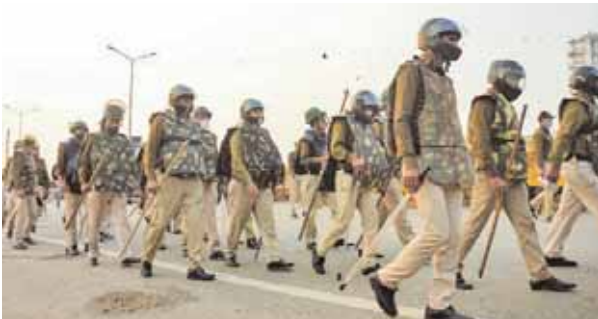
Security personnel at the Ghazipur border ahead of the 'Kisan Mahapanchayat' on the first anniversary of the farmers' agitation, in Ghaziabad on Thursday

After an announcement by Prime Minister Narendra