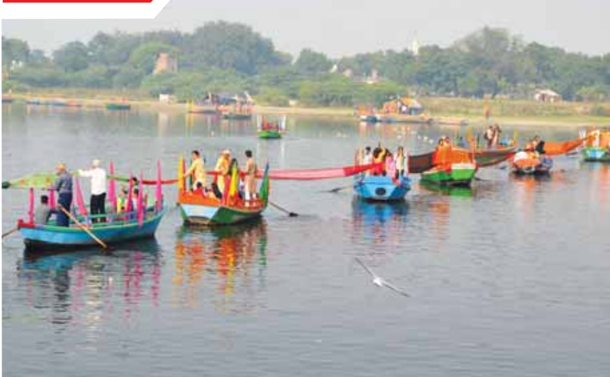
Devotees cover the Yamuna with sarees during Chunari Manorath festival, in Mathura