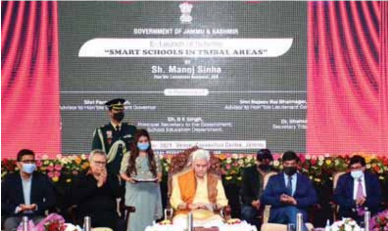
Lt Governor Launches 200 Smart Schools in Tribal Areas

gratulated the Tribal communities and the concerned administrative departments for the historic beginning of the new era of educational empowerment of Tribals in J&K.