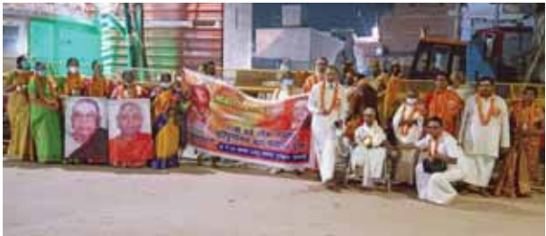
Omkara Ashram devotees going to Kashi Vishwanath temple for offering Dugdhabhishek in Varanasi on Thursday.