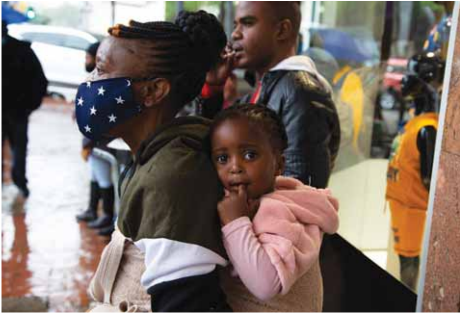
A woman wearing a face mask to curb the spread of Covid-19 holds a child on her back on a crowded sidewalk in Pretoria, South Africa on Saturday. As the world grapples with the emergence of the new variant of COVID-19, scientists in South Africa — where omicron was first identified — are scrambling to combat its spread across the country

Government insisted that South Africa’s “capacity to test and its ramped-up vaccination