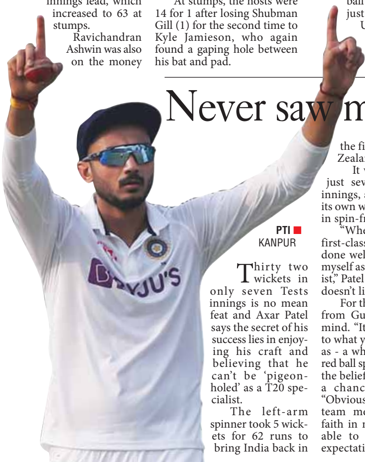
PTI ■ KANPUR