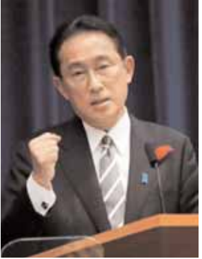
Japanese PM Fumio Kishida

“I will consider all options, including possessing so-called enemy base strike capability, to