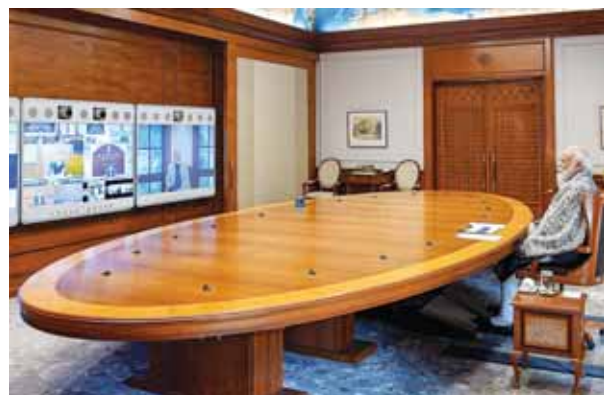
PM Narendra Modi chairs a meeting on the situation relating to Covid-19 with top officials, through video conferencing in New Delhi on Saturday

The PM was also given details about the seropositivity in the country from time to time and its implications in public health response," said the PMO in a statement about the two-hour-long review meeting chaired by the PM.