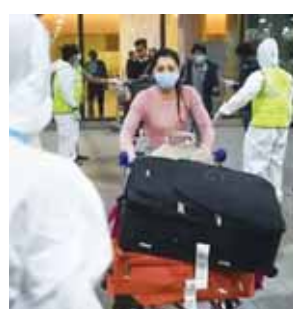
time. Making an announcement

Hours after the Maharashtra Government decided to screen air passengers arriving from at least 10 countries where a deadly new coronavirus variant has been detected, the Brihanmumbai Municipal Corporation (BMC) on Saturday announced that all the passengers arriving here from the Omicron "high-risk nations" would undergo compulsory institutional quaran-