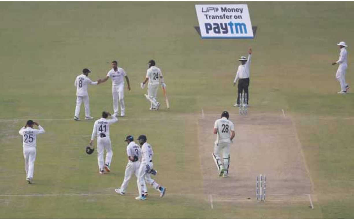
KANPUR

Axar Patel continued his golden run in favourable home conditions, grabbing another five-wicket haul to put India in the driver's seat after New Zealand were bowled out for 296 despite an opening stand of 151 on the third day of the first Test here on Saturday. The left-arm spinner had a couple of dream sessions when he finally found the ideal pace and turn off the surface to completely derail New Zealand's steady first innings. His final figures read 34-6-62-5 as India got a crucial 49-run first innings lead, which increased to 63 at stumps. Ravichandran Ashwin was also on the money