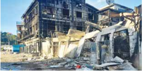
This photo shows aftermath of a looted street in Honiara’s Chinatown, Solomon Islands on Saturday

Australian media reported the bodies were recovered late Friday after riots and protests subsided. No other details were given. Authorities imposed a curfew in the capital Honiara, after a 36-hour lockdown ordered by the embattled Prime Minister Manasseh Sogavare ended Friday.