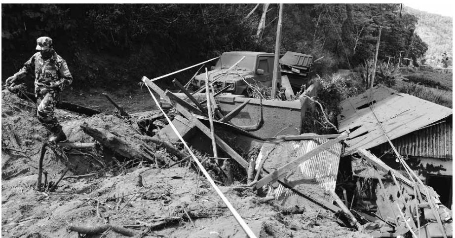
An Indonesian soldier walks past houses damaged by an earthquake-triggered landslide in Bangli, on the island of Bali, Indonesia on Saturday. A few people were killed and another several were injured when a moderately strong earthquake and an aftershock hit the island early on Saturday

Despite the mounting toll, the Kremlin has ruled out a new nationwide lockdown like the one early on in the pandemic that badly hurt the economy, eroding President Vladimir Putin's popularity.