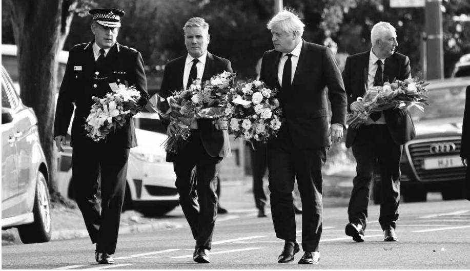
British Prime Minister Boris Johnson and Leader of the Labour Party Keir Starmer, second from left, carry flowers as they arrive at the scene where a member of Parliament was stabbed Friday, in Leigh-on-Sea, Essex, England on Saturday

A 25-year-old British man, believed to be of Somali heritage, was arrested at the scene on suspicion of murder and remains in custody at a police station in Essex, south-east England. Prime Minister Boris Johnson and Opposition Labour leader Sir Keir Starmer laid flowers at the scene of the stabbing, together on Saturday morning.