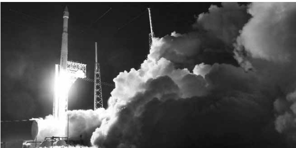
A United Launch Alliance Atlas V rocket carrying the LUCY spacecraft lifts off from Launch Complex 41 at the Cape Canaveral Space Force Station on Saturday

An Atlas V rocket blasted off before dawn, sending Lucy on a roundabout journey spanning nearly 4 billion miles (6.3 billion kilometers). Researchers grew emotional describing the successful launch — lead sci-