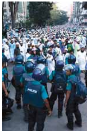
Muslims participate in a protest over an alleged insult to Islam, outside the country's main Baitul Mukarram Mosque in Dhaka on Saturday

The police, meanwhile, said that they have recovered the body of a Hindu devotee from a pond near a temple in south-eastern Begumganj sub-district