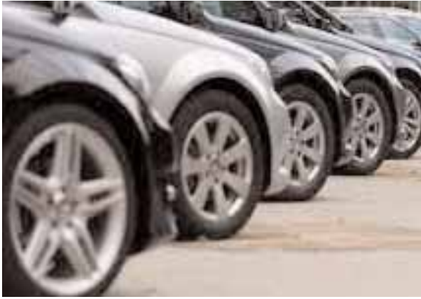
"Over the past 15 months, fuel prices have gone up 35 per cent, impacting overall vehicle running costs...Our channel interactions suggest that customers are increasingly becoming

Considering the fact that 70 per cent of the passenger vehicles market in India is still accounted for by vehicles costing less than Rs 10 lakh, the development augurs well for market leader Maruti Suzuki India Ltd (MSIL), said the report by HSBC Global Research.