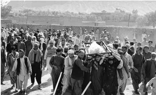
Relatives carry the body of a victim of Friday's suicide attack during a mass funeral in Kandahar on Saturday

"There are so many who have lost body parts, and among those in hospital in serious condition, I don't know how many more numbers will