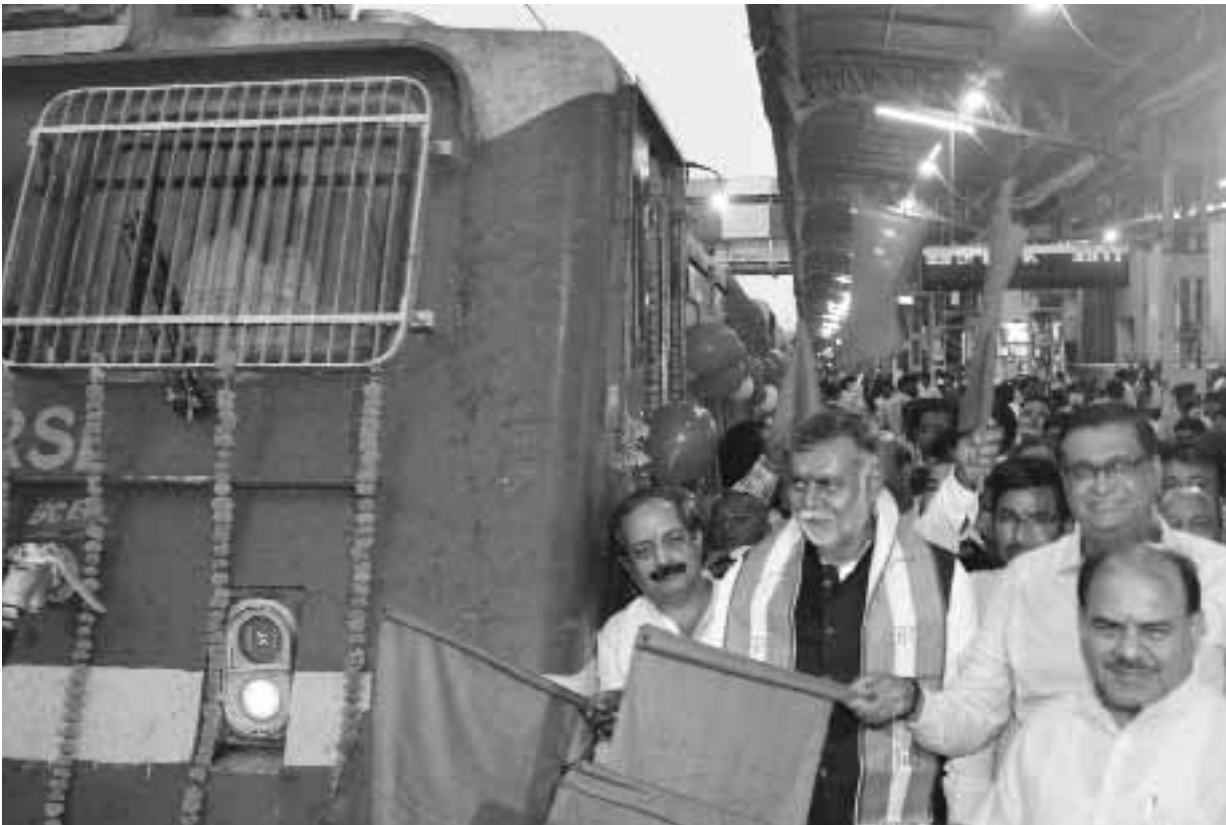
Union Minister of State for Jal Shakti Prahlad Patel flags off Bhopal to Damoh Rajyarani Express special train at railway station in Bhopal on Saturday

stolen and later when he checked it was missing and checked the premises and asked management regarding any kind of deposit of gold chain by any devotee but failed to find his gold chain and lodged complaint with the Talaiya police. The victim in his complaint claimed that the gold chain was worth Rs 70,000. Police claimed that the incident took place when the premises remained heavily crowded due to ongoing Durga festival and victim visited the temple at the time of heavy rush. The victim claimed that he failed to spot the miscreant when the gold chain was stolen. The police have registered a case under section 379 of the IPC and have started further investigation.