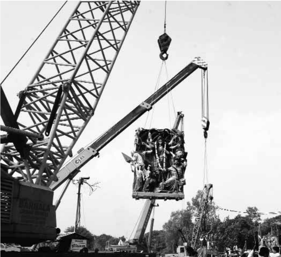
Idols of Goddess Durga lifted by crane for immersion in the Upper Lake at Prempura Ghat to mark the end of Navratri festival in Bhopal on Saturday

Attractive and beautiful Mulberry, Kosa, Silk Sarees, Suits, Khadi Sarees, Khadi Textiles, Woolen Shawl, Ladies and Gents readymade Garments of all types of Khadi Textiles, Home Furnishing, Decorative Materials, Artistic and Decorative Materials of Matikala, Jute.