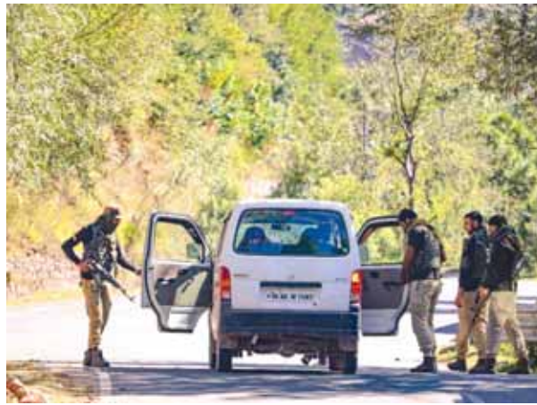
Security personnel stand guard near the site of an encounter with terrorists at the Nar Khas forest area in Poonch on Saturday

In the first incident involving the Army, during the search