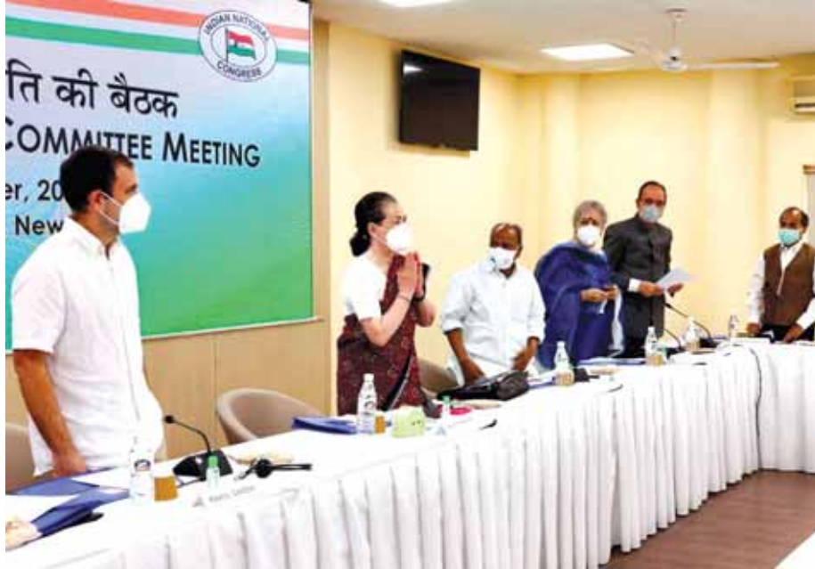
Congress interim president Sonia Gandhi with party leader Rahul Gandhi and others during the Congress Working Committee meeting to discuss the current political situation, upcoming Assembly polls, and organisational elections, at AICC headquarters in New Delhi on Saturday

"I have always appreciated frankness" and "there is no