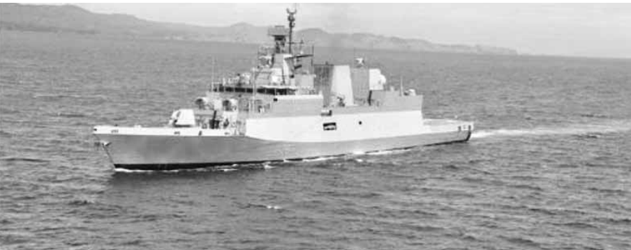
PNS ■ NEW DELHI

The Navy top echelon will next week review the readiness of its fleet in the backdrop of China flexing its maritime muscle in the Indian Ocean and Indo-Pacific. The five-day Commanders' conference will commence here from Monday. Giving details here on Saturday, Navy officials said the conference, held twice a year, serves as a platform for Naval Commanders to discuss important maritime matters at the military-strategic level as well as interact with senior Government officials through an institutionalised forum. Due to the rapidly changing geostrategic situation of the region, the significance and importance of the Conference is manifold. It is an institutionalised platform to deliberate, direct, devise and decide issues of utmost importance, which will shape future course of the Indian Navy.