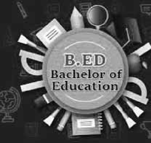
PNS ■ NEW DELHI

In line with the New Education Policy (NEP), the Centre on Wednesday notified a four-year integrated teacher education programme. Now, the BEd course will be integrated and will be of four-year duration.