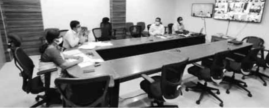
PNS ■ BRAHMAPUR

The Ganjam district administration has issued instructions to all the Panchayat Officers to prepare an error-free voters list latest by October 30, sources said. The administration has also instructed the officials to ensure that the names of those voters who, meanwhile, either have shifted to other places or transferred or died, are carefully deleted from the voters list based on concrete proof or evidence with utmost care and