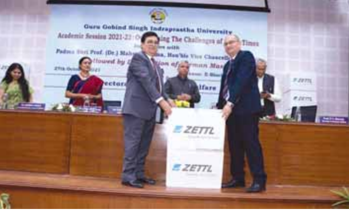
GGISP University distributes about two lakh German Masks to campus schools and around 115 affiliated colleges as a part of precautionary measures to mitigate the risk of Covid-19.