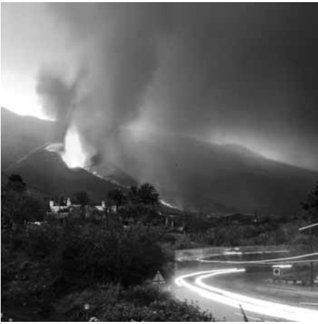
Lava flows from a volcano as it continues to erupt on the Canary island of La Palma, Spain on Wednesday. AP

media watchdog said. More than 40% of the cases recorded by The Afghanistan National Journalists Union were physical beatings and another 40% were verbal threats of violence. AP