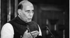
PNS ■ NEW DELHI

With China increasingly asserting itself in the Indo-Pacific and Indian Ocean region, Defence Minister Rajnath Singh on Wednesday said India is determined to protect its maritime interests. At the same time, it supports the maintenance of rule-based maritime systems, he said.