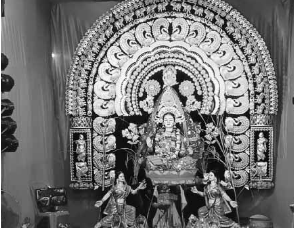
■ DHENKANAL

The famous Laxmipuja of Dhenkanal, which started first from Panja Sahi during the year 1923, has of late grown in terms of size and spread, besides in glitz and glamour. So much so that the Puja is being held in as many as 38 Mandaps by now. The 39th Mandap could not come out this year as the district administration did not permit for the same. Crowd pulling items like Dollas, Zoo, Maut ki Kuen, apart from food stalls and Gramashree Mela, were not allowed this year, due to the Covid restrictions. However, rush of visitors was seen at the makeshift shops on the footpath, violating all norms.