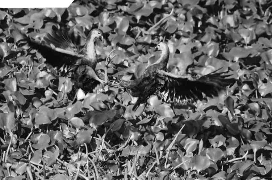
Grey-headed Swamphens fight at a pond in Ghaziabad