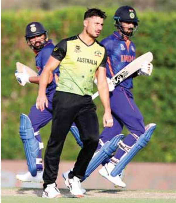
Australia's Marcus Stoinis looks on as India's Rohit Sharma and KL Rahul run between the wickets during the Cricket Twenty20 World Cup warm-up match between India and Australia in Dubai, on Wednesday

Another plus for India was seasoned pacer Bhuvneshwar