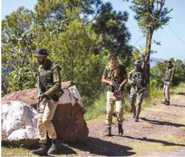
Security forces during an encounter with terrorists at Nar Khas forest area of Poonch district on Wednesday

been eliminated in 11 encounters in the last two weeks. Eleven civilians, including five laborers, also lost their lives during targeted killings.