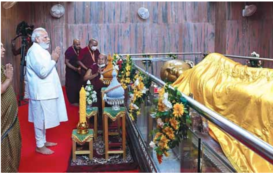
Prime Minister Narendra Modi visits the Mahaparinirvana Temple, on the occasion of the Abhidhamma Day, at Kushinagar in Uttar Pradesh on Wednesday

"You have to remember that your partnership is with this 'mitti' (soil), with Maa Bharti (Mother India). There should not be any safe havens anywhere in the world for those who betray the country or its people," Modi said in his address.