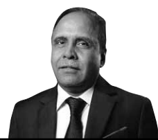
SUBHASH C PANDEY

For import-dependent India, it is costlier to import longer haul Australian coal than shorter haul Indonesian coal which is getting diverted to China