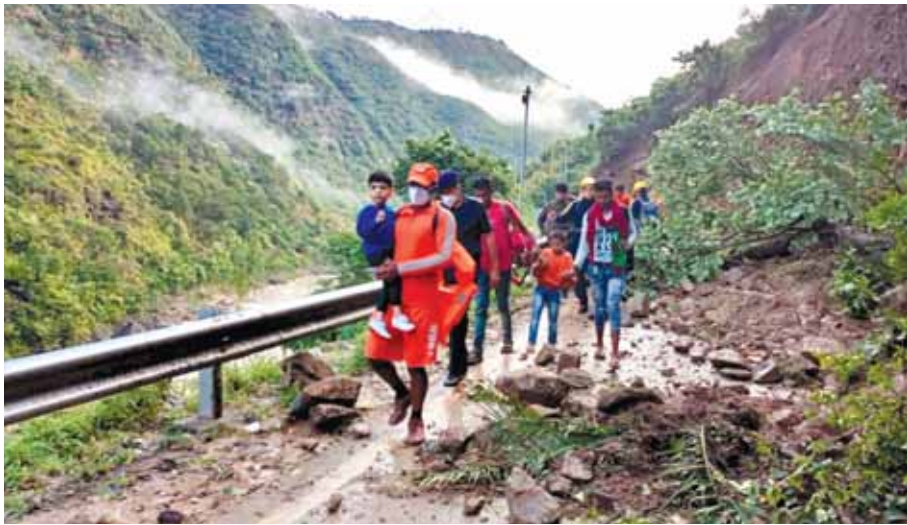
Stranded tourists being evacuated by the NDRF from the landslide affected area following heavy rain in Nainital

After its late withdrawal from northwest India, the southwest monsoon remains active over some parts of the country. According to the India Meteorological Department (IMD), the southwest monsoon will withdraw completely from