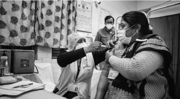
NEW DELHI