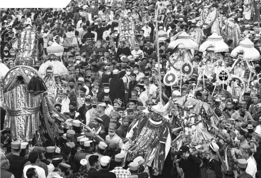
Devotees take part in the International Dussehra festival, in Kullu