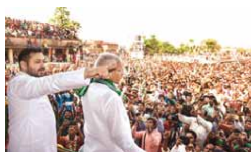
Rashtriya Janata Dal chief Lalu Prasad, along with son and party leader Tejashwi Yadav, addresses a by-election campaign rally at Kusheshwar Asthan constituency in Darbhanga on Wednesday

"I spoke to Sonia. She asked me about my well-being