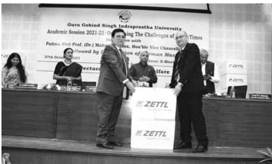
GGSIU University distributes about two lakh German Masks to campus schools and around 115 affiliated colleges as a part of precautionary measures to mitigate the risk of Covid-19.