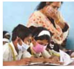
designated spots in Delhi amid strict Covid protocols.

Meanwhile, the Delhi Disaster Management Authority (DDMA) on Wednesday allowed devotees to perform Chhath Puja at