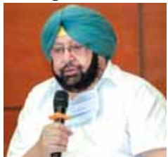
tions, has resulted in a fresh bout of words between Capt Amarinder and his bete noire

His decision, adding a new dimension to Punjab politics just about three months before the 2022 State Assembly elec-