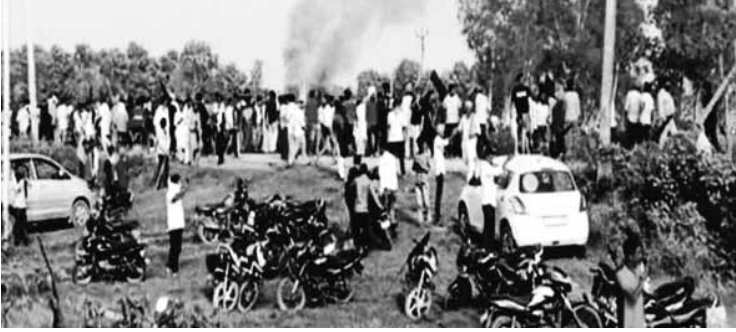
■ LUCKNOW

To facilitate the eyewitnesses to come forward and record their statements, the Special Investigative Team (SIT) formed to probe the Lakhimpur Kheri violence, on Wednesday, released the contact numbers of its members.