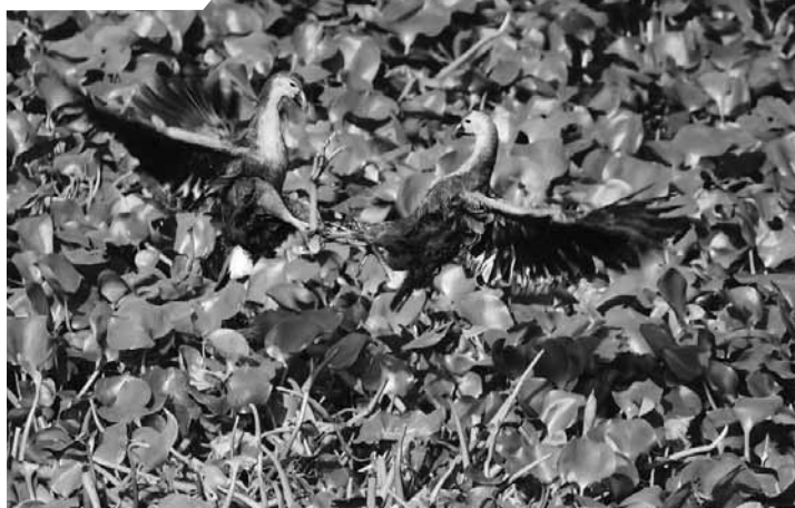
Grey-headed Swamphens fight at a pond in Ghaziabad