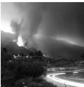
Lava flows from a volcano as it continues to erupt on the Canary island of La Palma, Spain on Wednesday

निदेशालय, प्राविधिक शिक्षा, उत्तराखण्ड के अधीन विभिन्न राजकीय पॉलीटेक्निक संस्थानों में कम्प्यूटर के क्रय हेतु ई० निविदायें आमंत्रित की जाती हैं। ई० निविदा दिनांक 28/10/2021 से उत्तराखण्ड शासन के ई० निविदा पोर्टल www.uktenders.gov.in से डाउनलोड की जा सकती है। ई० निविदा जमा करने की अंतिम तिथि 11/11/2021 है। विस्तृत जानकारी उत्तराखण्ड शासन की ई० निविदा पोर्टल www.uktenders.gov.in से प्राप्त की जा सकती है। निदेशक प्राविधिक शिक्षा, उत्तराखण्ड