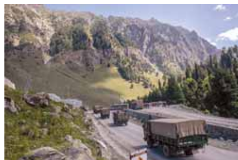
In this file photo, an Indian Army convoy moves on the Srinagar-Ladakh highway at Gagangar, northeast of Srinagar

"We have noted that China has passed a new land boundary law on October 23, 2021. The law states among other things that China abides by