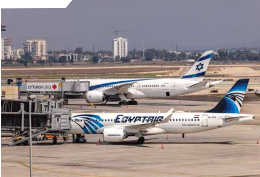
An EgyptAir aircraft at the Ben Gurion International Airport in Lod, Israel