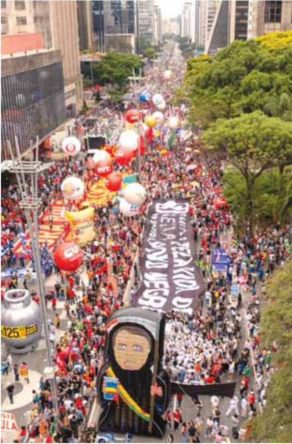
Demonstrators rally alongside a large inflatable doll depicting Brazilian President Jair Bolsonaro as the Grim Reaper, during a protest against him, calling for his impeachment over his Government's handling of the pandemic and accusations of corruption in the purchases of Covid-19 vaccines in Sao Paulo on Saturday

"It is very painful to see that health and education are being destroyed, and there are many starving people in the