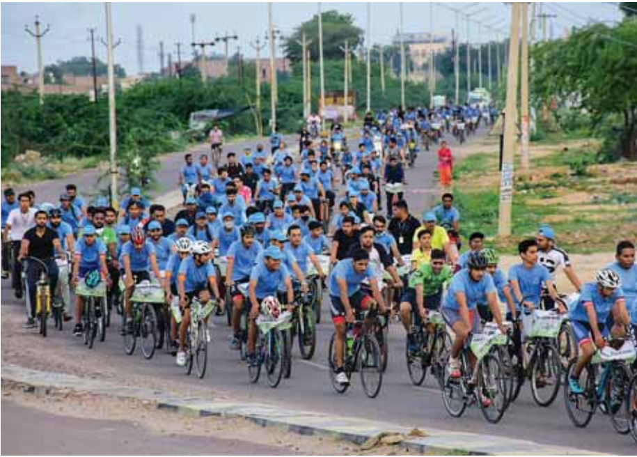
People participate in a cycling event of Green and Clean India to celebrate 'Azadi Ka Amrit Mahotsav', in Bikaner on Sunday

Last year, the Covid-19 pandemic led to a global shut down of schools in more than 188 countries, leaving 1.6 billion children -- 75 percent of enrolled students -- out of school.