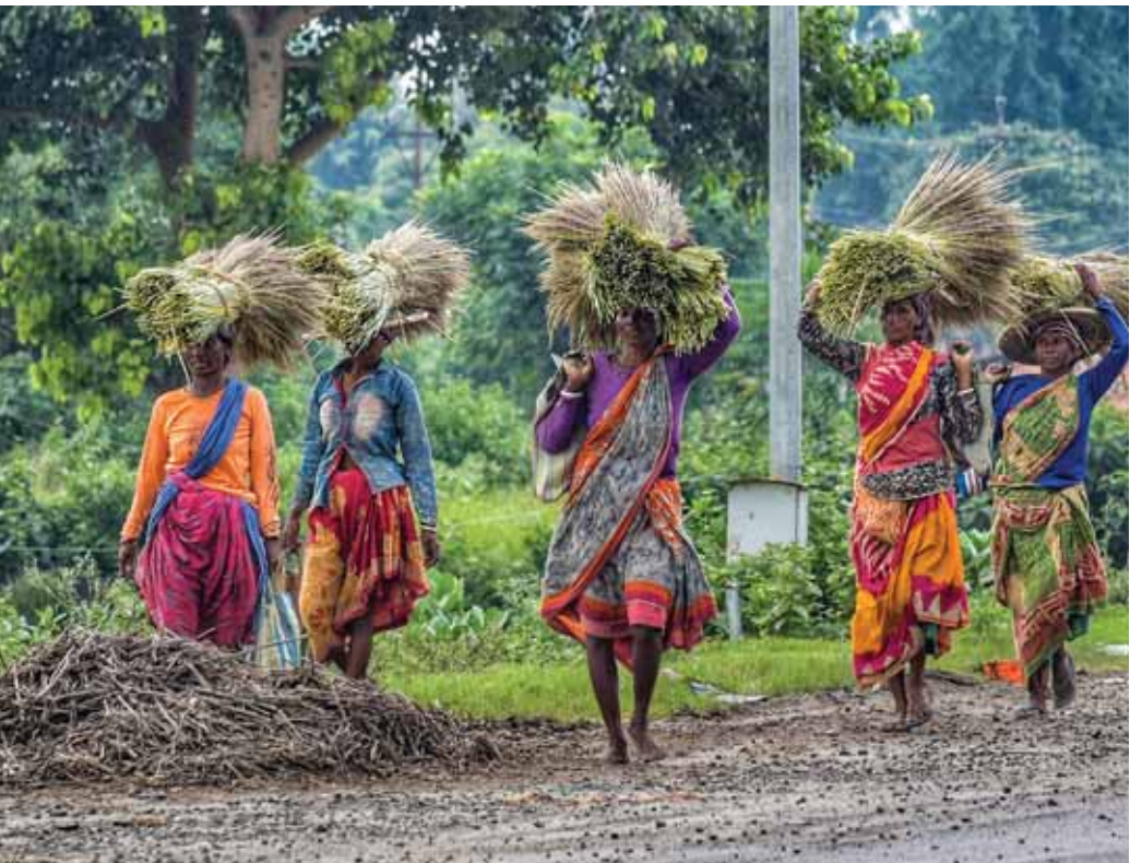
Women labourers return home with grass to make broomsticks at Krishnanagar in Nadia district on Sunday