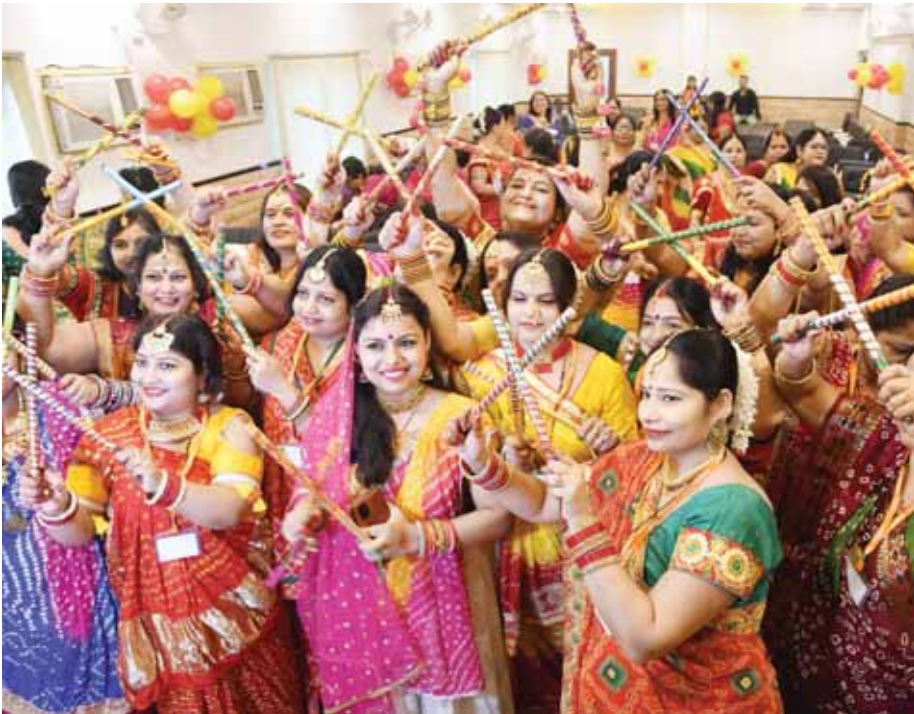
Women participate in Dandiya competition organised by Maitreyee-Pahachaan Mithila Ki ahead of Navratri festival, in Patna, on Sunday