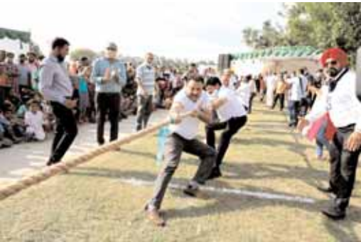
Officers and councillors of the Municipal Corporation of Chandigarh engaging in a competitive round of tug of war