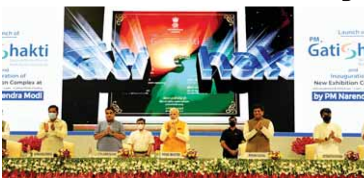
Prime Minister Narendra Modi launches PM Gati Shakti, at Pragati Maidan in New Delhi on Wednesday

Modi said taxpayers' money in the past was "insulted" through a lethargic approach to development work, with departments working in silos and