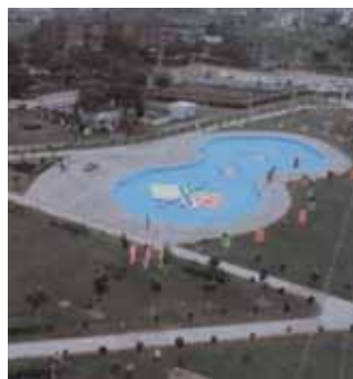
An improvised water park for children at New Indira Colony during the celebrations