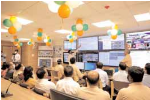
Demonstration of the Integrated Command and Control Center (ICCC)