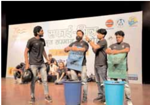
Safaimitra Amrit Samman Samaroh on Gandhi Jayanti