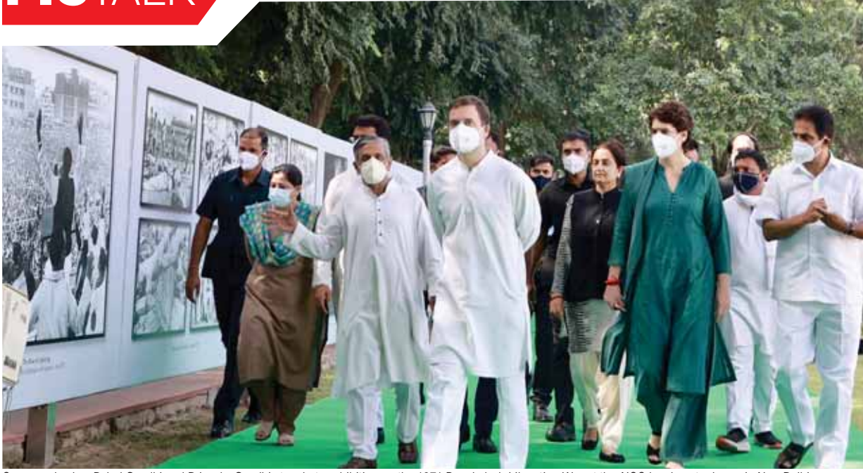
Congress leaders Rahul Gandhi and Priyanka Gandhi at a photo exhibition on the 1971 Bangladesh Liberation War, at the AICC headquarter lawns in New Delhi on Wednesday