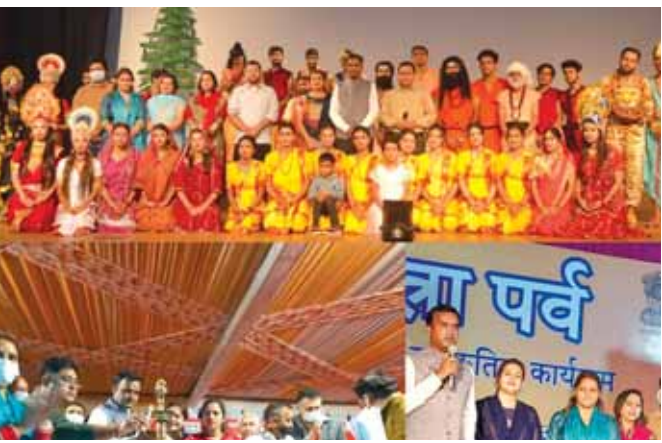
Navratra festival at Katra

The Directorate of Tourism, Jammu, in collaboration with the district administration of Reasi and Shri Mata Vaishno Devi Shrine Board Katra celebrated the Navratra Festival for 2021 at Katra. The main highlights of the nine-day long celebration was the Mata Ki Kahaani stage show by Natrang at Katra's Spiritual Growth Centre everyday at 4 pm, evening cultural performances at Higher Secondary School, Katra by the artists from Odisha, Gujarat, Rajasthan, Himachal Pradesh and local artistes of Jammu region, apart from the Bhagwat Katha at Shri Raghunath Ji Temple, Katra. Another notable event was the Mega Devotional Song performance by renowned artists of Jammu at Yog Ashram Ground Katra on October 12,