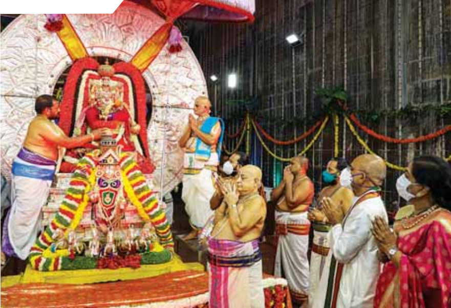
Devotees at the Sri Govindaraja Swamy temple, in Tirupati