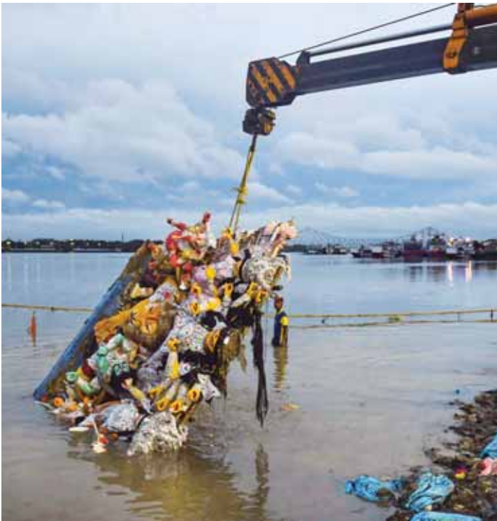
A crane being used to lift an idol of Goddess Durga after immersion to prevent pollution in River Ganga, in Kolkata on Sunday

“With daily hikes, the government has made the diesel prices cross ₹ 100. Under the BJP rule, workers and farmers are reeling under the burden of rising prices, while only Modi's friends are getting richer,” she said in a tweet in Hindi. PTI