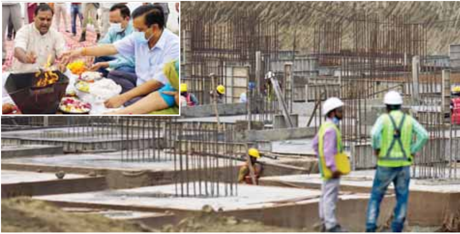
Delhi Chief Minister Arvind Kejriwal lays the foundation of a new Government hospital at Shalimar Bagh in New Delhi on Sunday

Through HIMS, the government will have all medical related data of citizens and people will be able to book online appointments with doctors at government hospitals. It will end queues for people at hospitals.