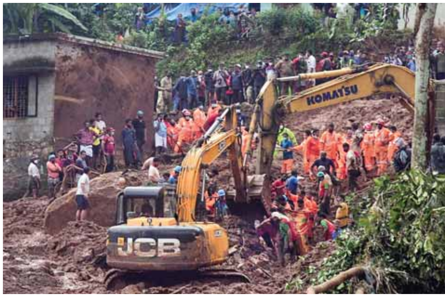
A NDRF team during a rescue operation after a landslide due to heavy rain, at Poovanchi hill in Kottayam on Sunday