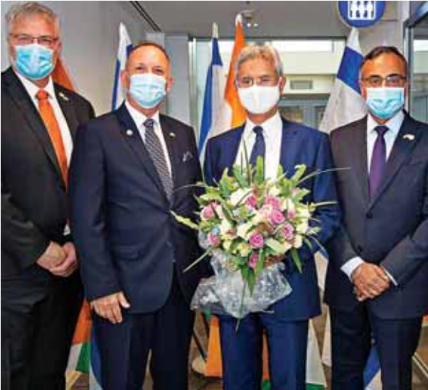
Union External Affairs Minister S Jaishankar is greeted by the officials on his arrival in Israel