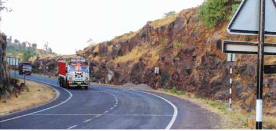
IITs first of its kind smart speed warning system to avoid road crashes being tested at NH-61 between Mumbai and Malshej Ghat

"Our studies revealed the safe speed for a vehicle can significantly vary with changes in road geometry like on sharp or blind curves or hairpin bends. Therefore, there is a need to develop a smart speed warning system incorporating a dynamic and adaptable speed threshold based on upcoming road infrastructure and vehicle location. On approaching curves along a roadway, including blind curves or hairpin bends, vehicles equipped with such a system will warn drivers