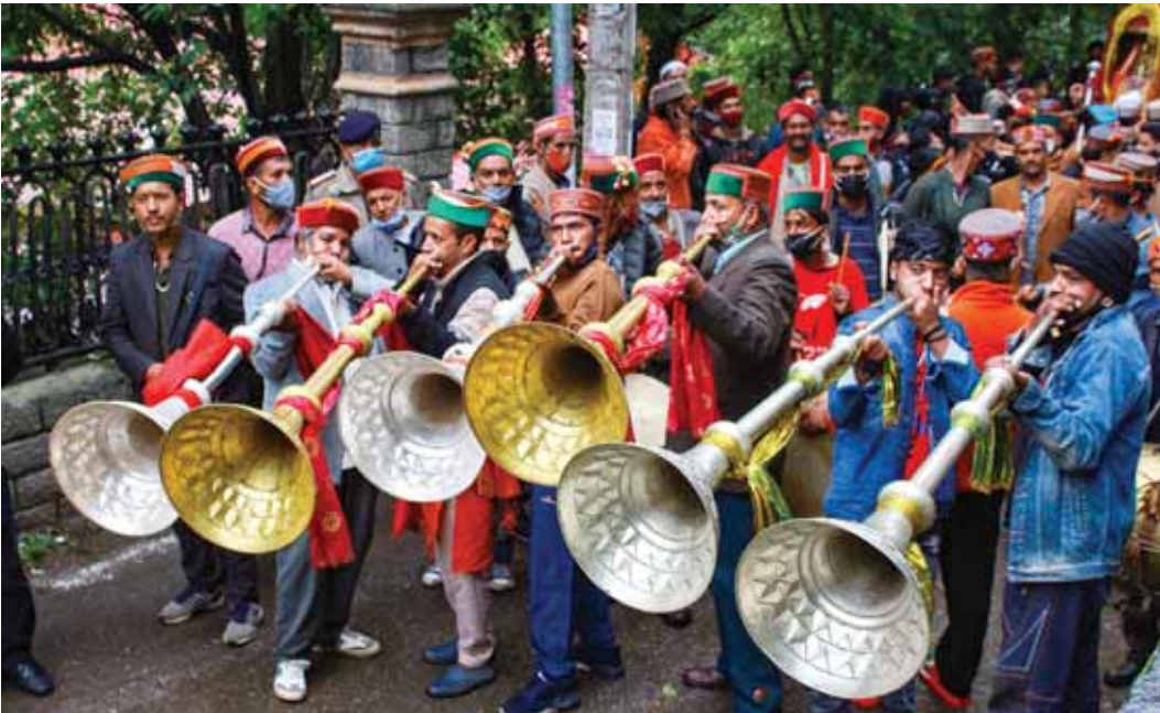
People play instruments during Kullu Dussehra, in Kullu on Sunday