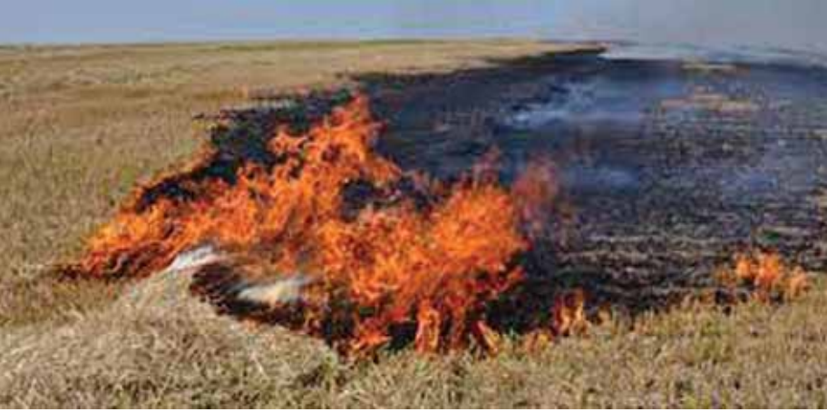
PTI ■ NEW DELHI

As Delhi's air quality plunged into the "very poor" category on Sunday morning, Chief Minister Arvind Kejriwal said that increase in pollution was due to stubble burning in neighbouring states as governments were "doing nothing" to help farmers to stop it.