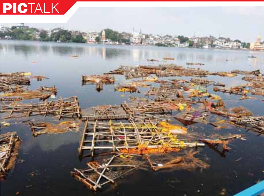
Debris collects on Lower Lake after the end of Navratri, in Bhopal