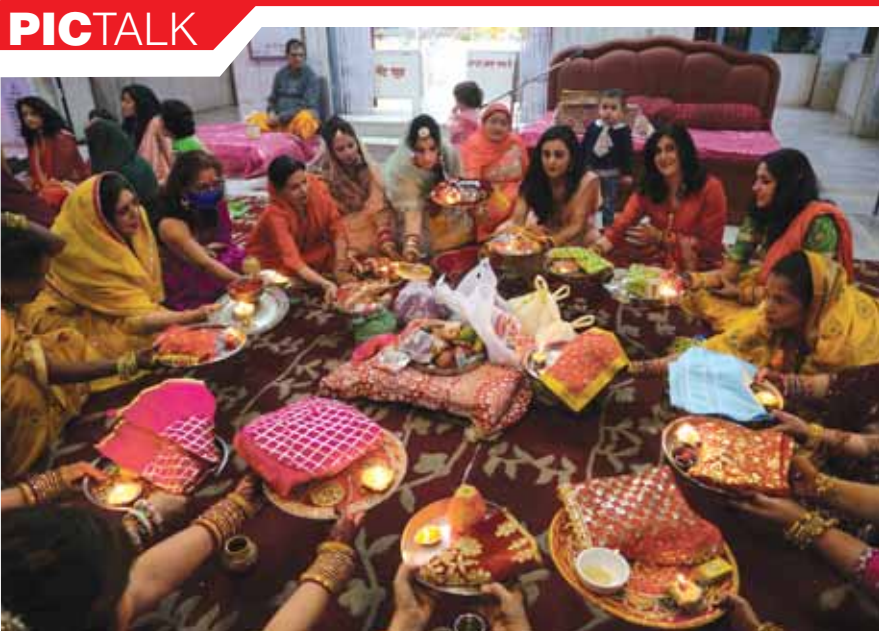
Women perform rituals to celebrate Karva Chauth, in Jammu

The formation of the next Government will reveal which region has an edge and that may determine future State politics. Like he announced in the Parliament, Shah also said in Srinagar that the return of statehood would be taken up thereafter. The Government is of the view that the Kashmiri youth should be persuaded to join the national mainstream as the region returns to a new normal. Nearly 70 per cent of the State's population is under the age of 35. Shah said he was in Srinagar to make friends with the Kashmiri youth, assuring them of all help for education, employment and development. It is not yet known how these youth have reacted to the Home Minister's persuasion. That is the key. They are being asked to forget all of the past and embrace a "new era in Kashmir". The "era" was brought in on the back of decisions like the internet ban and curfew that were necessary to foil a plot to provoke Kashmiris, as the Home Minister explained. Tourism is flourishing and there is no curfew now, he said, even as Srinagar was enveloped in one of the toughest security blankets with the use of drone cameras, detention of hundreds of people, including youth, and seizure of hundreds of motorcycles in preparation for the Minister's visit. Shah amplified his aspirations in earnest. It is up to the aspirations of the youth to match his.