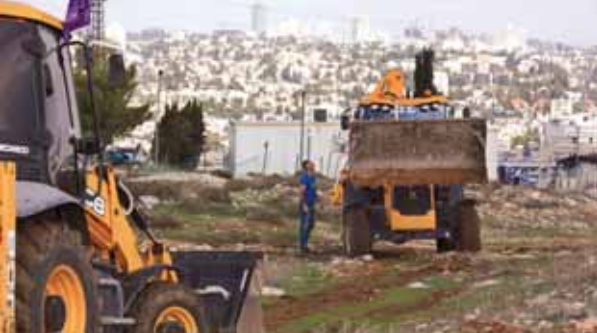
In this file photo, workers take a break before European Union officials visit the construction site for the Givat Hamatos Israeli settlement, in Jerusalem

On Friday, U.S. State Department spokesman Ned Price said the U.S. was "concerned" about the housing plans. He called on Israel and the Palestinians to "refrain