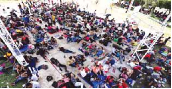
A caravan of migrants, mostly from Central America, heading north, stop to rest in the Alvaro Obregon community, Tapachula municipality, Mexico on Saturday