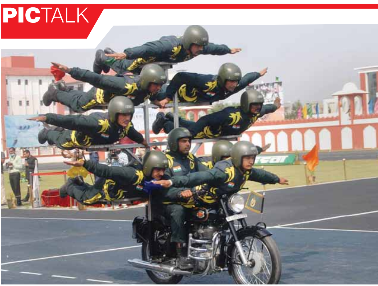
ITBP personnel perform stunts during the 60th Raising Day of Indo Tibetan Border Police in Greater Noida on Sunday