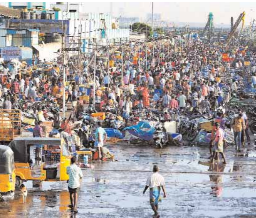
Fishermen and buyers busy at Kasimedu fish market in Chennai on Sunday

"Punjab must come back to its real issues that concern every Punjabi and our future generations. How will we counter the financial emergency that stares upon us? I will stick to the real issues and not let them take a backseat!" Sidhu tweeted earlier in the day. PTI