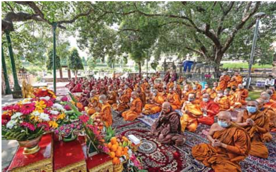
Buddhist monks offer prayers under the sacred Bodhi tree in Bodhi Gaya on Sunday