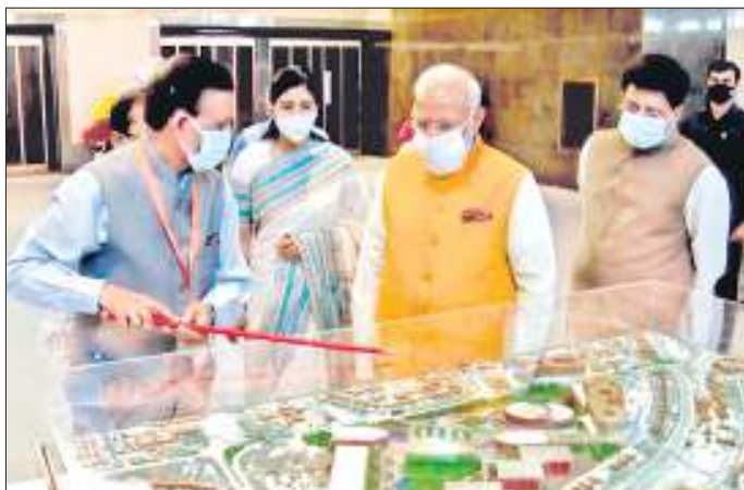
Prime Minister Narendra Modi reviews a model of an infrastructure project at the unveiling of the PM Gati Shakti national master plan in New Delhi on Wednesday.

PM Modi said taxpayers' money in the past was 'insulted' through a lethargic approach to development work, with departments working in silos and there was no coordination on projects.