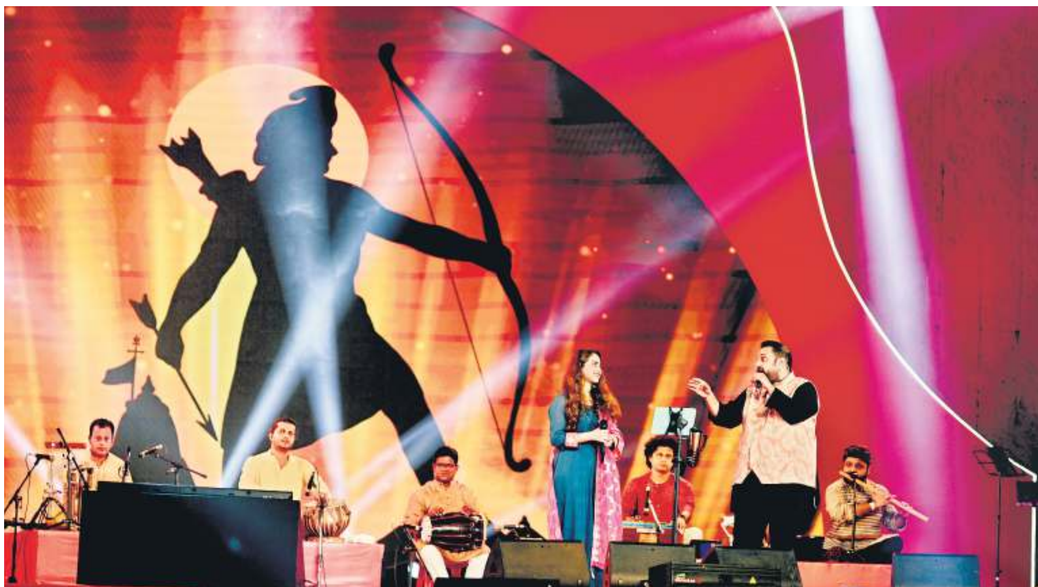
On Ram's trail