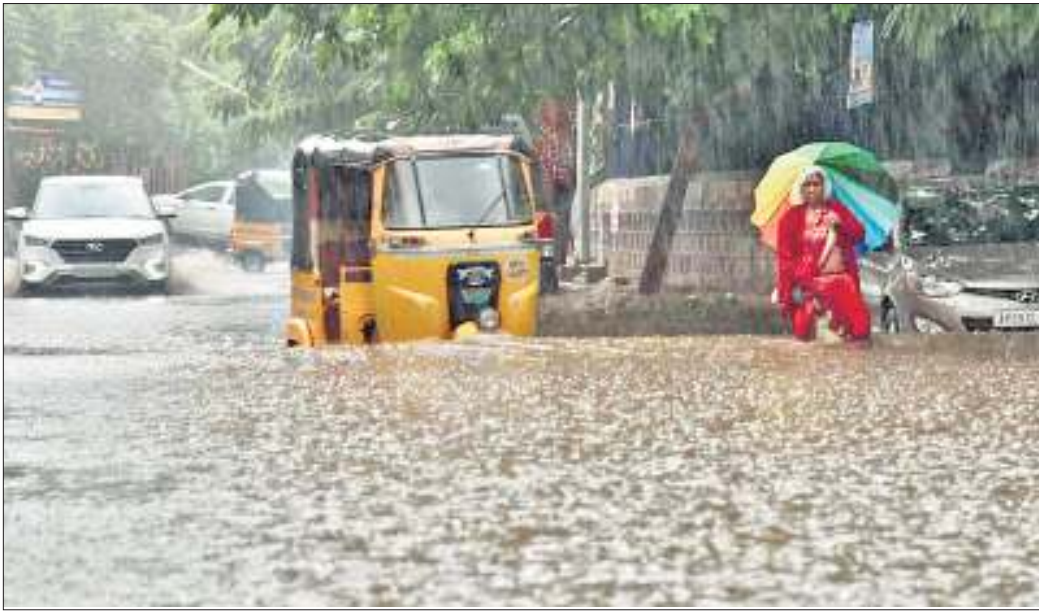
Vehicles try to plough through knee-deep water after a spell of heavy rain lashed Hyderabad on Saturday.

Also, it said heavy rain is very likely to occur at isolated places in Mancherla, Nizamabad, Jayashankar Bhupalpally and other districts during the same period.