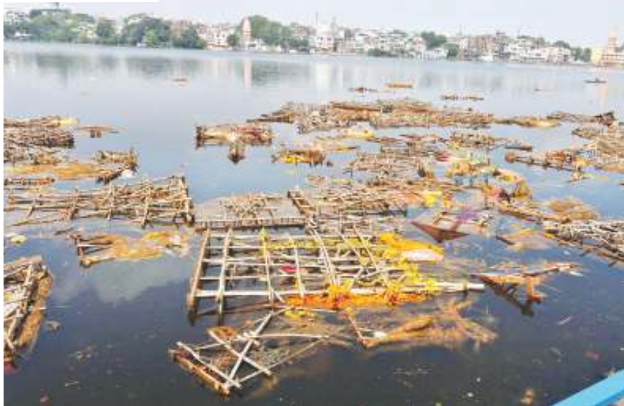
Debris collects on Lower Lake after the end of Navratri, in Bhopal