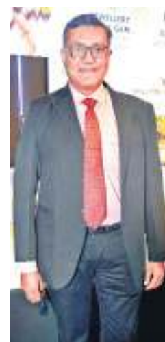
● Yogesh Mudras