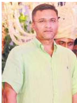
● Akbaruddin Owaisi