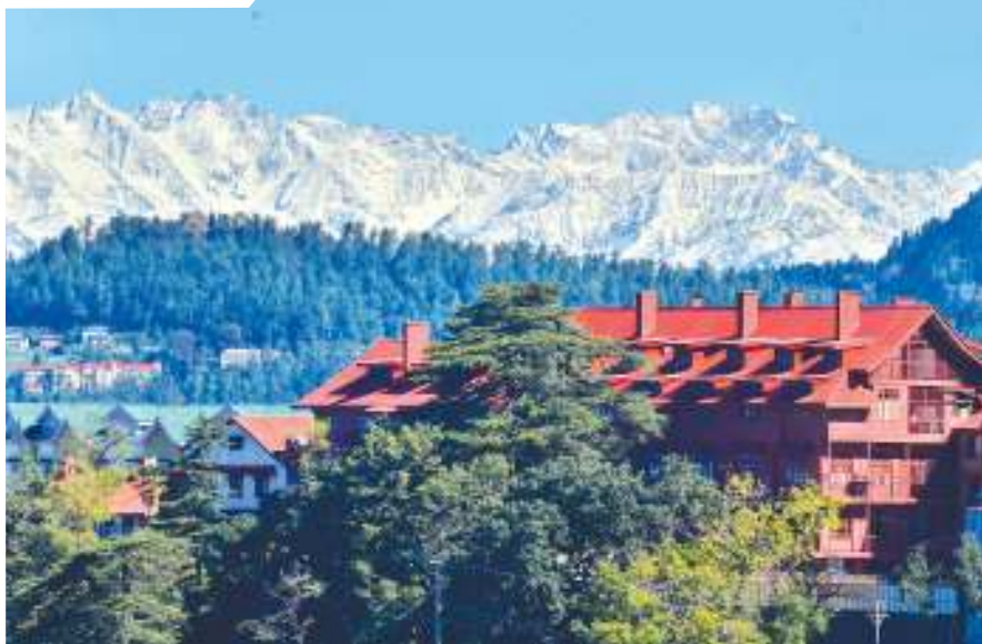
Snow-covered mountains after fresh snowfall, in Shimla