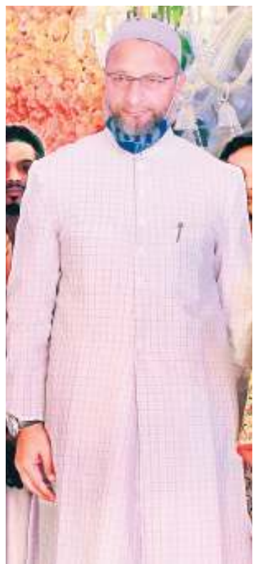
● Asaduddin Owaisi