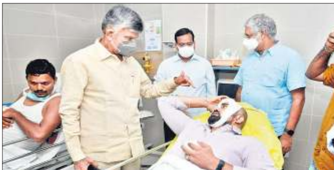
TDP president N Chandrababu Naidu visiting those injured in the attacks