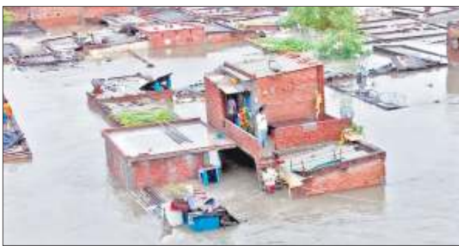
A view of the marooned houses in Uttarakhand

"The number of casualties in Kumaon region alone has crossed 40," DIG Nilesh Anand Bhanu told PTI. The hill state had reported five deaths on Monday.