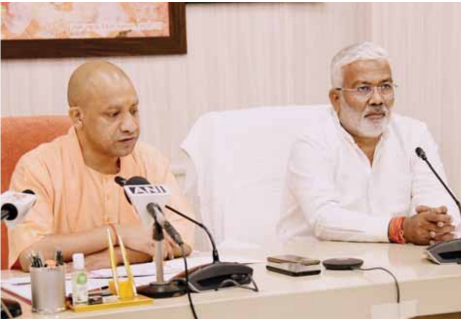
Chief Minister Yogi Adityanath virtually launching 144 projects in Bahraich

While launching around 87 development projects worth Rs 390.45 crore in Shravasti, the chief minister said that Gautam Buddha had spent a maximum holy period of Chaturmas (time for devotion, penance, bathing in holy rivers, performing sacrifices,