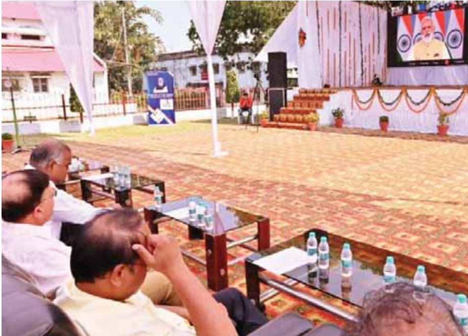
Prime Minister, Narendra Modi virtually dedicating seven defence companies to the nation on the occasion of Vijay Dashmi