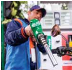
₹100-a-litre mark in Bengaluru, Daman and Silvassa.

With this rise, petrol is now at ₹100-a-litre mark or more in all State capitals while diesel has touched the 100-mark in over a dozen States. Diesel crossed the