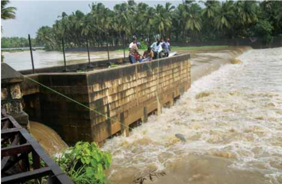
Fishermen fishing from the overflowing Kumari dam following heavy rain in Kanyakumari district on Sunday