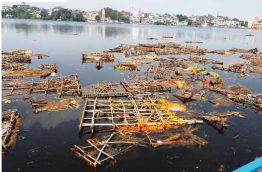
Debris collects on Lower Lake after the end of Navratri, in Bhopal