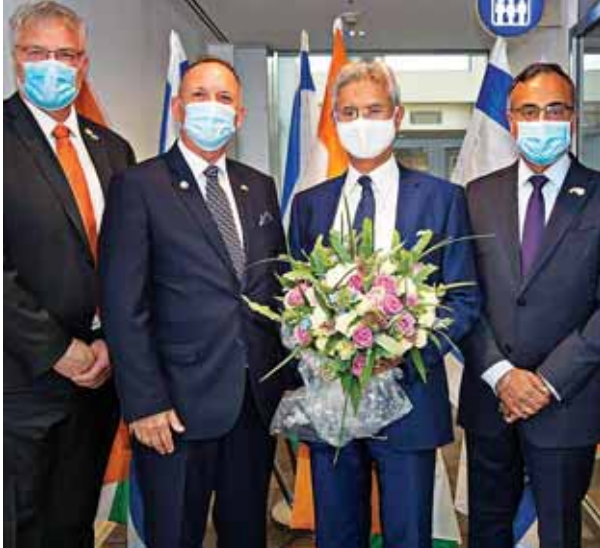
Union External Affairs Minister S Jaishankar is greeted by the officials on his arrival in Israel