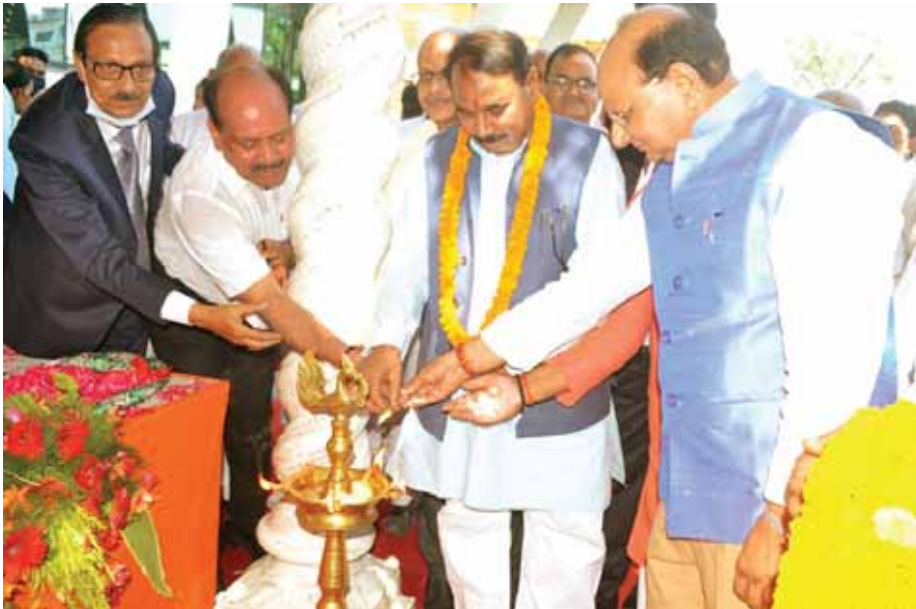
Union Minister BPS Verma inaugurating Khadi Exhibition in Varanasi on Sunday.