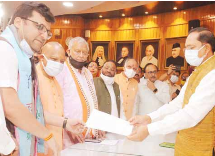
MLA Nitin Agarwal filing the nomination paper in the presence of CM Yogi Adityanath

After the polling, Uttar Pradesh will get its first deputy speaker of the legislative assembly.