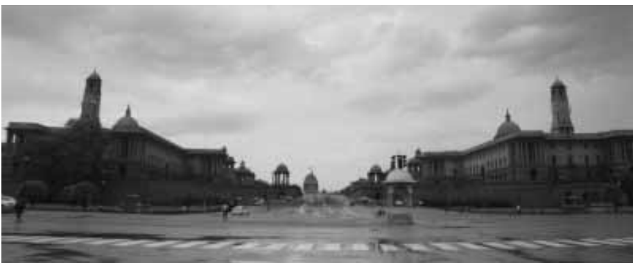
IANs ■ NEW DELHI

The National Capital Region (NCR) woke up to a clear sky on Saturday with the Indian Meteorological Department (IMD) forecast- ing light rain or thunder- showers towards the evening or night for the next three days.