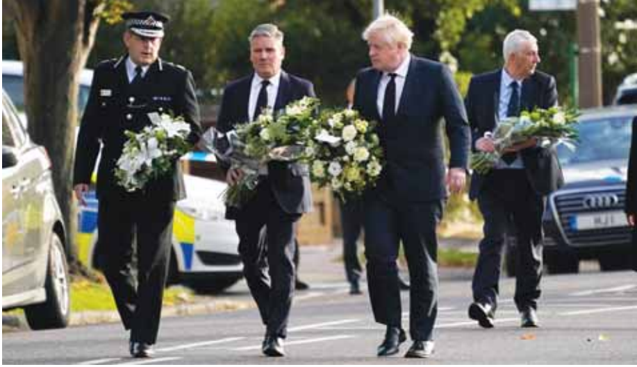
British Prime Minister Boris Johnson and Leader of the Labour Party Keir Starmer, second from left, carry flowers as they arrive at the scene where a member of Parliament was stabbed Friday, in Leigh-on-Sea, Essex, England on Saturday

A 25-year-old British man, believed to be of Somali heritage, was arrested at the scene on suspicion of murder and remains in custody at a police station in Essex, south-east England. Prime Minister Boris Johnson and Opposition Labour leader Sir Keir Starmer laid flowers at the scene of the stabbing, together on Saturday morning.