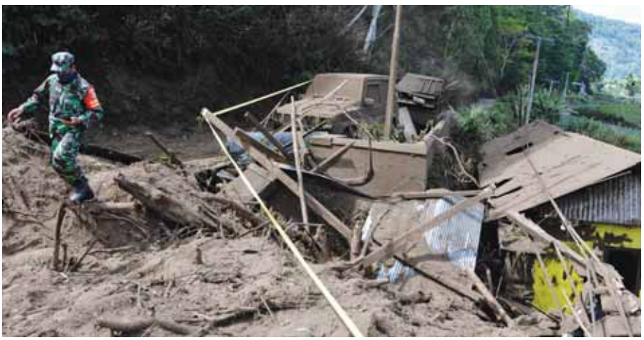
An Indonesian soldier walks past houses damaged by an earthquake-triggered landslide in Bangli, on the island of Bali, Indonesia on Saturday. A few people were killed and another several were injured when a moderately strong earthquake and an aftershock hit the island early on Saturday

Despite the mounting toll, the Kremlin has ruled out a new nationwide lockdown like the one early on in the pandemic that badly hurt the economy, eroding President Vladimir Putin's popularity.