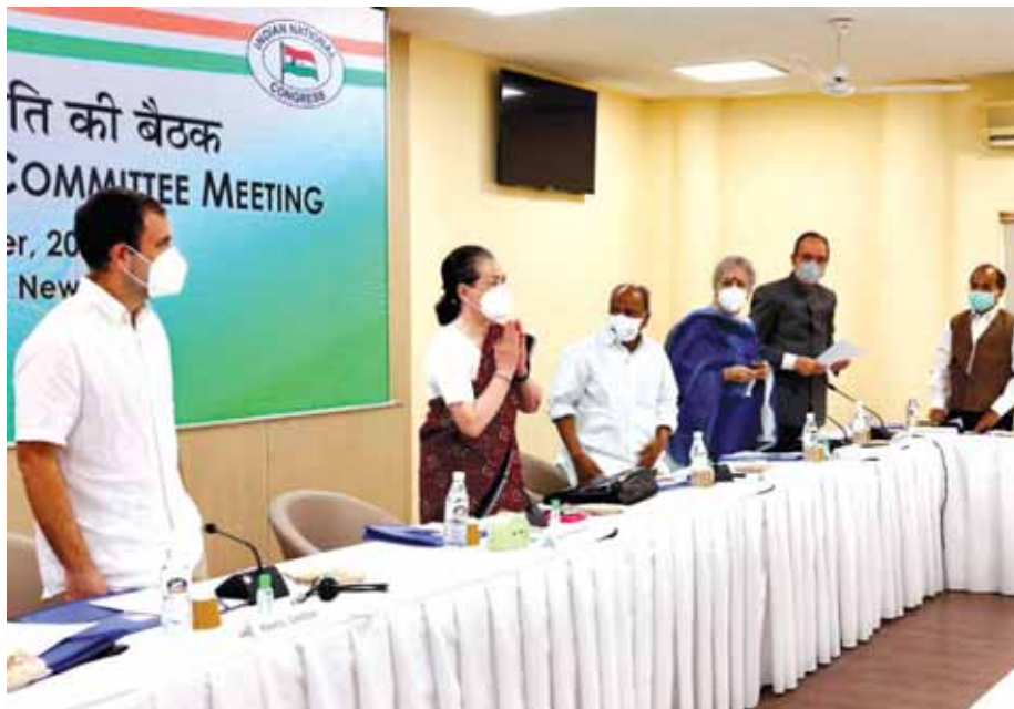
Congress interim president Sonia Gandhi with party leader Rahul Gandhi and others during the Congress Working Committee meeting to discuss the current political situation, upcoming Assembly polls, and organisational elections, at AICC headquarters in New Delhi on Saturday

"I have always appreciated frankness" and "there is no need to speak to me through