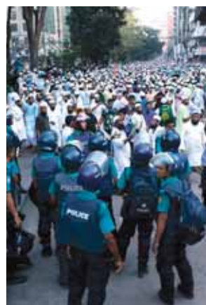
Muslims participate in a protest over an alleged insult to Islam, outside the country's main Baitul Mukarram Mosque in Dhaka on Saturday

The elite anti-crime Rapid Action Battalion said it expects to arrest some of the key perpetrators of the sporadic violence which took place in the past three days.