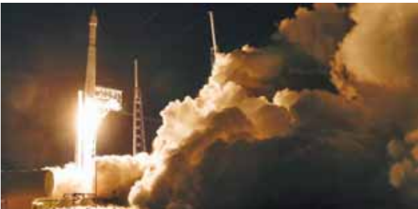
A United Launch Alliance Atlas V rocket carrying the LUCY spacecraft lifts off from Launch Complex 41 at the Cape Canaveral Space Force Station on Saturday

An Atlas V rocket blasted off before dawn, sending Lucy on a roundabout journey spanning nearly 4 billion miles (6.3 billion kilometers). Researchers grew emotional describing the successful launch — lead sci-