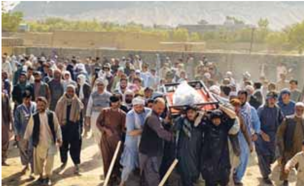
Relatives carry the body of a victim of Friday's suicide attack during a mass funeral in Kandahar on Saturday

"There are so many who have lost body parts, and among those in hospital in serious condition, I don't know how many more numbers will