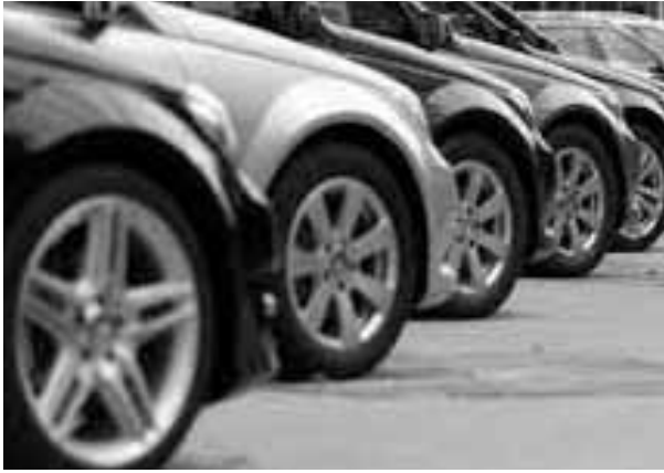
"Over the past 15 months, fuel prices have gone up 35 per cent, impacting overall vehicle running costs...Our channel interactions suggest that customers are increasingly becoming

Considering the fact that 70 per cent of the passenger vehicles market in India is still accounted for by vehicles costing less than Rs 10 lakh, the development augurs well for market leader Maruti Suzuki India Ltd (MSIL), said the report by HSBC Global Research.