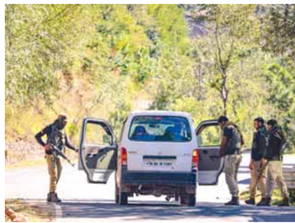
Security personnel stand guard near the site of an encounter with terrorists at the Nar Khas forest area in Poonch on Saturday

In the first incident involving the Army, during the search