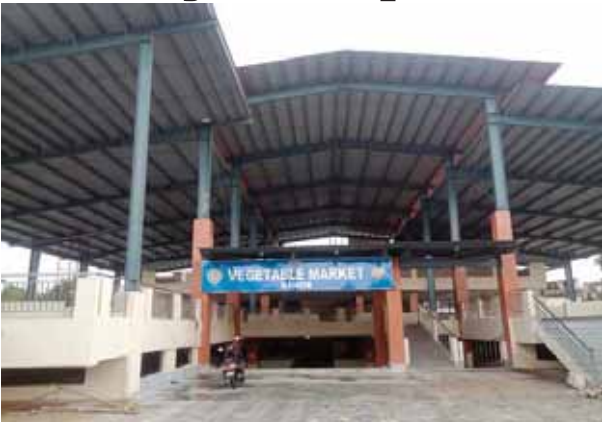
Vegetable market at Naga Baba Khatal in Ranchi on Sunday

A food court has been built on the roof of the market. The corporation has arranged for seven different kitchens here. Meaning, the city dwellers