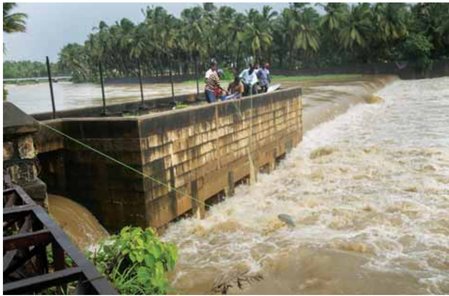
Fishermen fishing from the overflowing Kumari dam following heavy rain in Kanyakumari district on Sunday