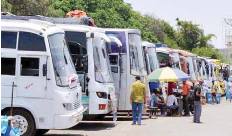
Bus parked due to Jharkhand bandh called by CPI (Maoists) over the Lakhimpur Kheri incident at Birsa Munda bus stand in Ranchi on Sunday

While the political blame game is still going on, the Bihar-Jharkhand-North Chhatisgarh and Uttar Pradesh Simant Regional Committee of