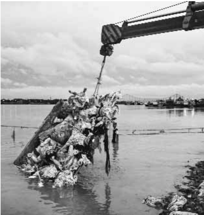
A crane being used to lift an idol of Goddess Durga after immersion to prevent pollution in River Ganga, in Kolkata on Sunday PTI

and diesel rates to record highs across the country. The price of petrol in Delhi rose to its highest-ever level of ₹ 105.84 a litre and ₹ 111.77 per litre in Mumbai, according to a price notification of state-owned fuel retailers. In Mumbai, diesel now comes for ₹ 102.52 a litre; while in Delhi, it costs ₹ 94.57. Congress general secretary Priyanka Gandhi Vadra also attacked the Government over rising prices, saying the BJP has hiked NPK (fertiliser) price by ₹ 275 and NP (fertiliser) price by ₹ 20. "With daily hikes, the government has made the diesel prices cross ₹ 100. Under the BJP rule, workers and farmers are reeling under the burden of rising prices, while only Modi's friends are getting richer," she said in a tweet in Hindi. PTI