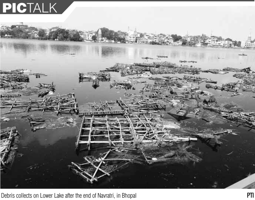
Debris collects on Lower Lake after the end of Navratri, in Bhopal