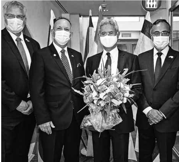
Union External Affairs Minister S Jaishankar is greeted by the officials on his arrival in Israel

Captain Aman Singh Bahadur and Dafadar Jor Singh were awarded the Indian Order of Merit (IOM) and Captain Anop Singh and Second Lieutenant Sagat Singh were awarded the Military Cross (MC) as recognition for their bravery in this battle.