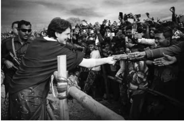
Gandhi had fought for justice.

Punia said earlier also — be it Sonbhadra, Unnao or Hathras incidents — Priyanka