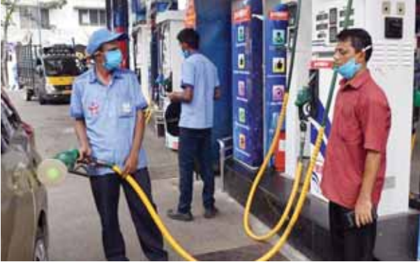
Petrol pump workers at a petrol pump in Ranchi

"Prices ranging from vegetables to food grains are increasing due to the increase in the cost of freight. At the same time, even after increasing the cost of transportation, it is becoming impossible for the transporters to gain profits. This is the reason why the transporters of Ranchi are selling their trucks. With the rapid increase in the price of petroleum products, the freight charges are not increasing in accordance with it," said Singh.