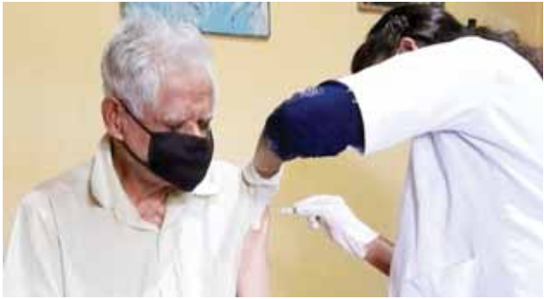
A medic administers COVID-19 vaccine dose to an elderly by the mobile vaccination team, in Ranchi on Sunday

Ranchi vaccinated more than 11,000 residents on the day, the highest among the 24 districts in Jharkhand, while about 9000 residents were inoculated in Dhanbad and about 7000 got vaccinated in East Singhbhum, highlighted NHM data. Meanwhile, the state on Sunday reported at least seven fresh Covid cases, all in Ranchi, against eight Covid recoveries, a bulletin from NHM stated. While the active caseload dropped in the state, the count of active Covid cases in Ranchi rose to 69 as the district reported zero Covid recoveries on the day. At least four Covid recoveries against zero fresh cases of infection brought the active caseload down to 23 in East Singhbhum, while three recoveries against zero cases brought the active caseload in Khunti to two. Deoghar reported one Covid recovery on the day