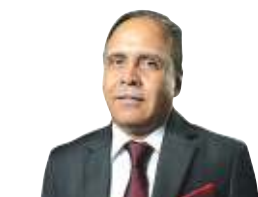
SUBHASH C PANDEY

For import-dependent India, it is costlier to import longer haul Australian coal than shorter haul Indonesian coal which is getting diverted to China