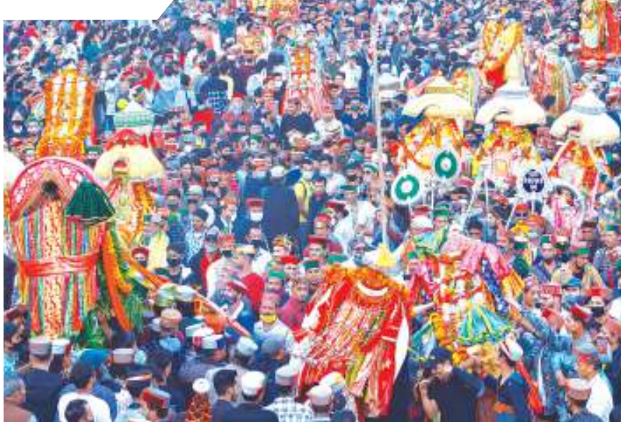
Devotees take part in the International Dussehra festival, in Kullu