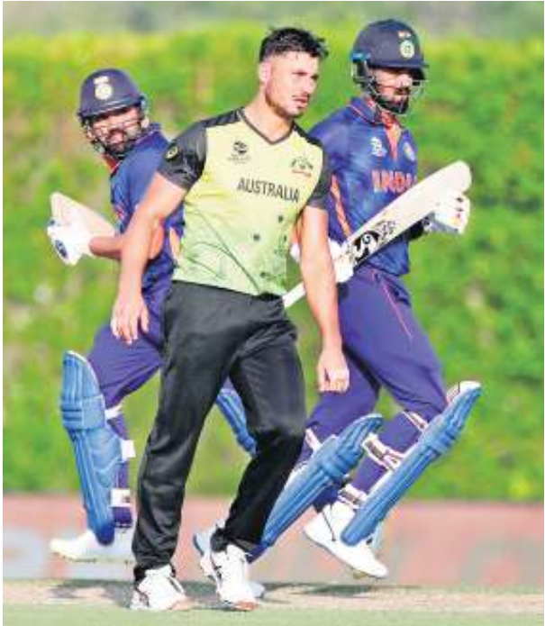
Australia's Marcus Stoinis looks on as India's Rohit Sharma and KL Rahul run between the wickets during the Cricket Twenty20 World Cup warm-up match between India and Australia in Dubai, on Wednesday

Another plus for India was seasoned pacer Bhuvneshwar