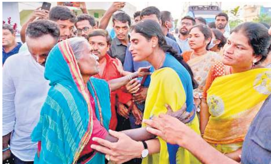
YSR Telangana Party founder-president YS Sharmila interacts with an elderly woman soon after launching her 4,000-km long padayatra from Chevella on Wednesday.

Party leaders have already prepared a route map targeting youth with the slogan 'Eetharam Yuvathaku Navatharam Nayakathwam' (new leadership for present