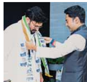
TMC national general Secretary Abhishek Banerjee with former Union Minister and sitting MP Babul Supriyo after the latter joined the Trinamool Congress in Kolkata on Saturday

Supriyo's joining the TMC comes close on the heel of at