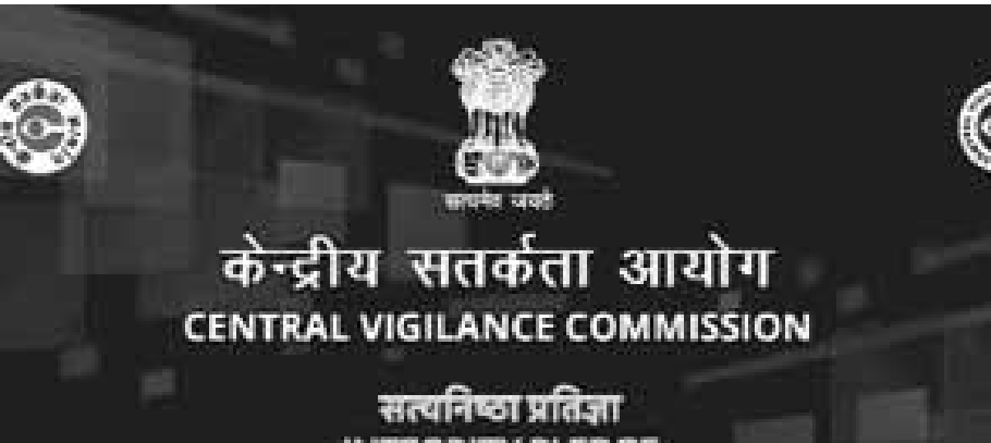
IANIS ■ NEW DELHI

The Central Vigilance Commission (CVC) has made recommendation for implementing the of Integrity Pact (IP) in all public procurements by the various Ministries and the Departments.