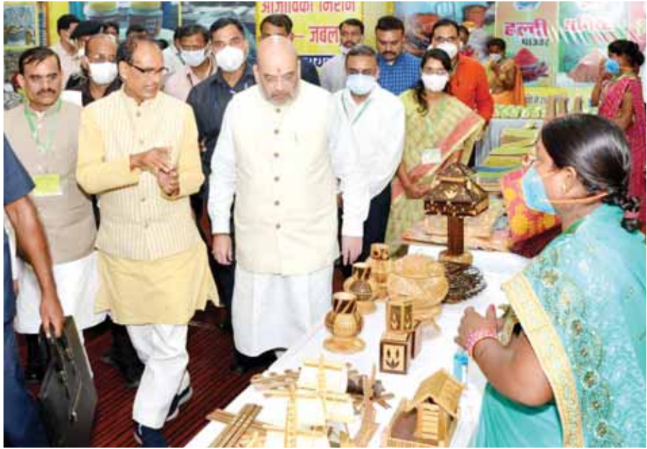
Union Home Minister Amit Shah along with Chief Minister Shivraj Singh Chouhan and BJP State President VD Sharma goes through an exhibition of the women self-help groups at Jabalpur, Madhya Pradesh on Saturday.

Members of district, block and village and ward level Crisis Management Committees also played an active role in providing vaccine protection cover to the citizens of the state. The members performed the role of motivator at the vaccination centers in urban and rural areas.