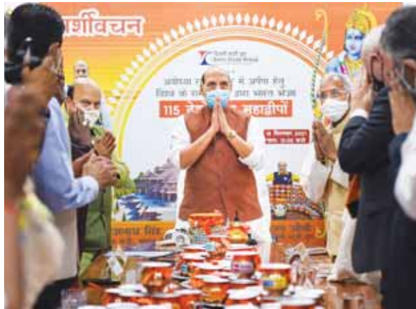
Defence Minister Rajnath Singh receives holy water from 115 nations for Ayodhya Ram Mandir, in New Delhi on Saturday