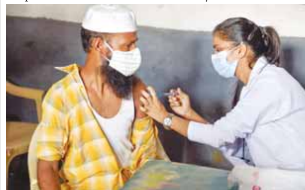
A beneficiary receives a dose of Covid-19 vaccine in New Delhi on Saturday

India took 85 days to touch the 10-crore vaccination mark, 45 more days to cross the 20-crore mark and 29 more days to reach the 30-crore mark, according to the Ministry.