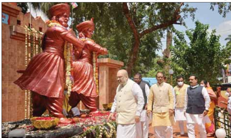
Union Home Minister Amit Shah along with Chief Minister Shivraj Singh Chouhan pays tributes to Raja Shankar Shah and Kunar Ragunath Shah on their martyrdom day in Jabalpur, Madhya Pradesh on Saturday

The Central Government is continuously working for the welfare of the poor, backward, tribal and downtrodden sections of the country. Since the first term of the Central Government in year 2014, the schemes made for the welfare of the poor are being implemented. Union Home Minister Amit Shah was addressing the launch program of Pradhan Mantri Ujjwala