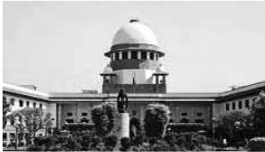
PTI ■ NEW DELHI

The Supreme Court is in favour of disbursing the over ₹25 crore deposited by the Maharashtra Government in the apex court registry five years ago to children who lost both parents during the Covid pandemic in the State.