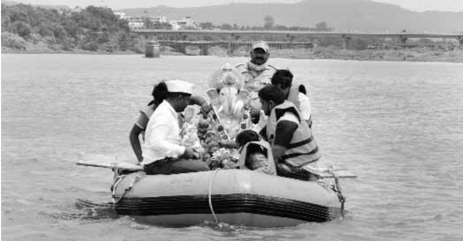
Municipal council workers carry an idol of Lord Ganesha on a boat to immerse in the Krishna-Koyna river during Ganesh Chaturthi celebrations in Karad district on Saturday