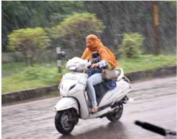
A young woman rides a two-wheeler during heavy spell of rain in Bhopal on Saturday

scheme is a unique PSU award scheme open to all employees in the company. The awards are given to recognize all-round excellence and contribution made by employees for the company's growth, profitability, customer satisfaction and Technological Development in addition to exemplary achievements made in sports, social or cultural work, etc. The award amount ranges from Rs 50,000 to Rs 2,50,000 for each team with a host of privileges for the awardees. The scheme has a rigorous internal screening process and the awardees are selected by an external jury.