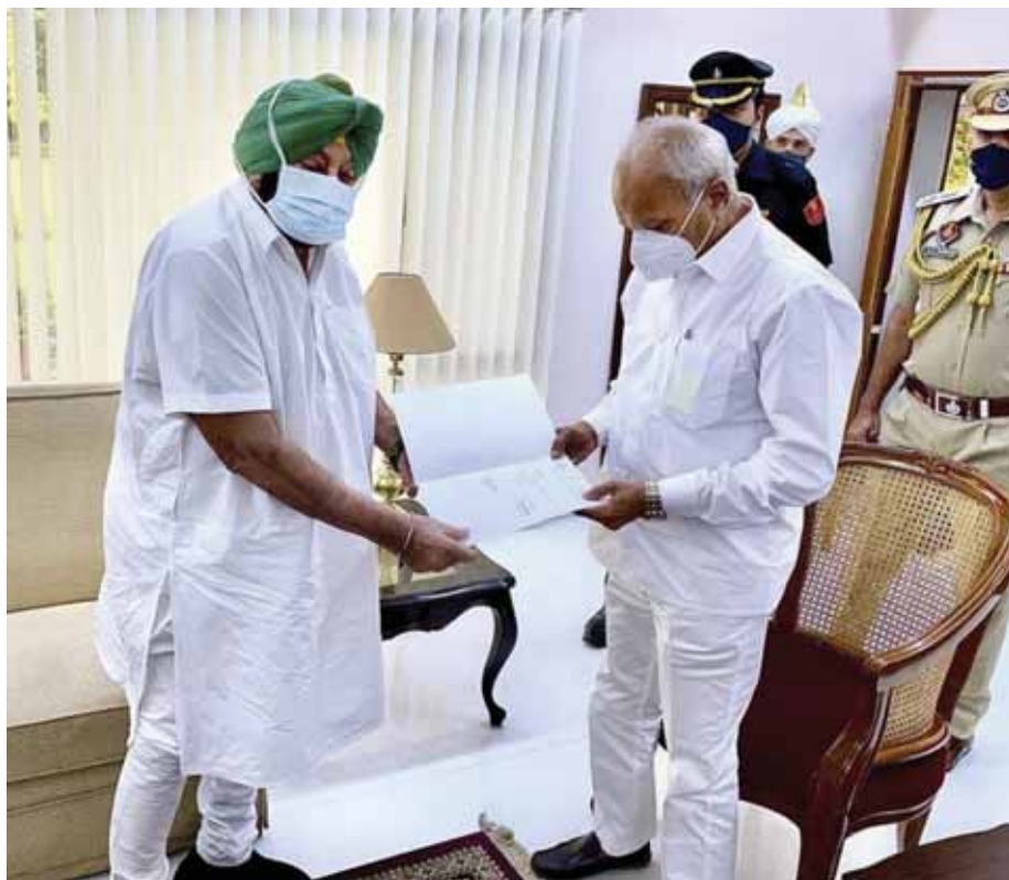
Punjab Chief Minister Capt Amrinder Singh submits his resignation to Governor Banwarilal Purohit at the Raj Bhavan in Chandigarh on Saturday

“States were also told to undertake regular reviews for priority implementation of emergency response package II to ensure preparedness with enough headroom, monitor infection spread in children considering that few States have opened schools, monitor breakthrough infections post-vaccination and analyse the emerging evidence, monitor mutations including sending sufficient samples for genome sequencing,” the Government said in a statement here.