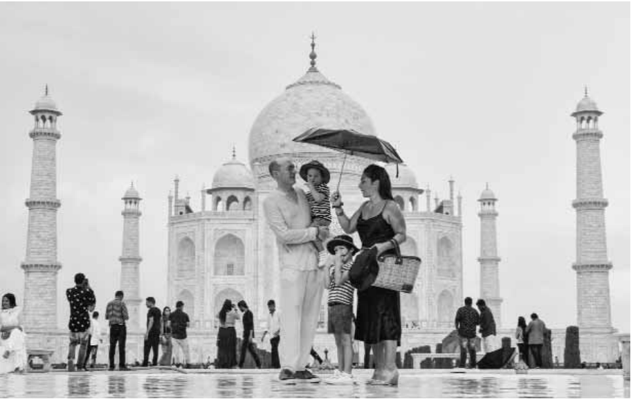
Tourists walk in the premises of Taj Mahal during rain in Agra on Saturday