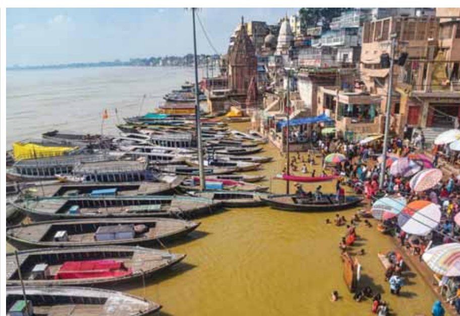
Boats anchored along the swollen Ganga river following heavy rain, in Varanasi on Saturday

Soon after he joined the BJP, the Union Government on Saturday scaled down the armed security cover of Central paramilitary commandos given to the Asansol MP. His security cover was reduced from the second-highest level of Z to Y category, sources said.