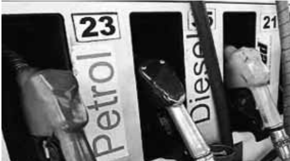
Centre on such output).

GST is being thought to be a solution for the problem of near-record high petrol and diesel rates in the country, as it would end the cascading effect of tax on tax (state VAT being levied not just on the cost of production but also on the excise duty charged by the