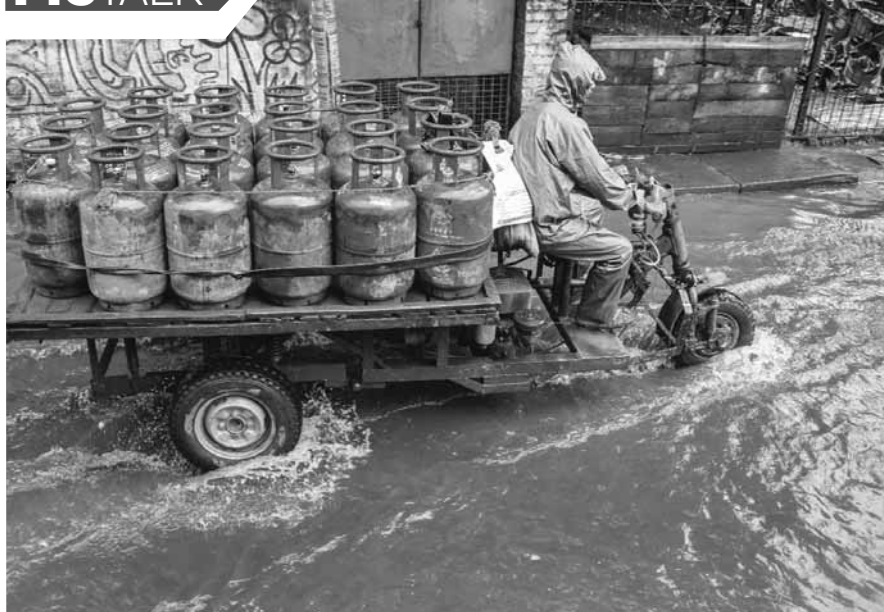
A man on a rickshaw wades through a waterlogged street during heavy rain in Nadia, West Bengal