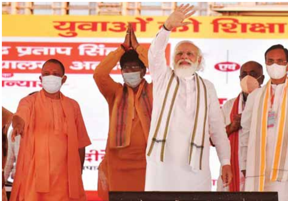
PM Narendra Modi during foundation stone laying of the Raja Mahendra Pratap Singh University in Aligarh on Tuesday

Adityanath, he said the Chief Minister has created an environment of investment in UP, wooing a large number of investors to the State.