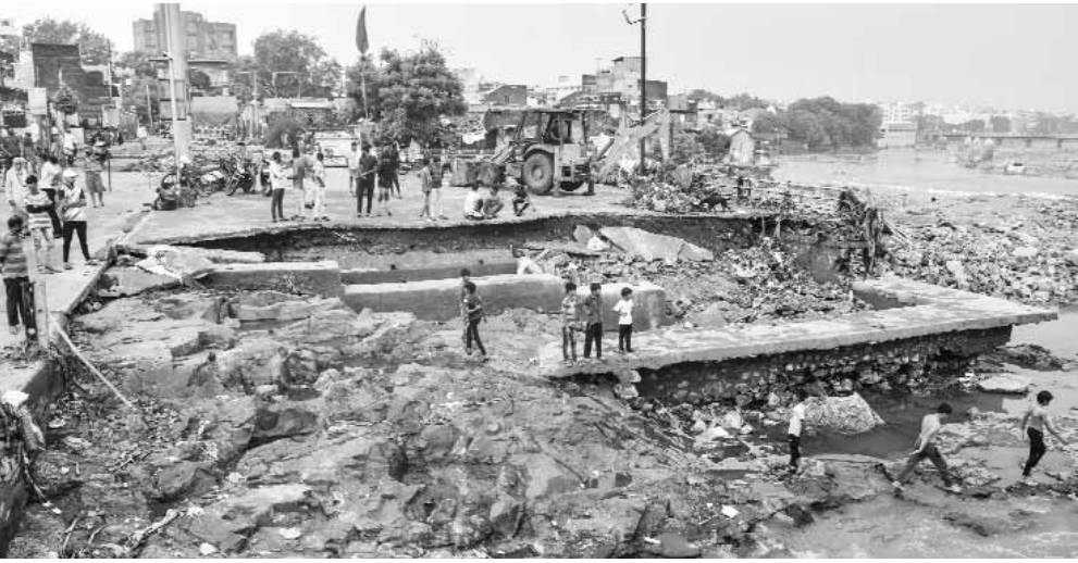
Boundary wall of the Aji river in front of the Ramnathpara temple collapsed due to heavy rains in Rajkot on Tuesday

Home Department or Dial 100 to see who is increasing the crime." He asked the PM to go through the NCRB report and also see which state has been served maximum notices by the National Human Rights Commission. Yadav said the PM should also ask the Uttar Pradesh CM who are the top 10 mafia in the state. All are aware how the CM withdrew cases against himself, he said. He also accused the ruling party of failing to honour its own leaders, referring to the foundation laying of a university after former Prime Minister Atal Bihari Vajpayee in Lucknow in 2019 and asked about its status.