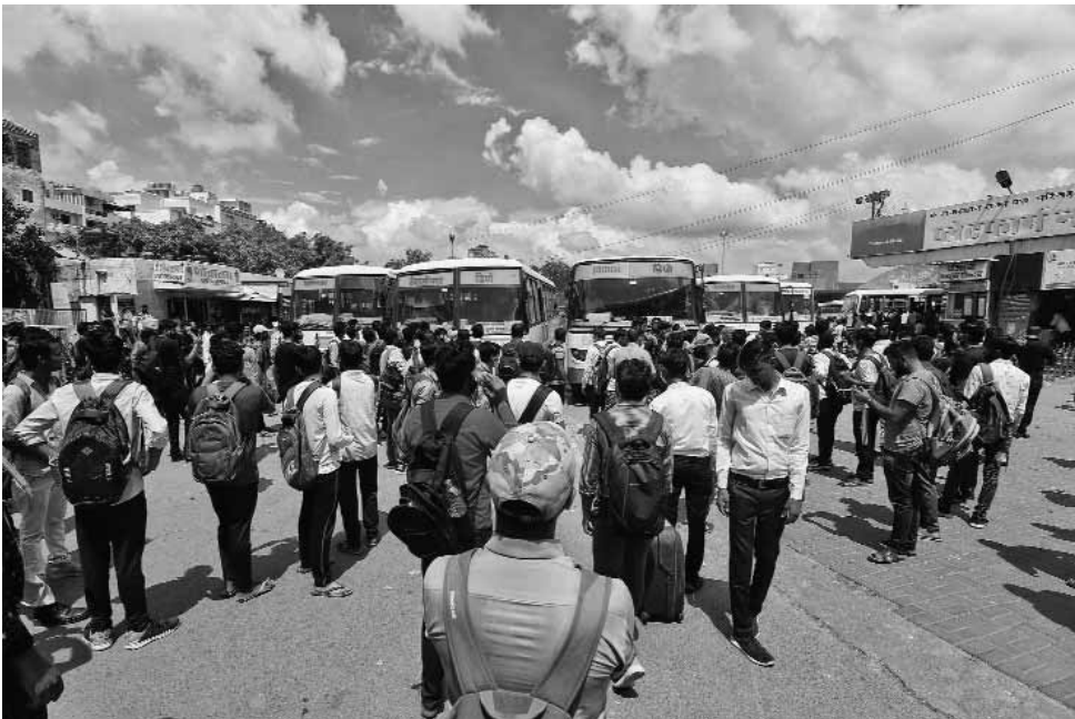
Crowded Sindhi Camp bus stand with candidates for Rajasthan Public Service Commission SI exam 2021, in Jaipur on Tuesday