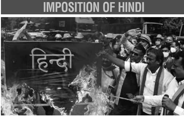
Kannada activists raise slogans and burn a poster during a protest on 'Hindi Divas' alleging that the Government is forcibly imposing Hindi language in Bengaluru on Tuesday

Bengaluru: In protest against the "imposition of Hindi", Kannada organisations on Tuesday held a twitter campaign and picketing in front of banks in several parts of Karnataka, on the occasion of Hindi Diwas. The Karnataka Rakshana Vedike (KRV) has organised a Twitter campaign with hashtag "#StopHindiImposition" from 10 am to 10 pm on Tuesday, while its activists staged picketing in front of banks in different parts of the State. KRV has tweeted pictures of its activists staging picketing in Sedam, Chincholi, Ron, Hungund, Hiriyur, Pandavapura, Bengaluru, Vijayapura, Kalaburagi, Chikkaballapura, Thirthahalli, Udupi, Uttara Kannada, Kolar, Mandya and