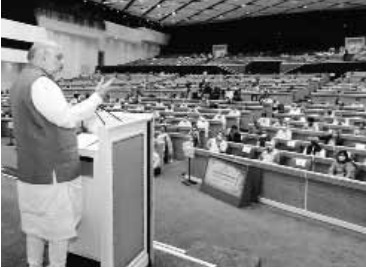
The Union Home and Cooperation Minister, Amit Shah, addresses at the Hindi Divas Samaroh 2021, in New Delhi on September 14

Since 2014, more MPs are speaking in their own regional language in