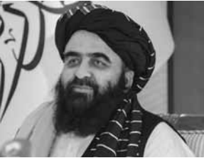
Foreign Minister in Afghanistan's new Taliban-run Cabinet, Amir Khan Muttaqi

Mottaqi gave little sign whether the Taliban will bend to the international pressure. He would not give say how long the