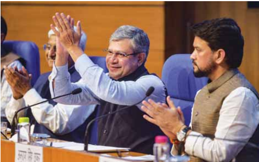
Union Ministers Anurag Thakur and Ashwini Vaishnav during a Press briefing on the Cabinet decisions at National Media Centre in New Delhi on Wednesday

Information and Broadcasting Minister Anurag Thakur said that ₹26,058 crore production-linked incentive (PLI) scheme for auto, auto-components and drone industries will enhance India's manufacturing capabilities. The PLI scheme will incentivize the emergence of advanced automotive technologies' global supply chain in India, added Thakur.