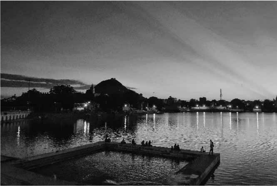
A view of the Pushkar Lake in Ajmer district on Wednesday