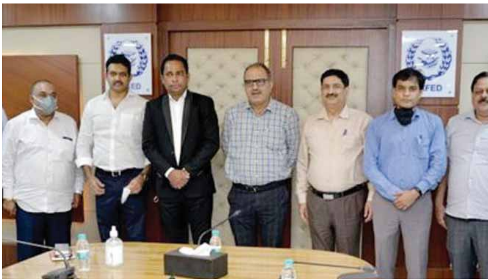
Sri Lankan delegation visits NAFED to explore mutual business avenues