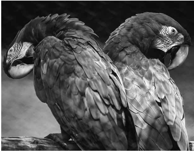
A pair of Macaw passing out time inside an enclosure at Alipore Zoological Garden that reopened for the public as it was closed due to a surge in coronavirus cases, in Kolkata on Wednesday

about two years. The CISF has been providing 'Y+' security cover to Arjun Singh since March 2019 when he left the Trinamool Congress and switched over to the BJP to win the Barrackpore parliamentary seat defeating then sitting MP Dinesh Trivedi. In fact Trivedi also crossed over to the BJP early this year. The decision of the Home Ministry comes days after National Investigation Agency was given to investigate the triple blast in front of the MP's house.