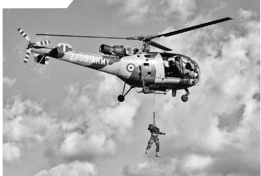
Army personnel during a practice session ahead of the celebration of 'Swarnim Vijay Varsh', at Polo ground in Jaipur