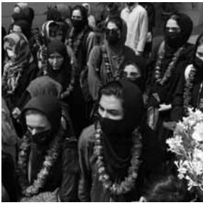
Afghanistan’s national women’s football team arrive in Lahore

footballers to Pakistan was initiated by British-based NGO Football for Peace in cooperation with the Government and the Pakistan Football Federation (PFF), which is not recognised by FIFA.