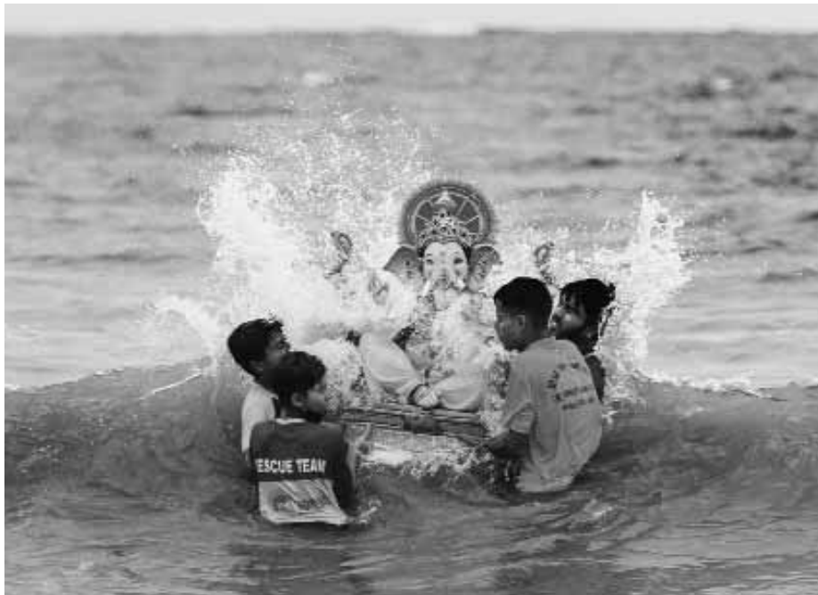
Immersion of an idol of Lord Ganesha on the last day of the Ganesh Chaturthi festival, in Mumbai on Sunday

Earlier this month, the DoS entered into a Framework MoU with two spacetechn startups -- Skyroot Aerospace and Agnikul Cosmos -- for access to ISRO facilities and expertise towards the development and testing of subsystems/systems of space launch vehicles. PTI