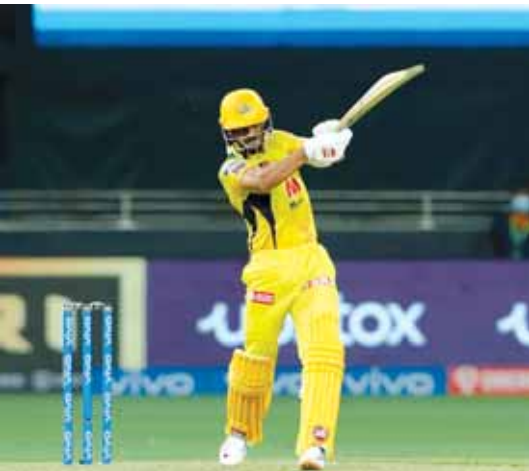
Ruturaj Gaikwad of Chennai Super Kings hitting a boundary during match 30 of the Vivo Indian Premier League between Chennai Super Kings and Mumbai Indians held at the Dubai International Stadium in the United Arab Emirates