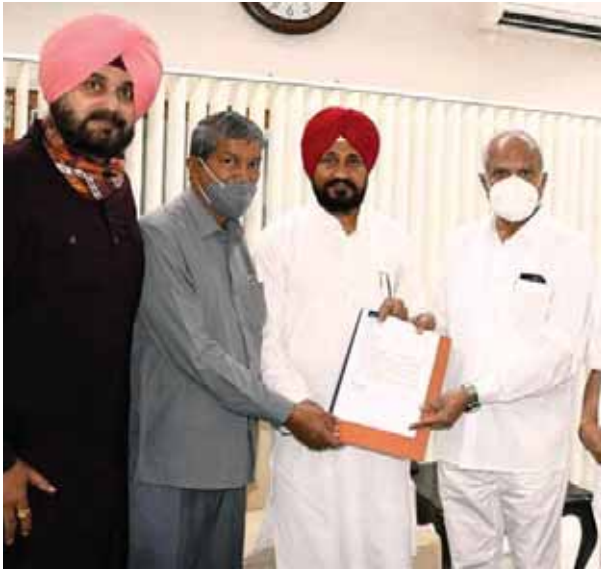
Punjab Chief Minister-designate Charanjit Singh Channi submits a letter to Punjab Governor Banwarilal Purohit after being named as the next CM, at the Raj Bhavan in Chandigarh on Sunday

The entire Congress leadership including party chief Sonia Gandhi, Rahul and his sister Priyanka Gandhi besides seniors like Harish Rawat, Adhir Ranjan Chaudhary, Pawan Bansal, Ajay Maken and Randeep Surjewala, were involved in setting the Punjab unit in order. Channi, 58, a three-time MLA from