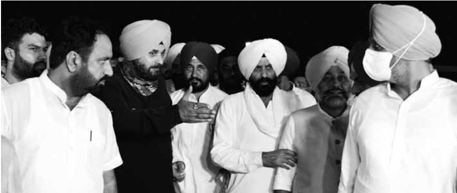
Punjab CM-designate Charanjit Singh Channi along with Navjot Singh Sidhu and other Congress leaders outside the Governor's residence in Chandigarh on Sunday.

He also picked up th Sidhu issue on his Twitter account saying, "Punjab, a border state, which sees regular infiltration, smuggling of illegal arms and narcotics from Pakistan, can't be trust with Navjot Singh Sidhu, who has ties with Pak PM and Army Chief, says Capt