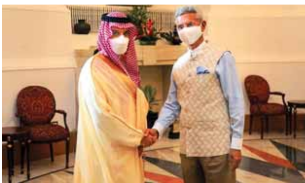
External Affairs Minister S Jaishankar welcomes Foreign Minister of Saudi Arabia Prince Faisal bin Farhan Al Saud during his visit to India

The visiting dignitary will meet Prime Minister Narendra Modi on Monday before ending his three-day visit to New Delhi. Al Saud arrived here on Saturday evening. It is the first ministerial visit from Saudi