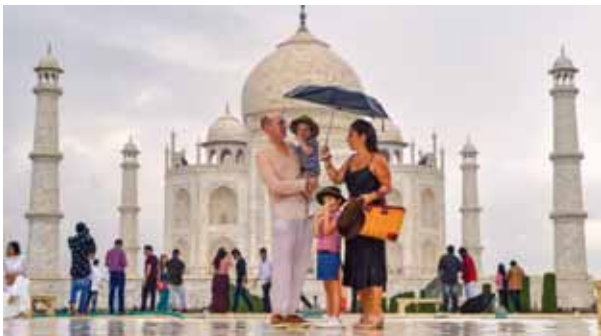
Tourists walk on the premises of Taj Mahal during the rain in Agra

Scheduled international passenger services have been suspended in India since March 23, 2020, due to pandemic. But special international flights have been operating under Vande Bharat Mission since May 2020 and under bilateral "air bubble"