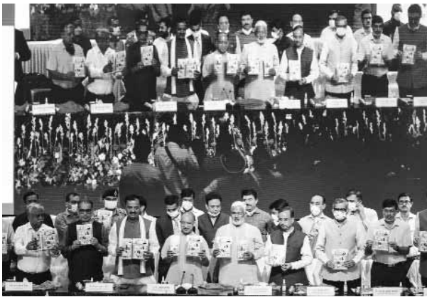
Uttar Pradesh Chief Minister Yogi Adityanath releases a book on completing 4.5 years of his Government at Lok Bhawan in Lucknow on Sunday

"In the 2022 Assembly elections, BJP will cross 350 seats (out of 403 seats), and