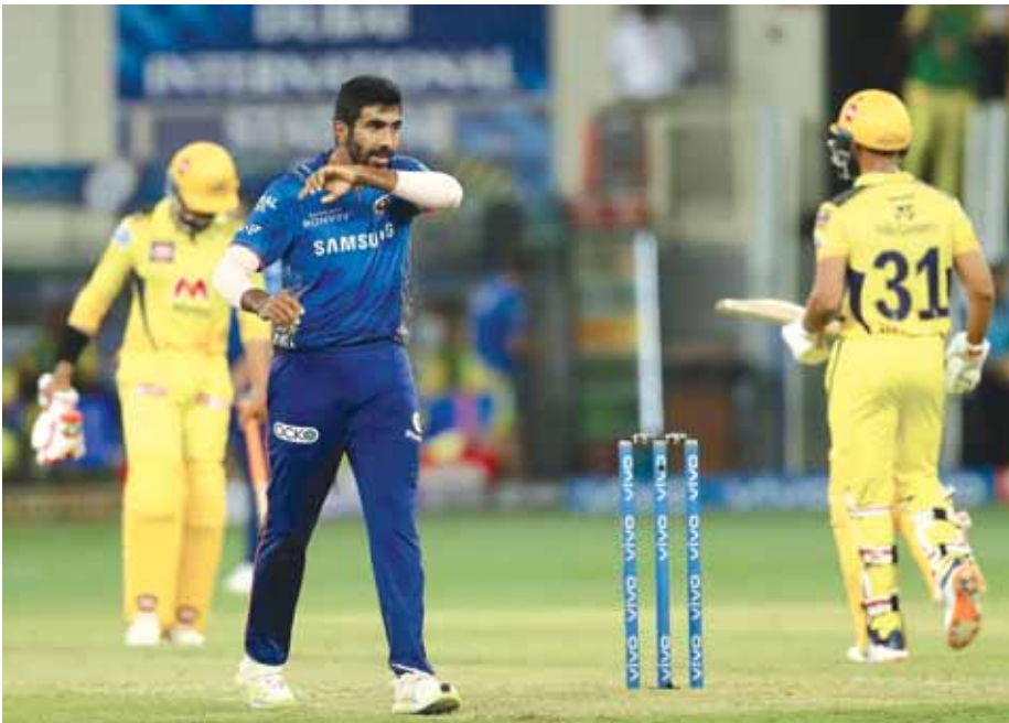
Jasprit Bumrah of Mumbai Indians during match 30 of the Vivo Indian Premier League between Chennai Super Kings and Mumbai Indians held at the Dubai International Stadium in the United Arab Emirates