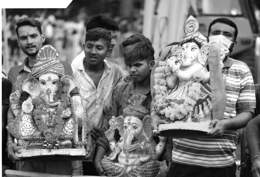
Devotees carry idols of Lord Ganesha to immerse them to mark Ganesh Chaturthi, in Ahmedabad