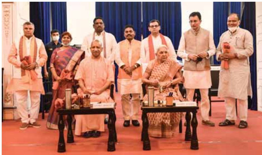
Uttar Pradesh Governor Anandiben Patel and Chief Minister Yogi Adityanath with newly sworn-in State Ministers during expansion of the Cabinet ahead of the UP Assembly elections in Lucknow on Sunday