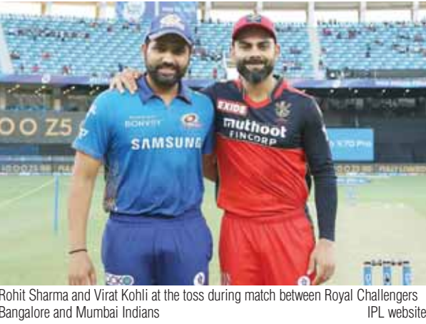
Rohit Sharma and Virat Kohli at the toss during match between Royal Challengers Bangalore and Mumbai Indians

Dubai: Glenn Maxwell finally came good with an attacking 56 after skipper Virat Kohli's second consecutive half-century, taking Royal Challengers Bangalore to a par-score of 165/6 against Mumbai Indians in the IPL here on Sunday. Kohli, who completed 10,000 runs in T20 cricket,