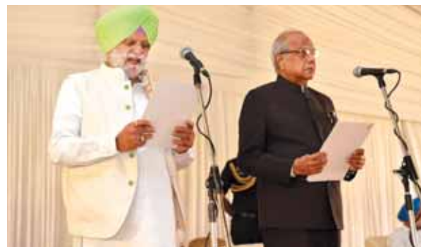
Punjab's Governor Banwarilal Purohit administers oath to Rana Gurjit Singh during the oath-taking ceremony of Punjab Cabinet Ministers on Sunday