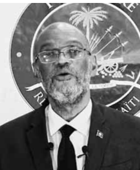
In this photo taken from video, Ariel Henry, Prime Minister of Haiti, remotely addresses the 76th session of the United Nations General Assembly in a pre-recorded message

"It is a debt to his memory, his family and the Haitian