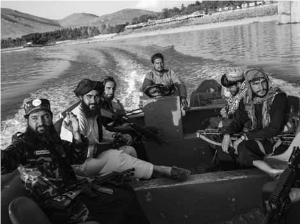
Taliban fighters enjoy a boat ride in the Qargha dam, outskirts of Kabul

The Taliban have promised an inclusive Government, a more moderate form of Islamic rule than when they last ruled the country from 1996 to 2001 including respecting women's rights, providing stability after 20 years of war, fighting ter-