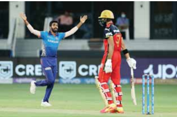
Jasprit Bumrah of Mumbai Indians celebrates the wicket of Devdutt Padikkal of RCB

and flicks during the final overs when he launched into MI pacers Adam Milne (1/48 in 4 overs) and Bumrah (3/26 in 4 overs) with utter disdain. Such was the ferocity of Maxwell's hits that even the normally calm MI skipper Rohit Sharma looked helpless before Bumrah removed both Maxwell and AB de Villiers (11 off successive deliveries which at least helped them save 20 to 25 runs in the final two overs. At the onset, Kohli hit the very second ball of the match from Trent Boult (1/17 in 4 overs) for a six. It was an inswinger which the RCB skip-