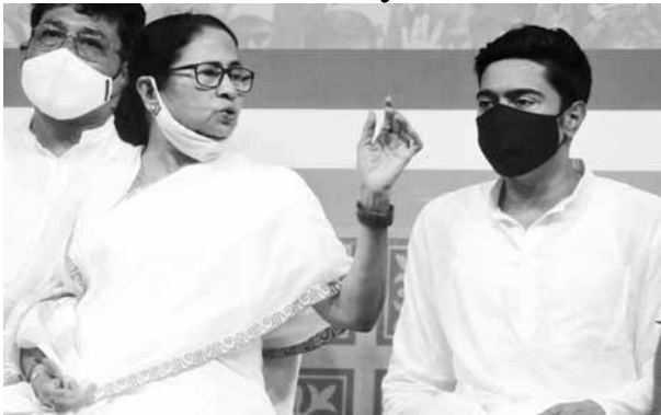
West Bengal Chief Minister and TMC party candidate from Bhabanipur constituency, Mamata Banerjee (L) with party general secretary and MP Abhishek Banerjee (R) during her election campaign for Assembly bypolls, in Kolkata on Sunday

from visiting Chicago ... they stopped me from going to China --- which however I did not mind on account of the recent diplomatic developments --- then they did not allow me to go to Cambridge ... I want to ask why ... why was I being stopped ... is there a political reason behind this..." Banerjee said asking the voters of Bhawanipore from where she is seeking a by-election to retain her Chief Ministerial chair.