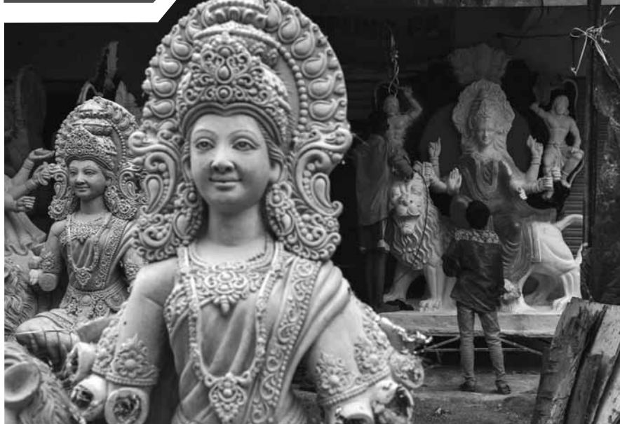
Goddess Durga’s idols being readied ahead of the Durga Puja, in Hyderabad