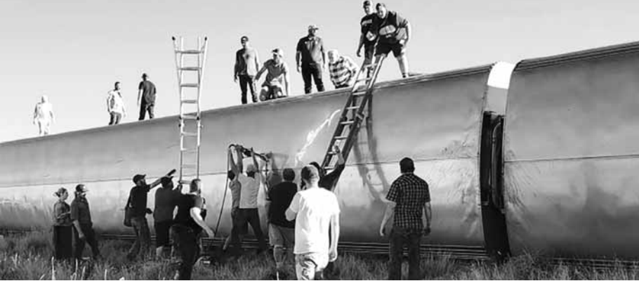
people work at the scene of an Amtrak train derailment on Saturday