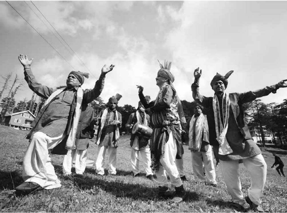
Artists perform during the second day of the monsoon festival at Patnitop on the outskirts of Jammu on Sunday

"The MSP (minimum support price) of the early variety has been increased from ₹325 per quintal to ₹ 350 per quintal. Similarly, the MSP of the ordinary variety has been increased to ₹340 per quintal from ₹315 per quintal. As far as the rejected variety is concerned, its MSP has been increased from ₹305 per quintal to ₹330 per quintal."