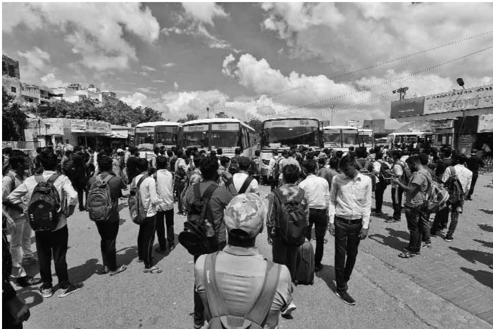
Crowded Sindhi Camp bus stand with candidates for Rajasthan Public Service Commission SI exam 2021, in Jaipur on Tuesday