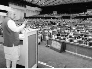
The Union Home and Cooperation Minister, Amit Shah, addresses at the Hindi Divas Samaroh 2021, in New Delhi on September 14

Since 2014, more MPs are speaking in their own regional language in