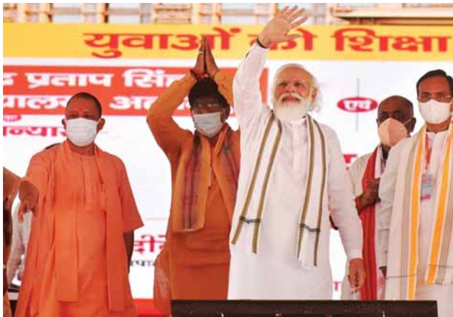
PM Narendra Modi during foundation stone laying of the Raja Mahendra Pratap Singh University in Aligarh on Tuesday

Praising the work of Yogi Adityanath, he said the Chief