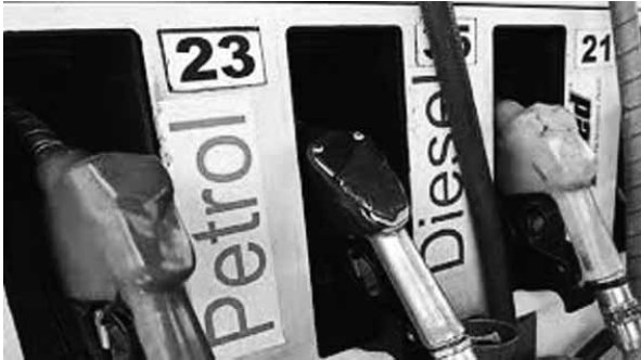
Centre on such output).

GST is being thought to be a solution for the problem of near-record high petrol and diesel rates in the country, as it would end the cascading effect of tax on tax (state VAT being levied not just on the cost of production but also on the excise duty charged by the