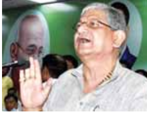
JD(U)'s new national president and MP, Rajiv Ranjan Singh, alias Lalan Singh

The JD(U) has also decided to "strongly fight" the upcoming Assembly polls in Uttar Pradesh and Manipur. The JD(U) has, earlier, been quite unhappy with the BJP that it had led its six of the seven MLAs in Arunachal Pradesh to the saffron fold in