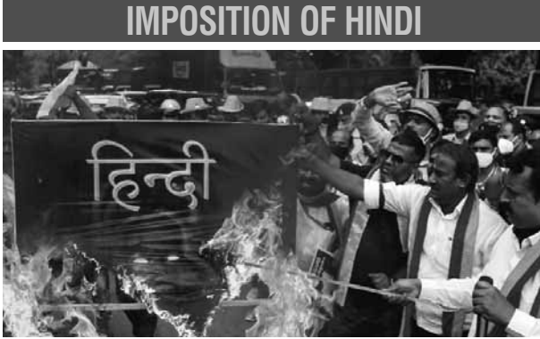
Kannada activists raise slogans and burn a poster during a protest on 'Hindi Divas' alleging that the Government is forcibly imposing Hindi language in Bengaluru on Tuesday

Bengaluru: In protest against the "imposition of Hindi", Kannada organisations on Tuesday held a twitter campaign and picketing in front of banks in several parts of Karnataka, on the occasion of Hindi Diwas. The Karnataka Rakshana Vedike (KRV) has organised a Twitter campaign with hashtag "#StopHindiImposition" from 10 am to 10 pm on Tuesday, while its activists staged picketing in front of banks in different parts of the State. KRV has tweeted pictures of its activists staging picketing in Sedam, Chincholi, Ron, Hungund, Hiriyur, Pandavapura, Bengaluru, Vijayapura, Kalaburagi, Chikkaballapura, Thirthahalli, Udupi, Uttara Kannada, Kolar, Mandya and