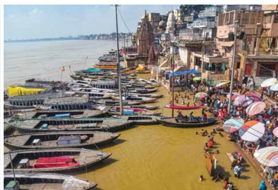
Boats anchored along the swollen Ganga river following heavy rain, in Varanasi on Saturday

It had launched searches against the 48-year-old actor and the Lucknow-based group of industries involved in the infrastructure sector on September 15 and the CBDT said the action was continuing.