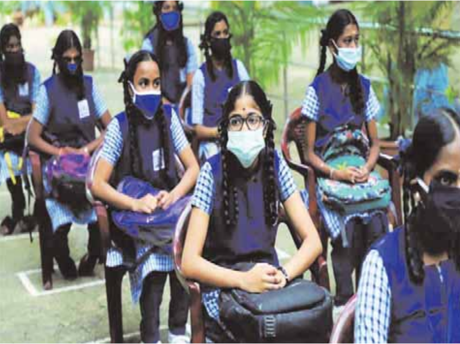
DEHRADUN