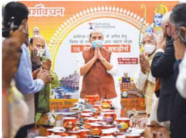
Defence Minister Rajnath Singh receives holy water from 115 nations for Ayodhya Ram Mandir, in New Delhi on Saturday