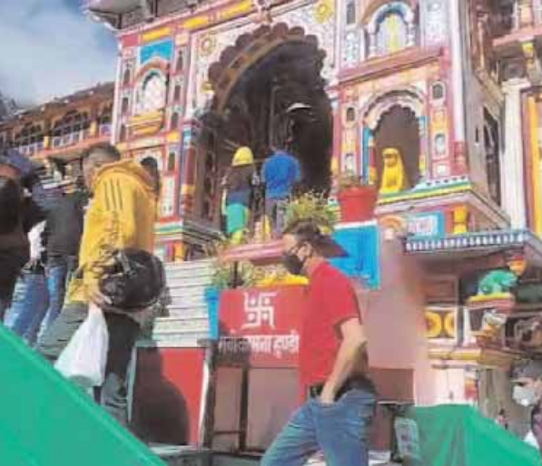
DEHRADUN

More than 419 pilgrims visited the Char Dham shrines in Uttarakhand on the first day after its start on Saturday. At the same time 19,491 persons have been issued e-passes by the Char Dham Devasthanam Management Board for visiting the Char Dham shrines.