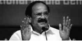
NEW DELHI

In a first of its kind observation by any presiding officer of the legislatures in the country and in the context of rising disruptions, Rajya Sabha Chairman M Venkaiah Naidu on Saturday unequivocally held that disruptions of proceedings amount to contempt of the House and disruptors can't claim it as their privilege to do so.