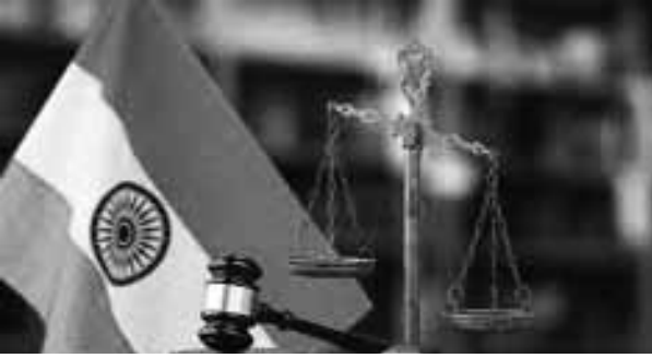
PTI ■ NEW DELHI

The Supreme Court has said that courts can exercise their power to proceed against persons not accused but appearing to have committed an offence only when there is "strong and cogent evidence" against such individuals and not in a "casual and cavalier manner".