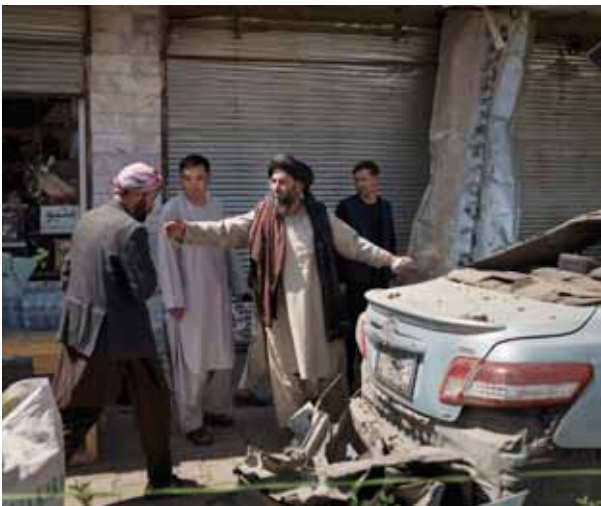
Taliban fighters and residents gather at the site of an explosion in Kabul on Saturday. A sticky bomb exploded in the capital Kabul