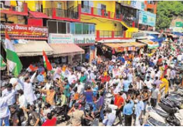
PNS ■ DEHRADUN ■ HARIDWAR

Currently, certain colleges of Uttarakhand have started their offline classes again after a gap of a year. The students have been given the option to continue their classes online or rejoin offline classes. With growing concerns of a possible third wave of the pandemic, most students are hoping that in the case of yet another year of online classes, the universities would be able to manage online education better and not repeat their past mistakes.