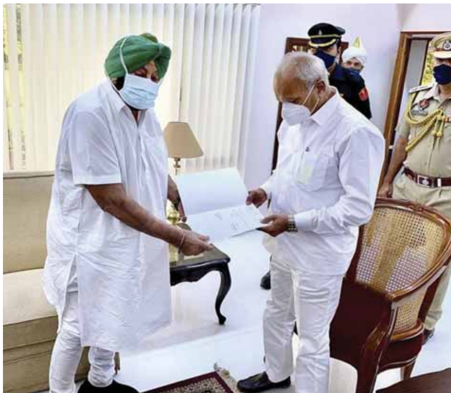
Punjab Chief Minister Capt Amarinder Singh submits his resignation to Governor Banwarilal Purohit at the Raj Bhavan in Chandigarh on Saturday

"I was humiliated three times by the Congress leader-