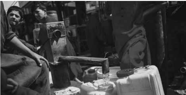
Afghan children collect water from a public water pump in Kabul on Thursday

Afghanistan is scheduled to address the ongoing UN General Assembly session on September 27.