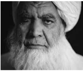
Taliban leader Mullah Nooruddin Turabi poses for a photo in Kabul

"Everyone criticized us for the punishments in the stadium, but we have never said anything about their laws and