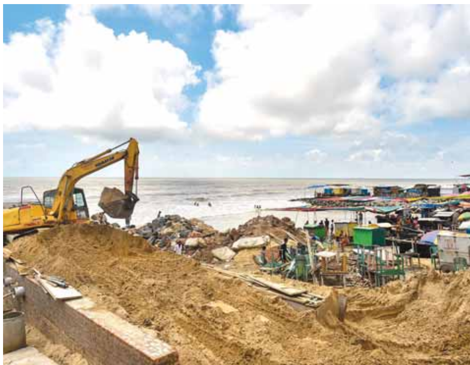
Restoration work in progress at the Yaas cyclone affected Udaypur beach near Digha in Midnapore district on Thursday

The drugs haul relates to the DRI seizing a staggering 2,988.21 kg Afghan heroin, worth ₹21,000 crore, from the Mundra port in the Kutch district of Gujarat on September 15.