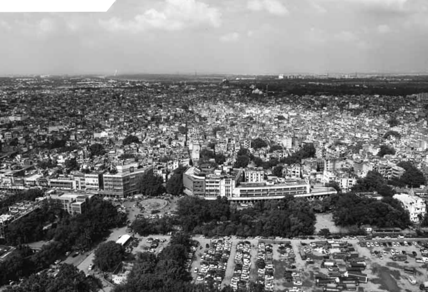
Clouds hover over the Old City area in Delhi