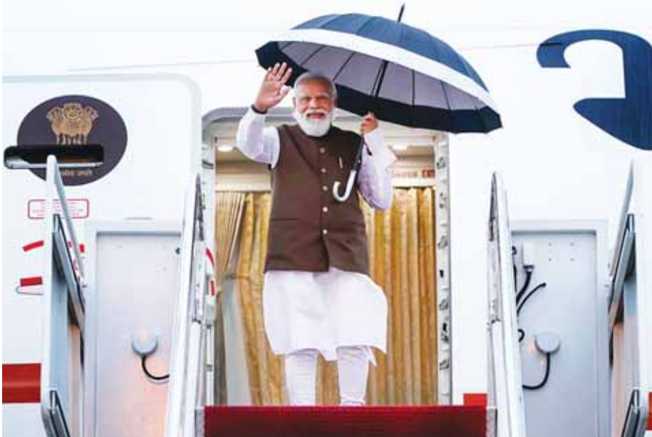
Prime Minister Narendra Modi being received by the dignitaries, on his arrival in Washington DC on Thursday