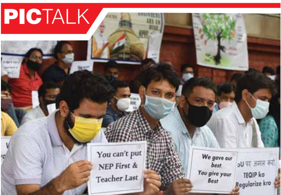
Assistant Professors who had graduated from IITs/NITs, stage a protest at Mandi House demanding retention/regularisation of jobs, in New Delhi on Sunday

The DJB supplies around 935 million gallons of water per day (MGD) against the demand of 1,140 MGD.