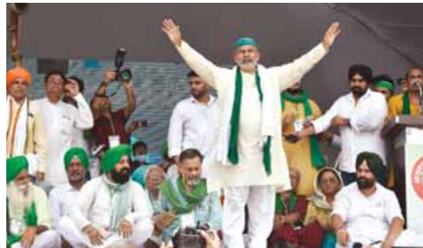
Bharatiya Kisan Union spokesperson Rakesh Tikait addresses the 'Kisan Mahapanchayat' over the ongoing farmers' agitation against the Centre's farm laws, in Muzaffarnagar on Sunday

While addressing the Mahapanchayat, Bharatiya Kisan Union spokesperson Rakesh Tikait called Prime Minister Narendra Modi and other BJP leaders "rioters" and said the party should be given a drubbing in the 2022 UP Assembly polls. The farmer unions also announced that the