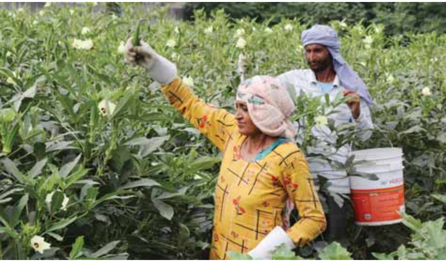
Farmers harvest ladyfingers in a field on the outskirts of Jammu on Sunday