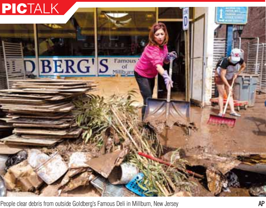
People clear debris from outside Goldberg's Famous Deli in Millburn, New Jersey