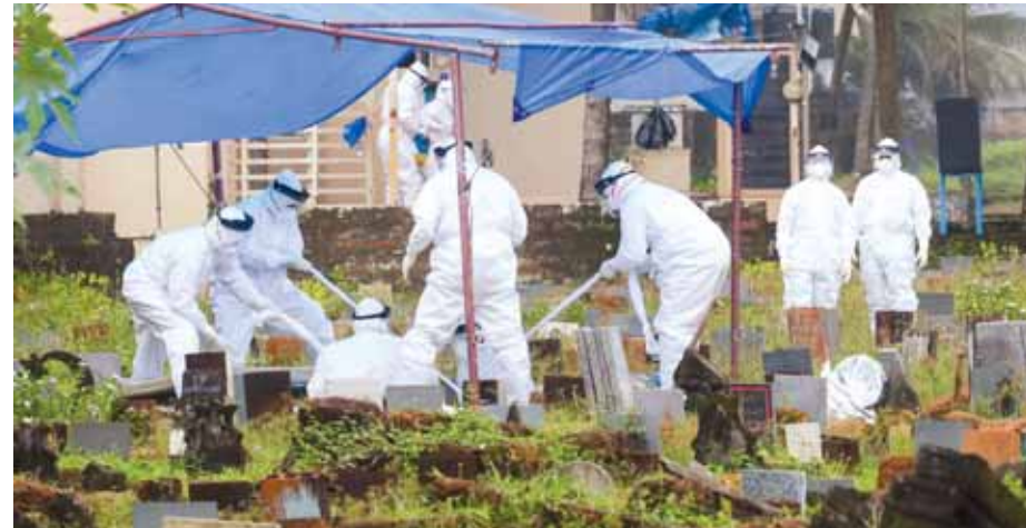
Health workers bury the body of a 12-year-old Nipah virus victim, at Kannamparambu cemetery in Kozhikode on Sunday

The boy came from Choolur in Chathamangalam panchayat and was admitted to