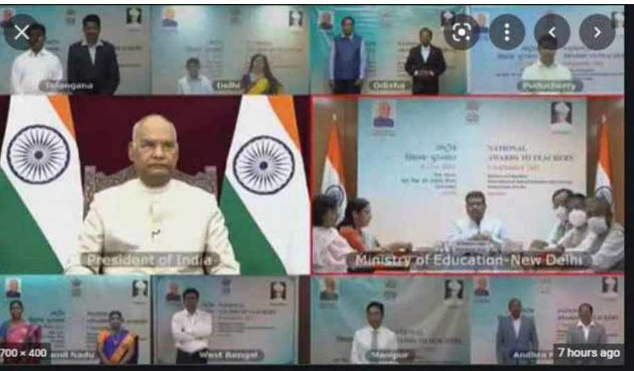
President Ram Nath Kovind confers 44 teachers with National Awards, via video conference

izens, strengthen the feeling of love for the country. The president reminded that it is the duty of teachers to inculcate interest in studies in their students and sensitive teachers can shape the future of students by their behaviour, conduct and teaching. Speaking on Teachers' Day, Kovind remembered Dr Sarvepalli Radhakrishnan and said he was known as a philosopher and scholar across the world. However, he wanted to be remembered only as a teacher. President said, he has left an indelible mark as a great teacher.