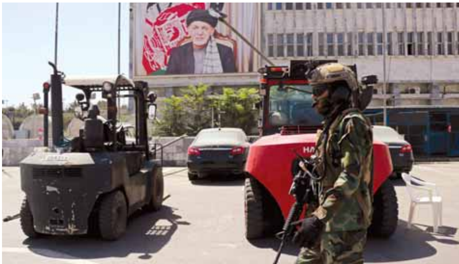
A Taliban soldier patrols the Hamid Karzai International Airport in Kabul, Afghanistan on Sunday