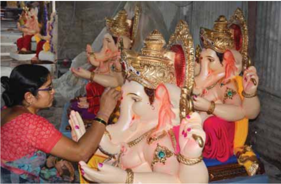
A woman artist gives final touches to an idol of Lord Ganesha ahead of Ganesh festival, in Karad on Sunday

In the purported audio clip, the girl tells her aunt that on one occasion her father took her in his car on the pretext of buying her a mobile phone and raped her. PTI