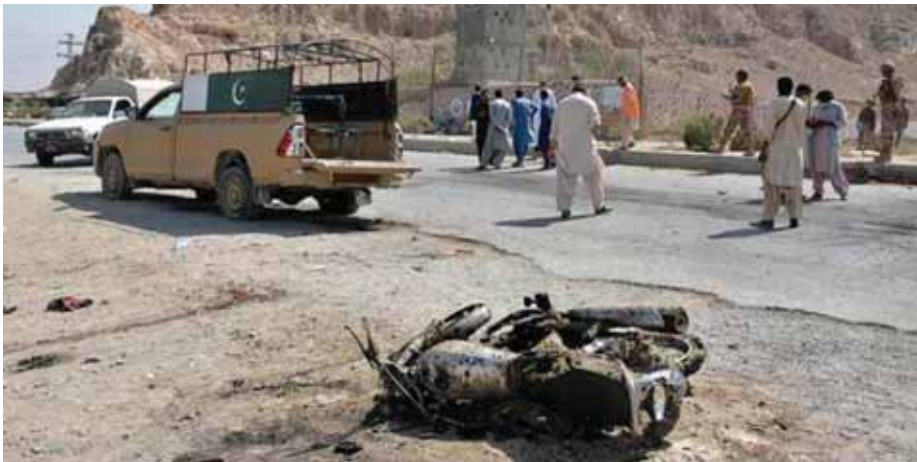
Security officials examine the site of a suicide bombing at a checkpoint on the outskirts of Quetta, Pakistan on Sunday.

The banned Tehreek-e-Taliban Pakistan (TTP)