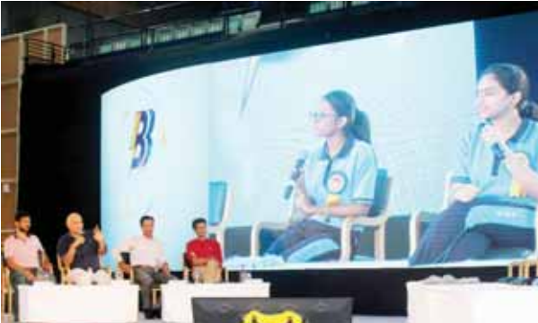
Delhi Deputy Chief Minister and Education Minister Manish Sisodia with the Delhi Government School students and others at the launch of Business Blasters programme for Delhi Government school students, at Thyagaraj Stadium, in New Delhi on Tuesday