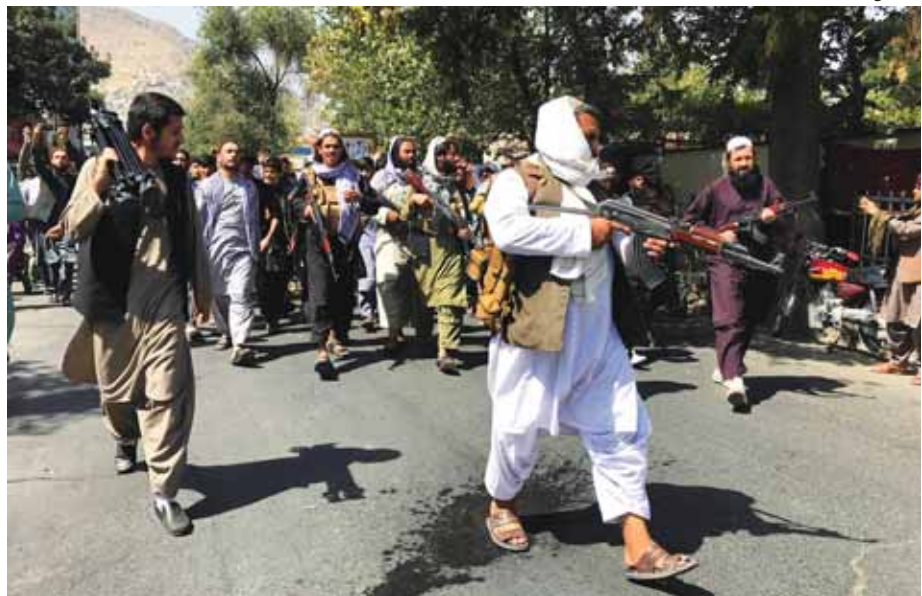
Taliban soldiers walk towards Afghans shouting slogans, during an anti-Pakistan demonstration, near the Pakistan embassy in Kabul, Afghanistan on Tuesday