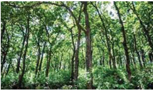
PNS ■ NEW DELHI

The Regional Empowered Committee (REC) of the Environment Ministry has "in-principle" approved a proposal for diversion of 8.11 hectares of "deemed forest" land, where the Indira Gandhi National Centre for the Arts (IGNCA) stood that is being redeveloped as the Central Vista. Three buildings will come up in the area. The final approval for diversion of forest land is to be granted by the Central government. In August, the Delhi government had recommended the proposal for approval of the REC "in larger public interest subject to the conditions laid by the forest department". There are more than 250 trees per hectare at the site. Therefore, it was treated as "deemed forest" and required approval for diversion for non-forest activity under the Forest Conservation Act, 1980, a Delhi forest department official said. Of the existing 2,219 trees at the site, the Central Public Works Department (CPWD) seeks to transplant 1,734 and retain 485 trees. The three office buildings, which will be part of the Common Central Secretariat, are to be built at a cost of Rs 3,269 crore, with Rs 139 crore set aside for five years' maintenance. The REC approved the CPWD's proposal in a meeting held on August 24 subject to certain conditions. It said the land for compensatory afforestation should be made available to the Delhi Forest Department, free of all the encroachments and encumbrances, within 15 days of the approval and compliance submitted to Integrated Region Office, Jaipur.