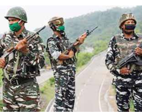
RAKESH K SINGH ■ NEW DELHI

The Union Home Ministry has turned down a proposal from the CRPF to increase the number of days of Casual Leave from 15 to 28 days saying terming the Central Armed Police Forces like CRPF to be "essentially civilian forces" and their service conditions are different from defence forces. Recently, the Ministry had labeled the CRPF as a security force for introducing the Security Force Court for taking timely disciplinary action against the delinquent Group A officers. The Ministry has also articulated variable stances on the nature of these forces as civilian or armed forces. Under the Constitution, CAPFs are "Armed Forces of the Union" under the Union Home Ministry, officials said. The move could also derail Union Home Minister Amit Shah's articulation on December 29, 2019 to ensure that the troops get to spend 100 days in a year with their families. "The proposal of the CRPF has been examined and it has been decided to not to agree to the same in light of the recommendation of the 7th Central Pay Commission (CPC)", the Ministry said in a communication earlier this