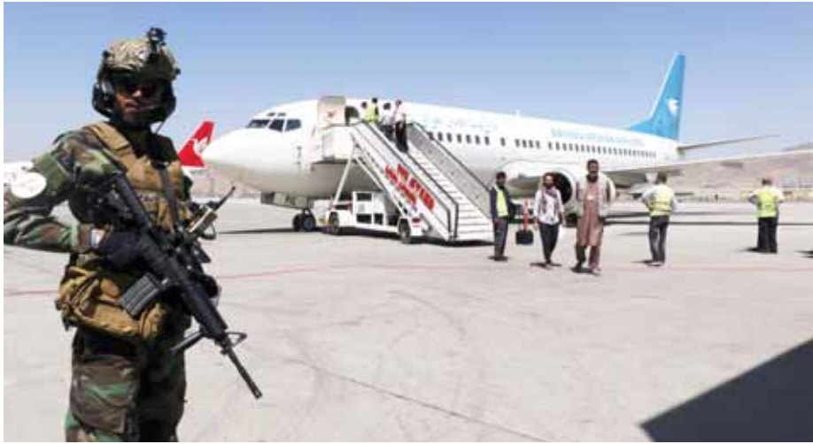
A Taliban soldier stands guard at Hamid Karzai International Airport in Kabul, Afghanistan

She says the American citizens she has met in the group are vulnerable people in their 70s, parents of Afghan Americans in the United States.