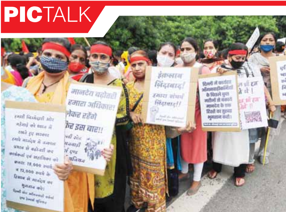
Delhi State Anganwadi Workers protest against the Government in front of the Delhi Secretariat in New Delhi on Tuesday

Each of the seven locations will have a total of six charging points each, 3 of which will be for two and three wheelers and three points for four wheelers. Once installed, these locations with their real-time status and availability of charging points will also be available on the ONE DELHI App of the Delhi Government. SR