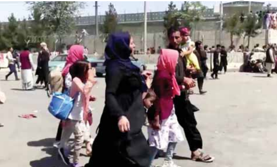
■ NEW DELHI

India and Russia will on Wednesday hold extensive talks on the Afghanistan situation here during the meeting of Secretary of Security Council General Nikolay Patrushev and National Security Adviser (NSA) Ajit Doval. He had invited his Russian counterpart for the parleys. These discussions will take place a day ahead of Prime Minister Narendra Modi likely to flag India's concerns about the scenario in Afghanistan in the Brazil, Russia, India, China and South Africa (BRICS) summit on Thursday. Moreover, he is likely to raise the issue of terrorism in the presence of Pakistan Prime Minister Imran Khan in the Shanghai Cooperation Organisation (SCO) meeting on September 15. In both these high level interactions Russian President Vladimir Putin will be present as Russia is an important part of the SCO and BRICS. Modi will virtually address both these summits. As regards the meeting