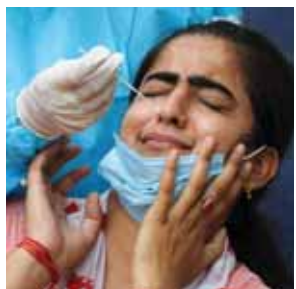
A health worker takes a swab sample of a woman in Jammu on Tuesday

In a study published in Nature journal, a team of researchers from India and other countries has found that the Delta variant (or B.1.617.2 lineage) was eight times more likely to escape immunity gained through AstraZeneca or Pfizer vaccines compared to the original virus. Also, the Delta