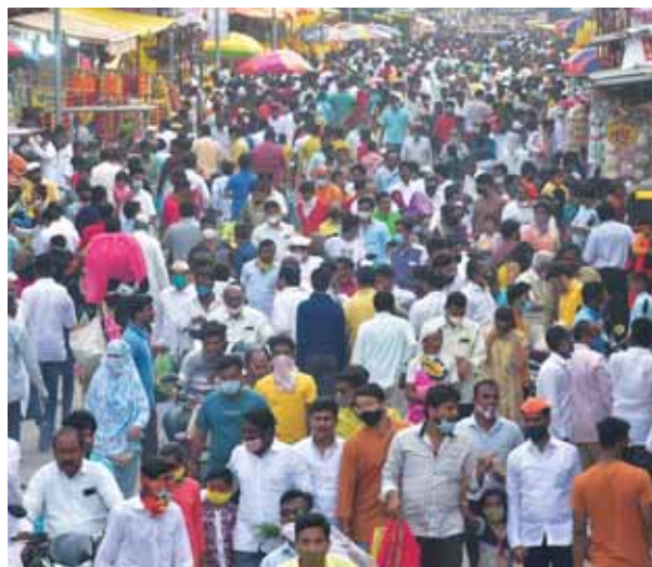
People, flouting Covid-appropriate behaviour, visit a crowded market on the occasion of Ganesh Chaturthi festival in Solapur on Friday

The meeting comes a day after Union Health Secretary Rajesh Bhushan said India is still going through the second wave of Covid-19 and it is not over yet. He had said 35 districts are still reporting a weekly Covid positivity rate of over 10 per cent, while it is between five and 10 per cent in 30 districts. More than half of India's adult population has received at least one dose of anti-coronavirus vaccine while 18 per cent have got both the shots, the Union