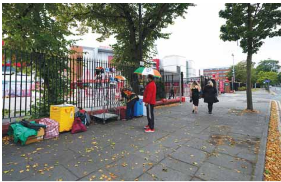
A street vendor selling souvenirs packs up his stall outside Old Trafford cricket ground after fifth and final cricket test match between England and India was canceled in Manchester, England, on Friday

"In lieu of the strong relationship between BCCI and ECB, the BCCI has offered to ECB a rescheduling of the cancelled Test match. Both the