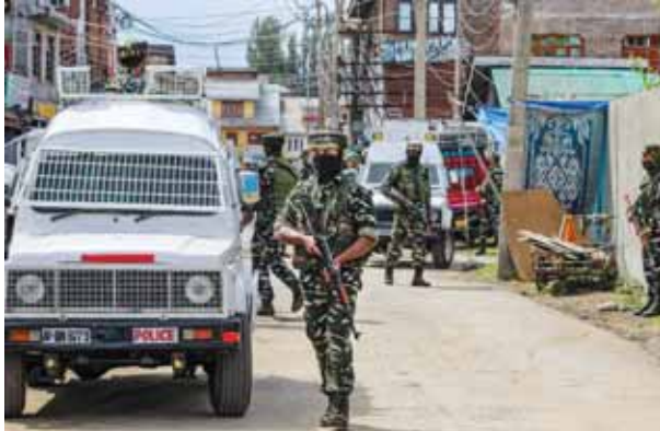
Security personnel cordon off the area and search for militants after a grenade attack on the force at Channapora in Srinagar on Friday

According to sources, he was tortured and executed by