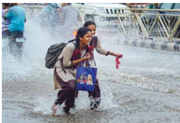
School students walk along a street after heavy rain in Amritsar on Friday

This is the first time since 2010 that monsoon rainfall in