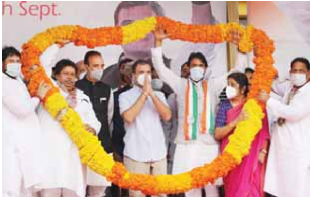
Congress MP Rahul Gandhi being garlanded by party leaders during an office bearers sammelan in Jammu on Friday

with a delegation of Kashmiri Pandits on Friday morning, he said, "During the meeting, I realised that I am part of this delegation. My family is also a Kashmiri Pandit family and I am a Kashmiri Pandit. Therefore, I want to say here that I don't lie and I want to tell my Kashmiri Pandit brethren that I will help you."