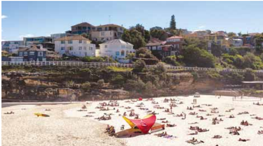
(Clockwise from top left): Steep staircase on the way to Clovelly Beach; Waverly Cemetery; the beachside cafes have a variety of food and drinks; the sea makes for a perfect backdrop for pictures; Bondi Beach and Aamir Khan during the shoot of Tanhayee which has made the spot popular with Indian tourists

Traipsing through a graveyard may not be everyone's idea of fun. People like me