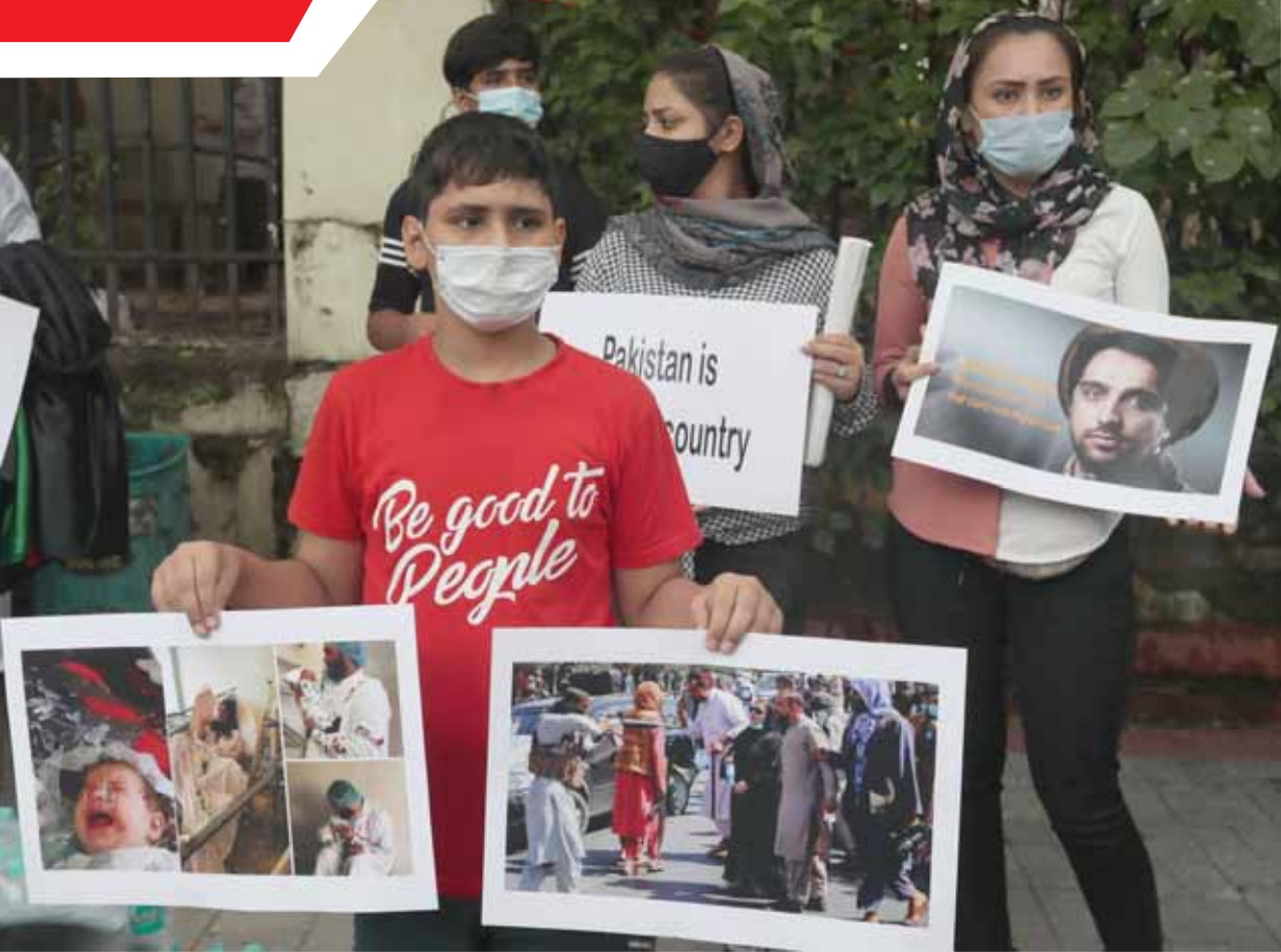
Afghan refugees during a protest against the Taliban takeover of Afghanistan, in New Delhi on Friday