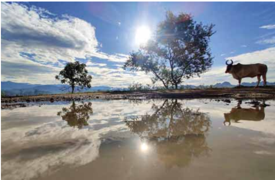
A view of the blue sky covered with clouds at a village in Hamirpur on Friday

Highly placed sources said that more than 20 lawmakers are among the Myanmar nationals, who took shelter in Mizoram. PTI