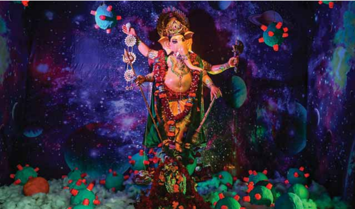
A Lord Ganesha idol depicted as the slayer of coronavirus at a community puja pandal on the occasion of Ganesh Chaturthi festival in Kolkata on Friday